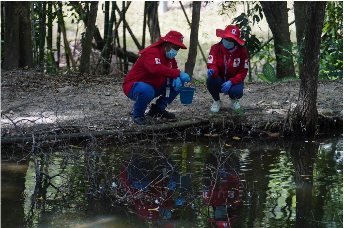
Resul Water sampling for chemical level monitoring and potability testing as part of Water, Sanitation and Hygiene readiness actions.