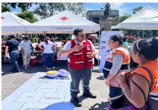
Anticipatory Action fair held under the National Dialogue Platform on Anticipatory Action, October 2025.

The IFRC Disaster Response Emergency Fund (DREF) has allocated CHF 544,464 for the implementation of anticipatory actions to reduce and mitigate the impact of drought in El Salvador under EAP2024SV01 . This Early Action Protocol includes an allocation of CHF 306,904 for readiness and prepositioning to undertake annual preparedness actions and ensure timely implementation of early actions if and when the trigger is reached. The early actions have been pre agreed with the National Society and are described in the Early Action Protocol summary .