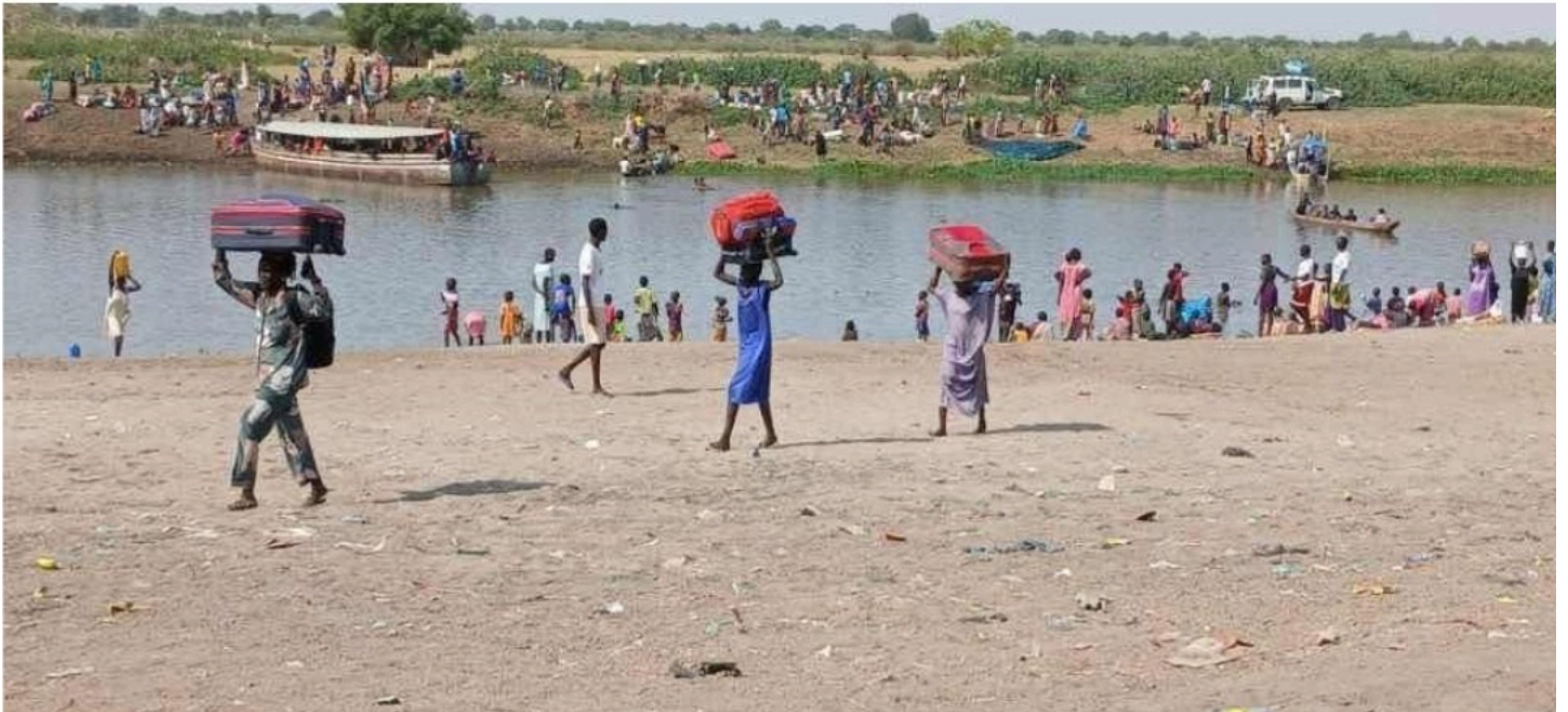
SOUTH SUDAN ASYLUM SEEKERS CROSSING THE RIVER TO AKOBA KEBELE ETHIOPIA