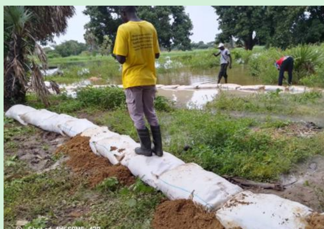
Bags filled with sand by community members to stop water overflows in Moyen Chari Province