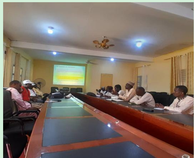
Meeting, information of stakeholders on the sEAP in Amtiman in the province of Salamat