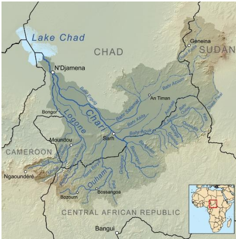
Hydrographic Map of Chad

The IFRC Disaster Response Emergency Fund (DREF) has allocated CHF 122,718 for the implementation of anticipatory actions to reduce and mitigate the impact of (rainfall flooding) in (Chad). This simplified Early Action Protocol includes an allocation of CHF 73,734 to preposition stock and undertake annual readiness activities in order to implement early actions, if and when the trigger is reached. The early actions to be conducted have been pre-agreed with the National Society and are described in the simplified Early Action Protocol. This report summarizes the annual readiness and preposition activities done in the reporting period.