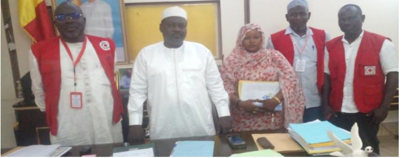
Information meeting on the validation of the simplified PAP with the General Delegate of the Government to the province of Moyen-Chari