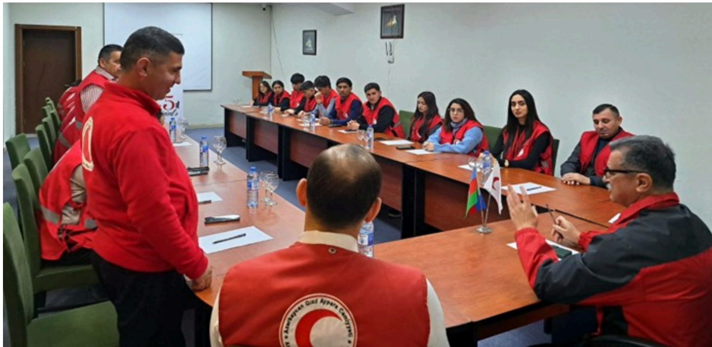
Operational meeting of the AzRCS President at the Lankaran regional branch