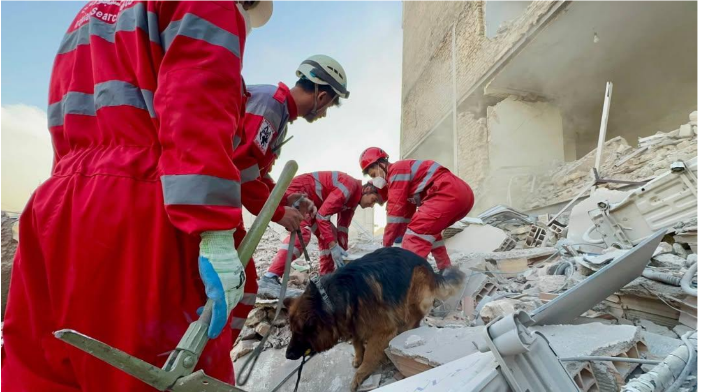
IRCS search and rescue teams in action