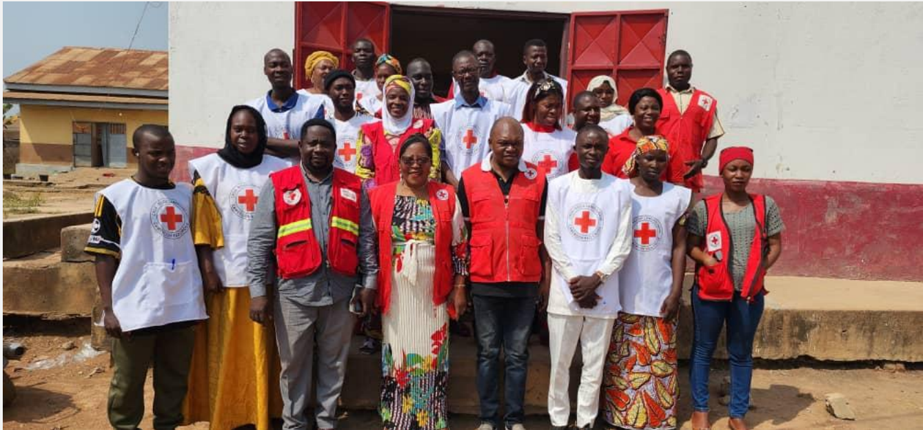
Training session in Batouri East Cameroon