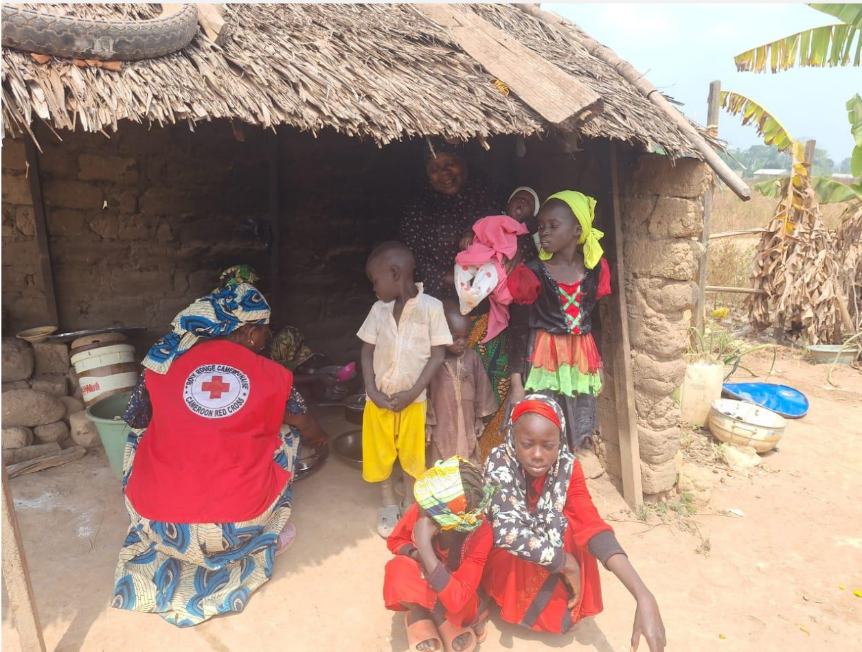
Field assessment in Far north Cameroon