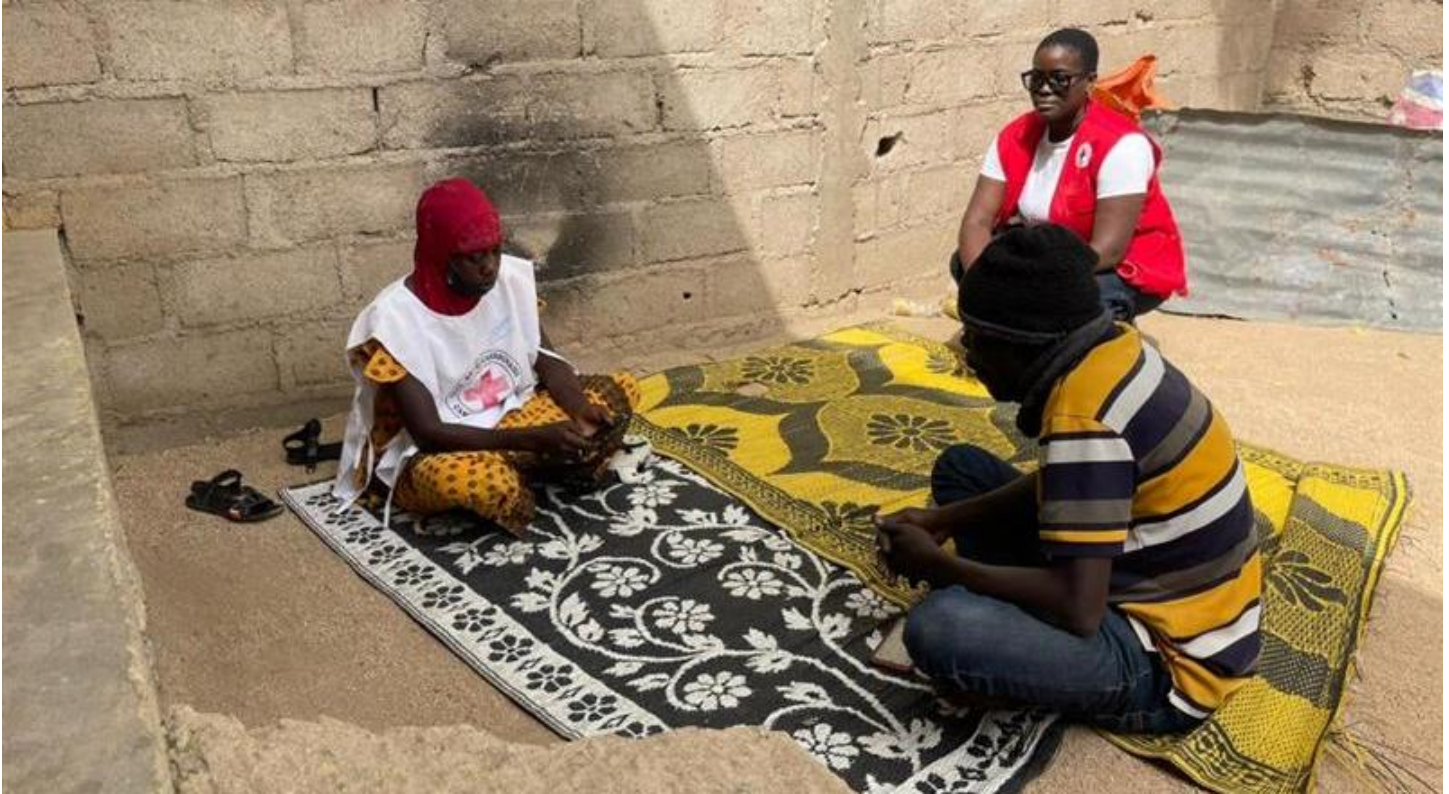
Field assessment by Cameroon Red Cross Volunteers in MayoTsanaga