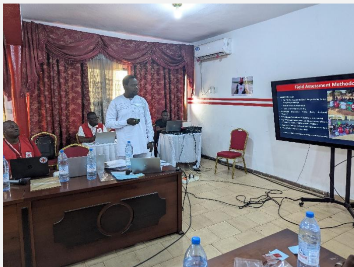
PRM deployment, a two-day workshop was organized to support the development of the Resource Mobilization (RM) Strategy of the Cameroon Red Cross