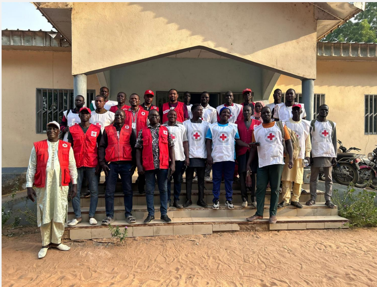
Training session in Yagoua North Cameroon

PGI standards are being mainstreamed across all sectoral interventions, with particular attention to safe and dignified access for displaced households, female-headed households, and persons with disabilities. Protection risk analysis will be done to inform targeting criteria and cash delivery modalities. Referral pathways for GBV and child protection cases are being mapped in coordination with the Protection Cluster and relevant working groups. Remaining gaps in communication material adaptation, and additional PGI assessment will be addressed in the next implementation period.