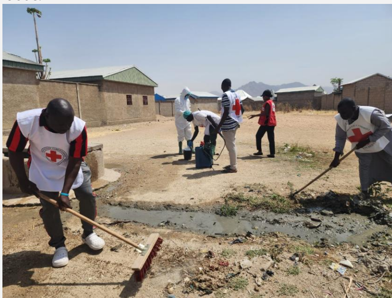
After disinfecting water wells in Mayo Oulo, CRC volunteers ensure the surroundings are also clean.

Cholera risk mapping has been completed in Doumo and Mayo Oulo health areas, with priority zones identified in coordination with district health authorities. Community water points have been mapped, risk-classified, and high-risk sources disinfected in line with WASH standards. Standard Operating Procedures have been finalised in alignment with national infection prevention and control guidelines to ensure safe and consistent disinfection practices. Chlorine and PPE have been procured, with household disinfection of suspected and confirmed cholera cases ongoing in affected communities. Three Oral Rehydration Points have been identified and validated through participatory community meetings involving local leaders, women's groups, youth, and health authorities.