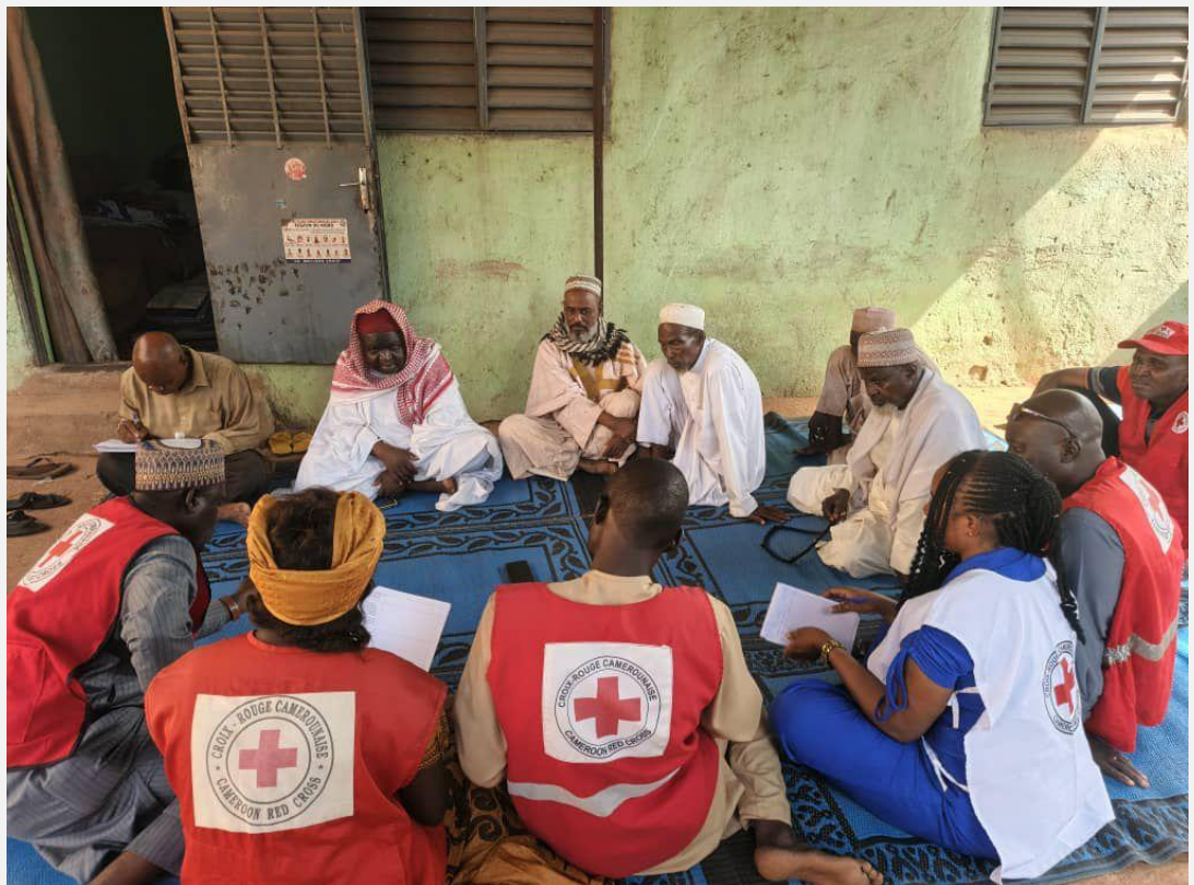
Focus group discussion in Garoua

Poster production and distribution have not yet commenced, pending finalisation of communication materials adapted for local languages and inclusiveness requirements. Feedback and complaints mechanisms are in the process of being established. No formal feedback has been received or acted upon to date, and no operational decisions based on community feedback have been recorded in this period. Establishing functional, accessible, and confidential feedback channels across all targeted localities remains a priority for the next implementation period, alongside the scale-up of information-sharing activities on targeting criteria, assistance modalities, and timelines.