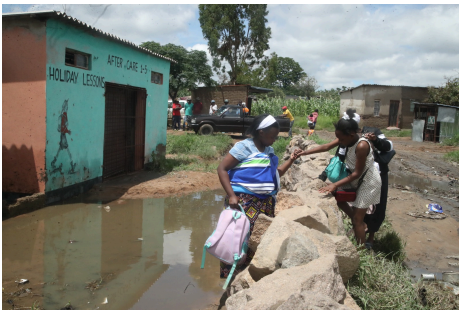
Some of the effects of flash flooding in Harare