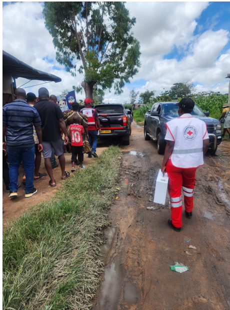
Assessment in Epworth, Harare