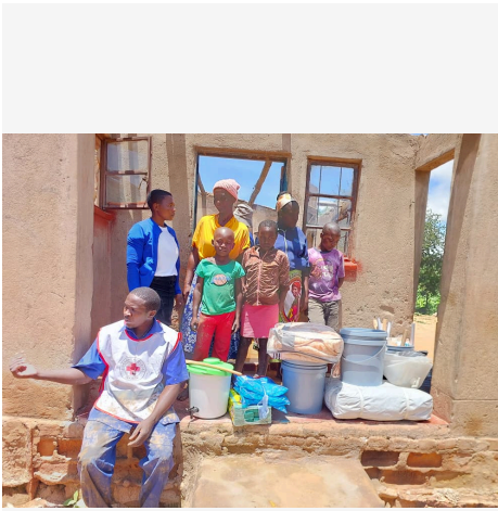
Affected Household Receiving response materials in Mutare