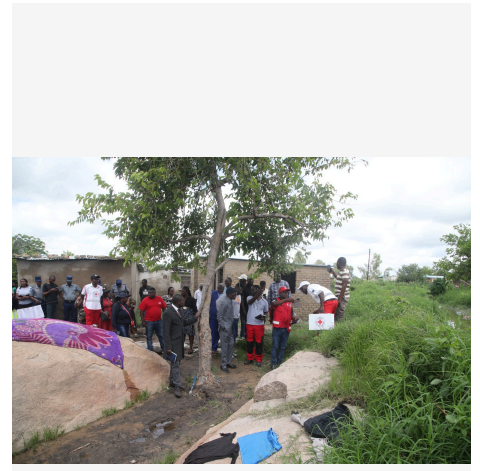
Joint Assessment in Epworth Harare