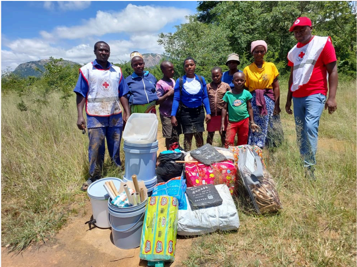
ZCRS Volunteers distributing NFIs to affected HHs in Mutare