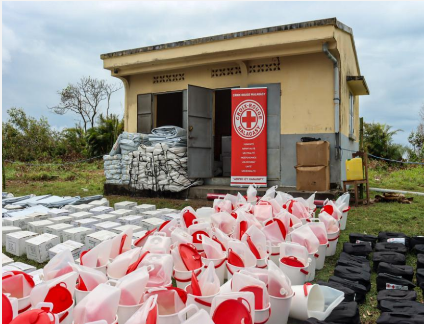
Visual of kits distributed in Toamasina 2.