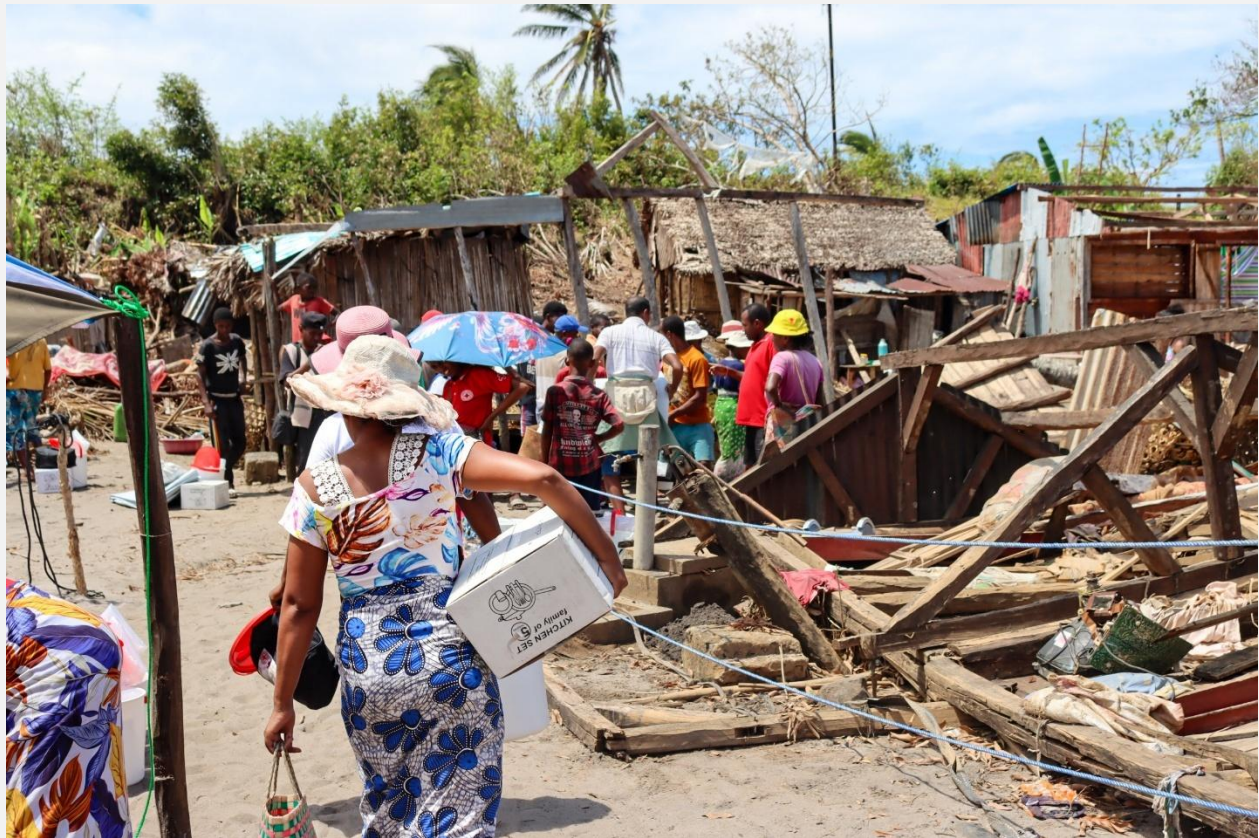
Relief kits distributions in affected Fokontany of Toamasina 2.