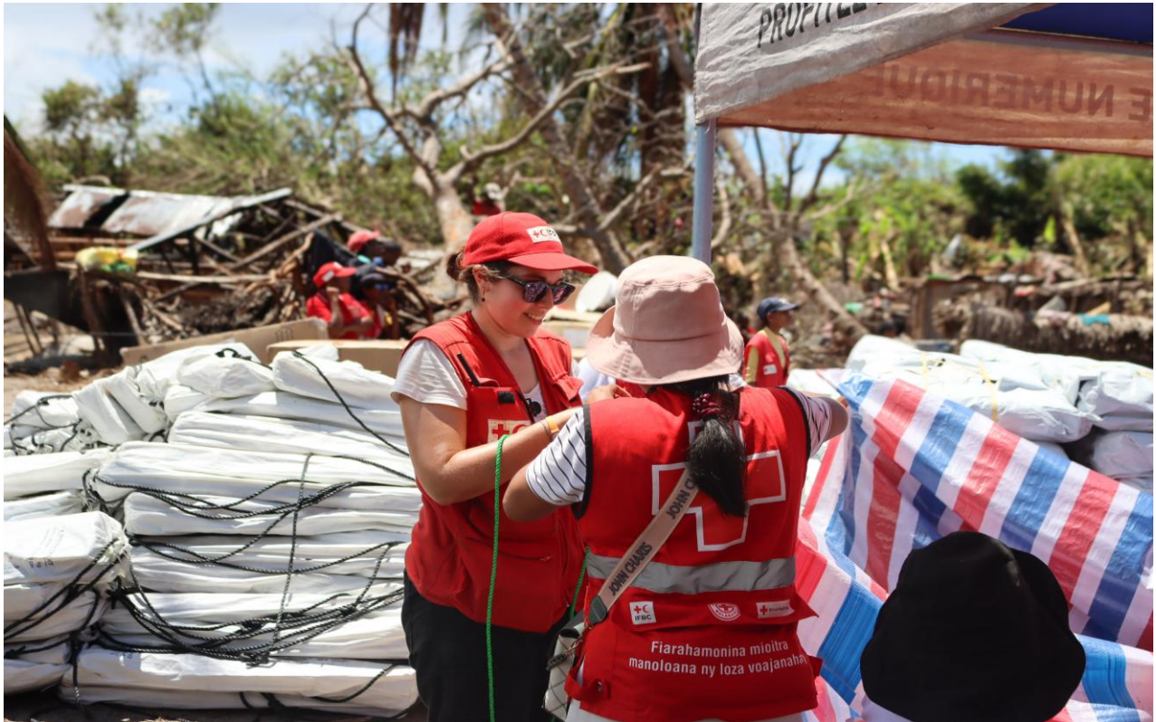
Setting up the distribution site, Ambotsini village, Toamasina 2.