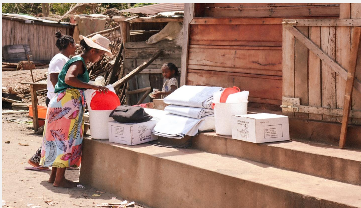
Relief kits distributions in affected Fokontany of Toamasina 2.

Further refinement of the housing damage will be conducted through a combination of sampled ground truth evaluations, satellite and aerial damage assessments, and the use of Unmanned Aerial Vehicles (UAVs). This integrated approach will provide a more accurate picture of the extent of destruction, enabling targeted shelter interventions that align with the broader early recovery agenda endorsed by HCT of 25/02/2026.