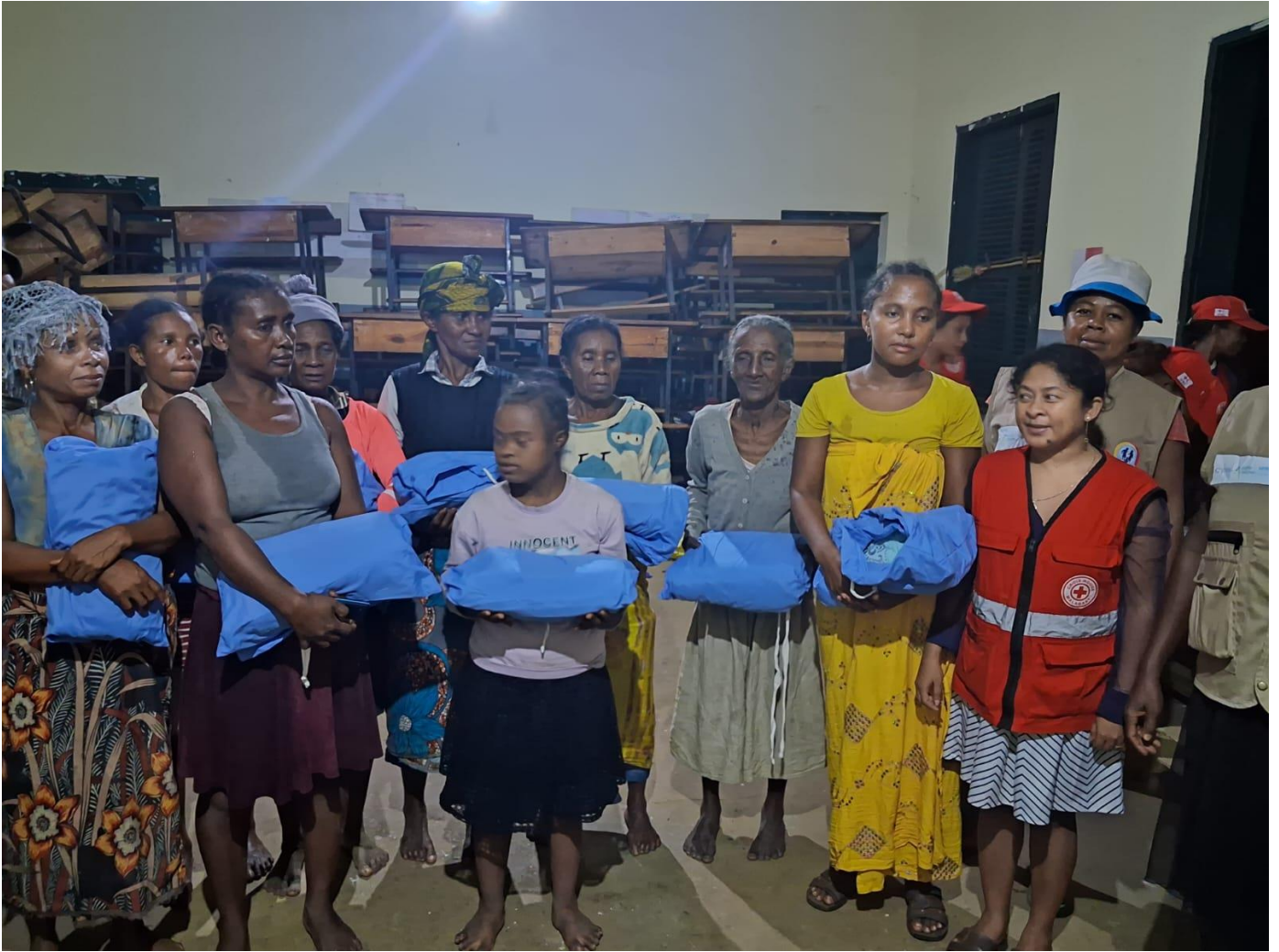
Distribution of dignity kits to displaced women: Photo Malagasy Red Cross