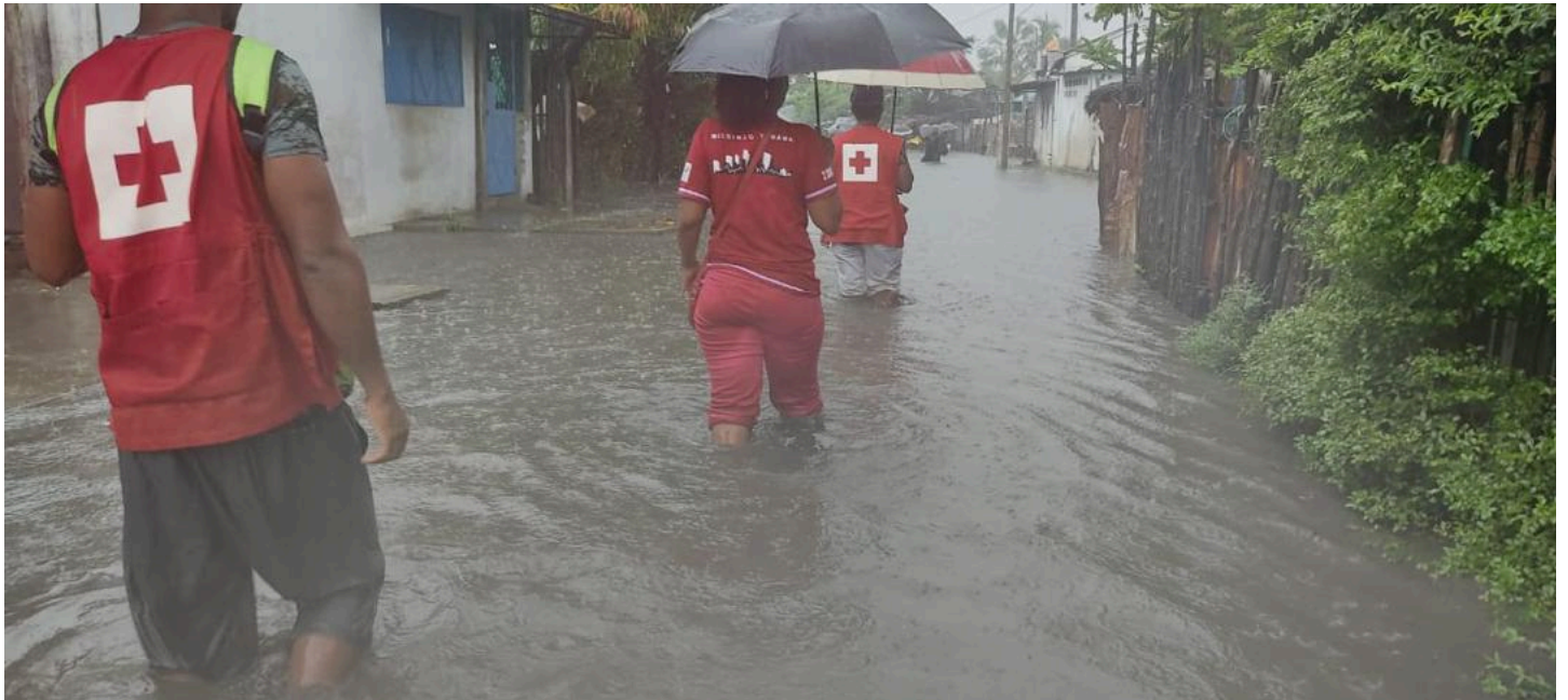
Volunteers supporting affected households