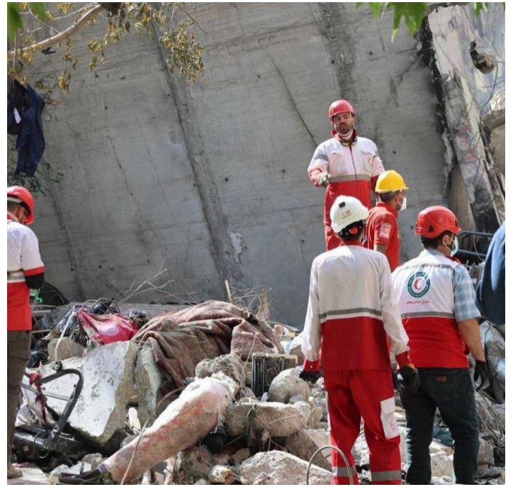
IRCS volunteer in Search and Rescue response.