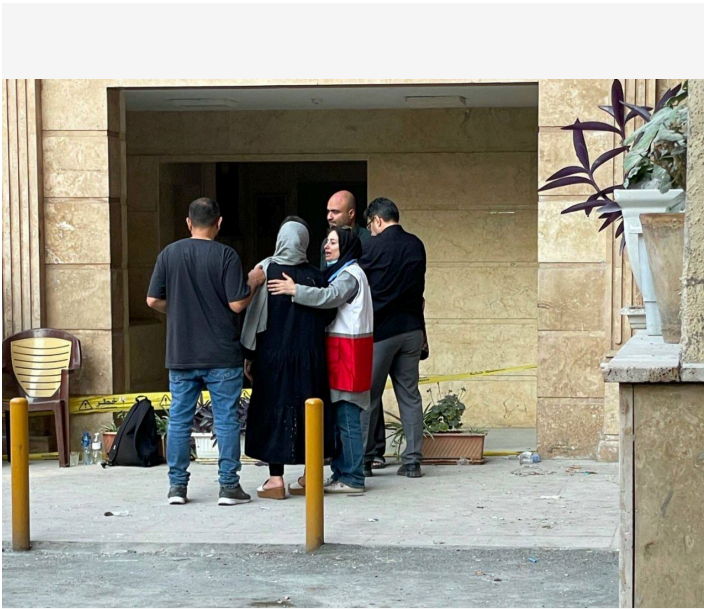
IRCS volunteer providing support to affected people.