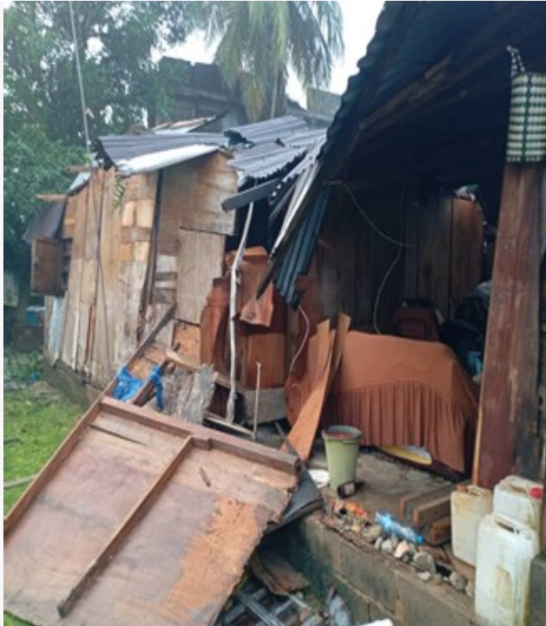
Impacts of strong winds in Libreville