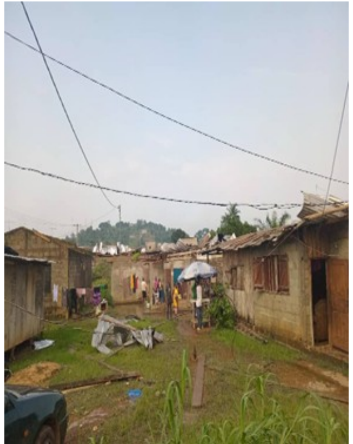
A view of the affected neighborhood