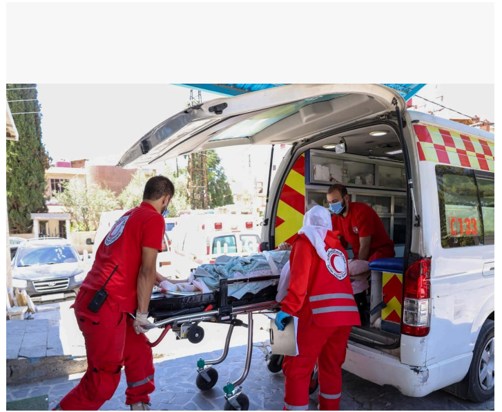
SARC EMS volunteers transporting affected individual.