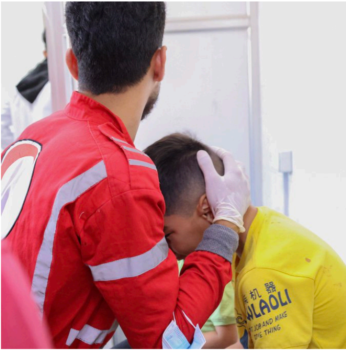
SARC Volunteer providing support to affected individual.