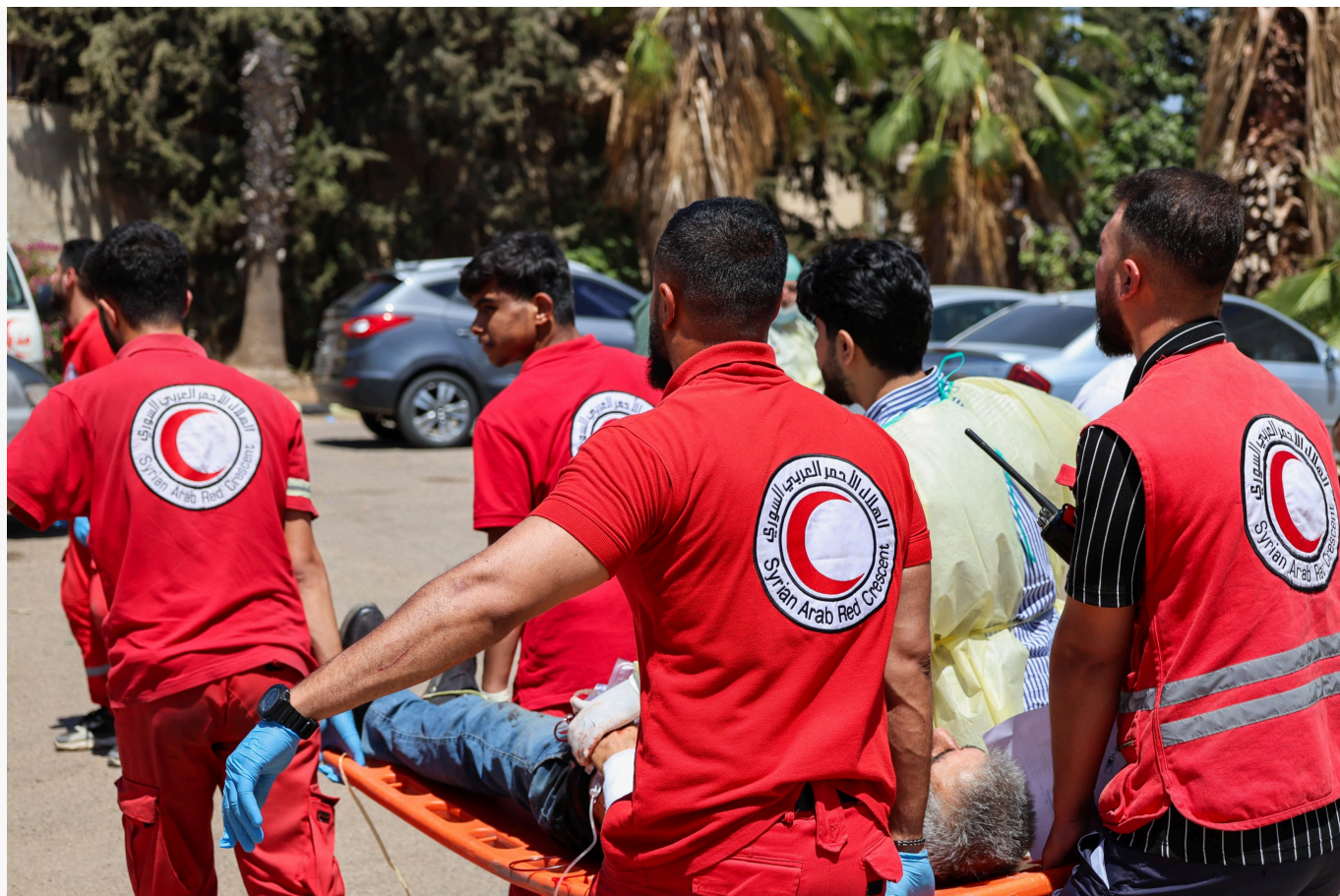
SARC Volunteers providing medical aid to affected people.