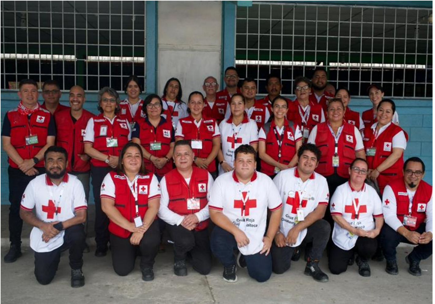
Participants in the Floods EAP activation simulation in prioritized communities of Puerto Barrios municipality, Izabal.