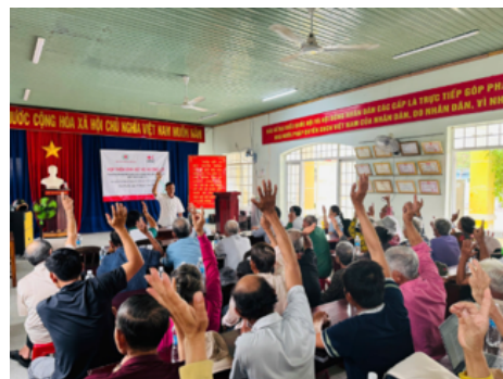
PGI messages were integrated into the village meeting sessions