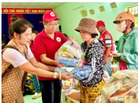
Distribution of relief items in Khanh Hoa province