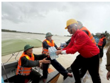
Transportation Relief items in Nov 2025-Dak Lak province

By early 2026, from the government report the flood-affected provinces of Đắk Lắk, Gia Lai, Khánh Hòa and Lâm Đồng have largely transitioned from emergency response to recovery and reconstruction phases. Government-led recovery efforts focused on housing repair and reconstruction, rehabilitation of damaged transport infrastructure, restoration of agricultural production, and livelihood recovery support for affected households.