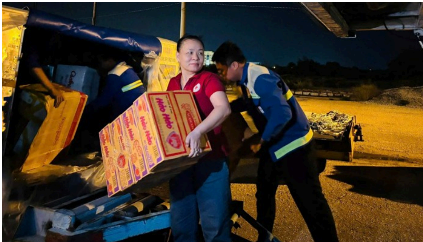
VNRC transported relief items to the flooding area-Nov 2025