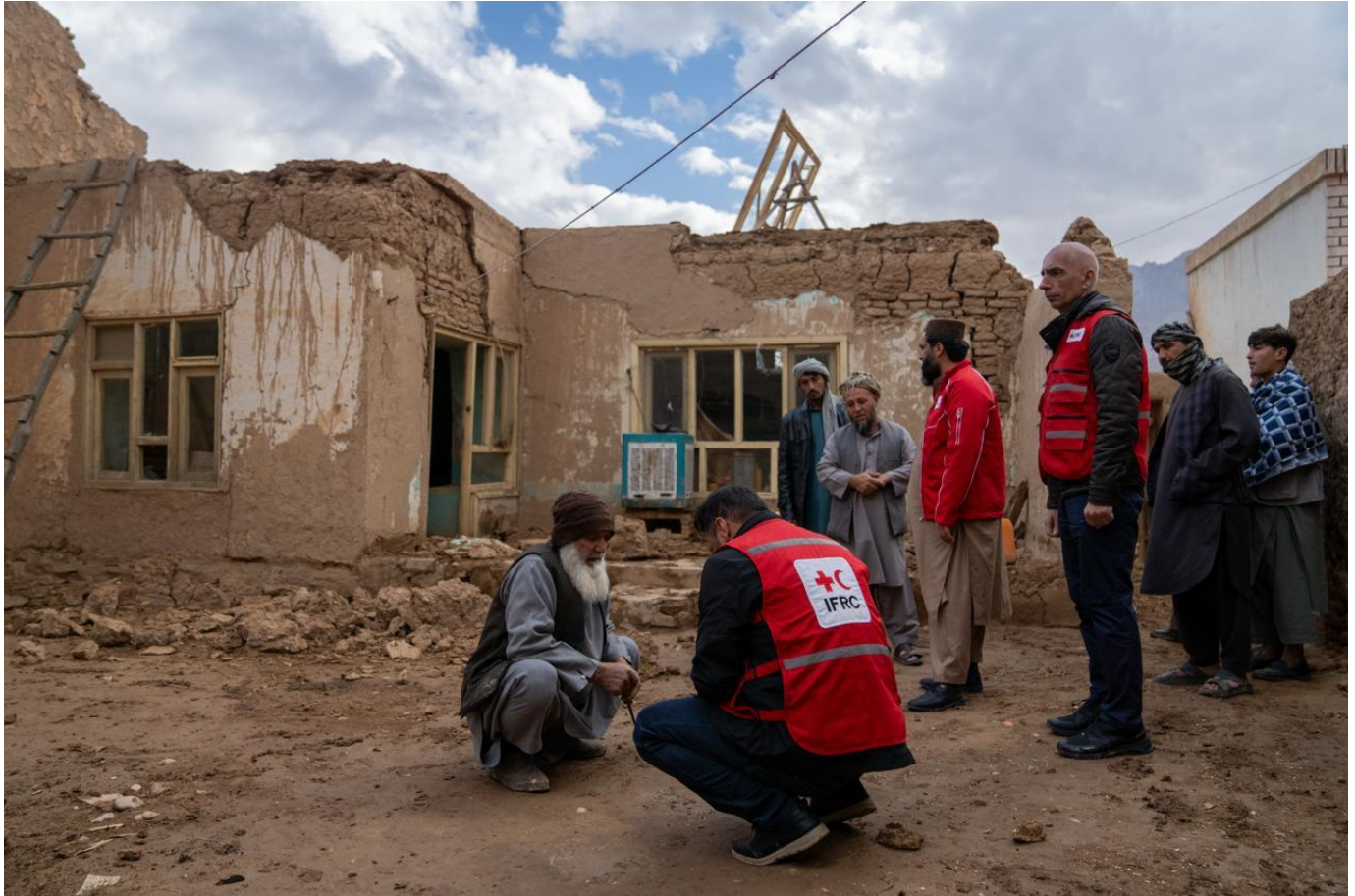
ARCS volunteers and IFRC carrying out assessments in Northern Afghanistan