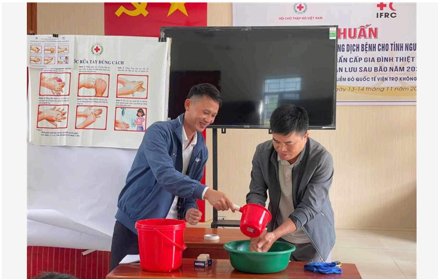
Demonstration Hygiene promotion session in Dec 2025.