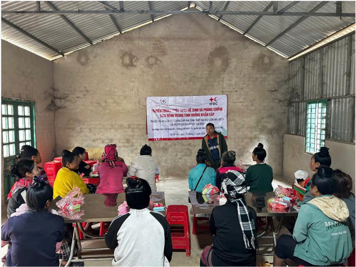
Beneficiary selection in Dien Bien Province, Dec 2025.