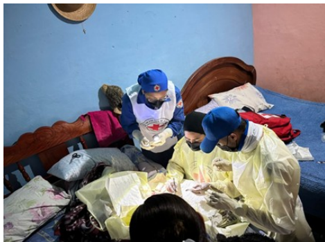
VRC volunteer doctors providing medical assistance in Mérida. July 2025