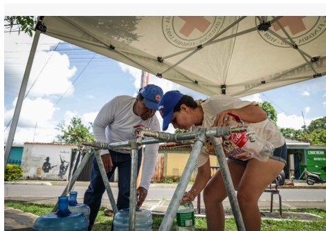
Water distribution point at the Barinitas. August 2025.

Venezuela has faced increasingly severe rainy seasons over the past five years, revealing the country's limited preparedness and the vulnerability of many communities to extreme weather events. This crisis underscores the urgent need for sustained efforts to build resilience and safeguard the most at-risk populations.