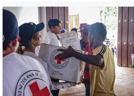
Assistance to communities in Barinitas. August 2025