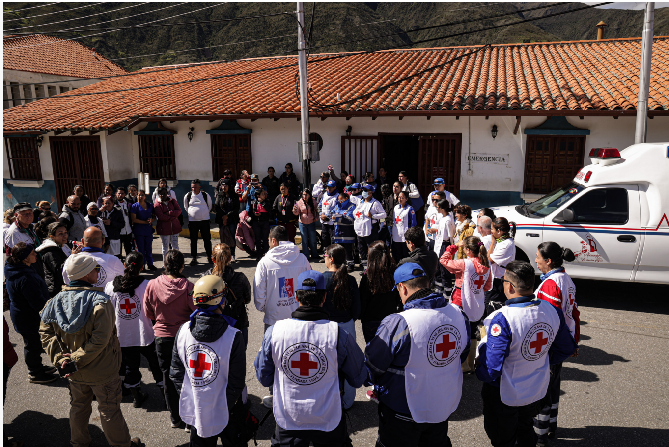
Response coordination space. July 2025. Merida State