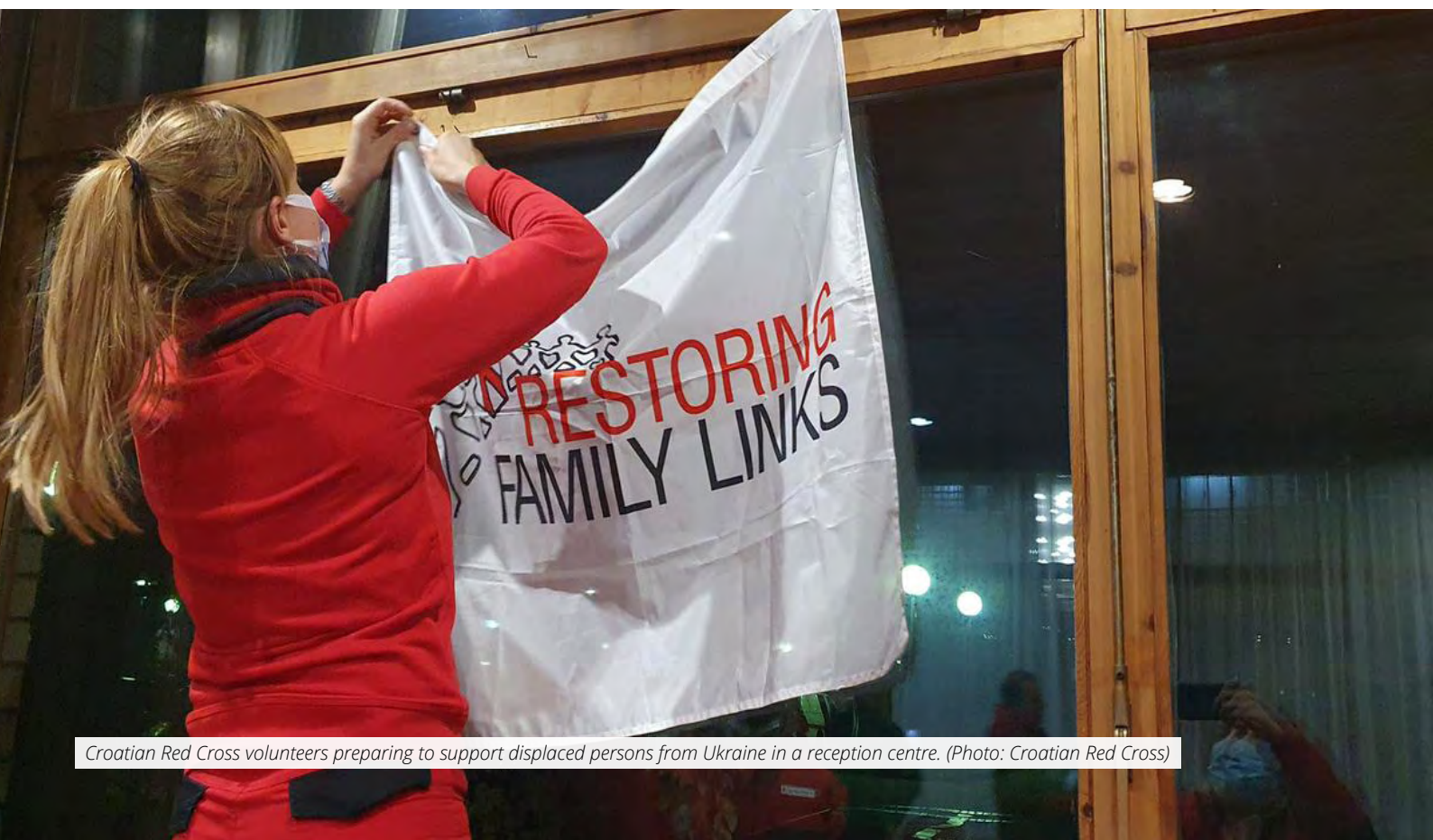
Croatian Red Cross volunteers preparing to support displaced persons from Ukraine in a reception centre.

The IFRC will give access to guidance, training and resources to build the capacity of in humanitarian diplomacy , including effective communication, negotiation and coordination with relevant stakeholders. Through ongoing collaboration, Movement partners help the Croatian Red Cross to effectively represent the needs and concerns of vulnerable populations, foster partnerships with government entities and international organizations, and contribute to shaping humanitarian policies and practices at the national and international levels.