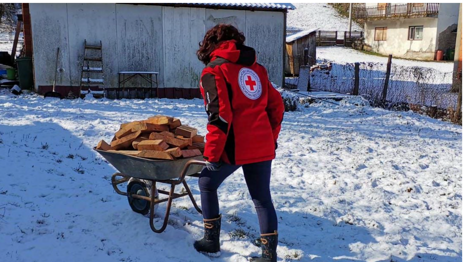
Croatian Red Cross teams providing assistance during winter period in remote areas.

Furthermore, the IFRC will support the National Society in strengthening health emergency preparedness and response. It will work on enhancing the capacity of local health teams, promoting early warning systems for disease outbreaks ensuring an effective and timely response during health crises. The IFRC will also focus on promoting disease prevention and control by supporting vaccination campaigns, encouraging hygiene practices and strengthening disease surveillance systems to safeguard public health. All these activities aim to enhance the population's health literacy.