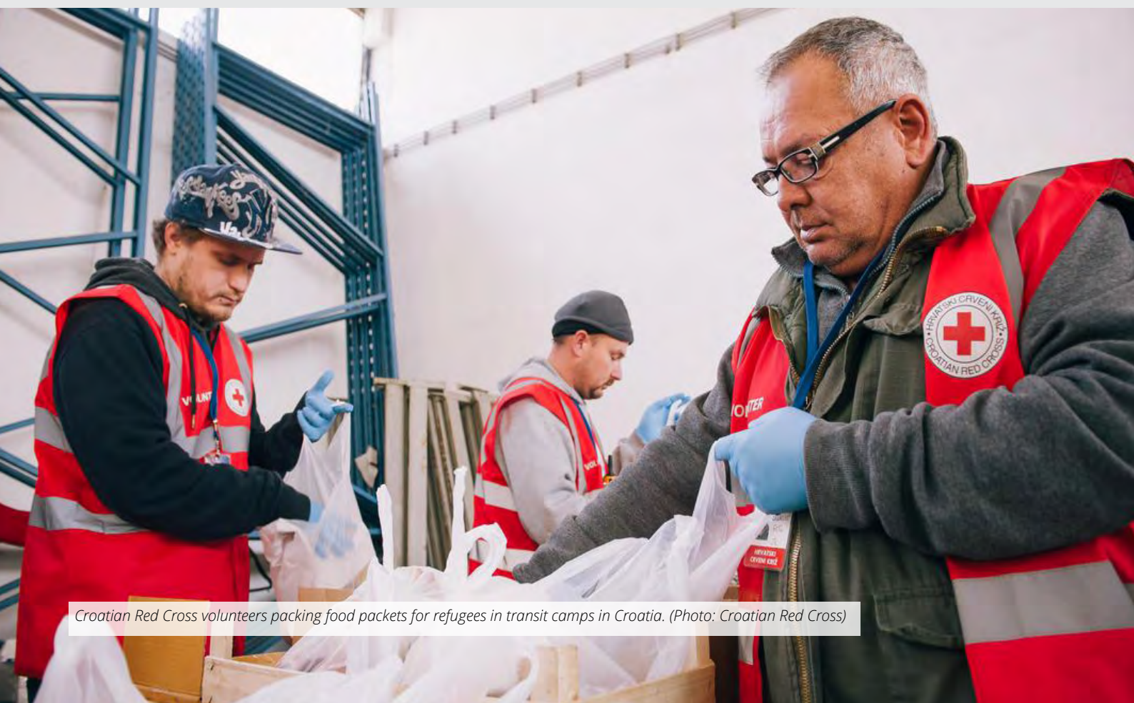
Croatian Red Cross volunteers packing food packets for refugees in transit camps in Croatia.

World Bank Population below poverty line 20.3%