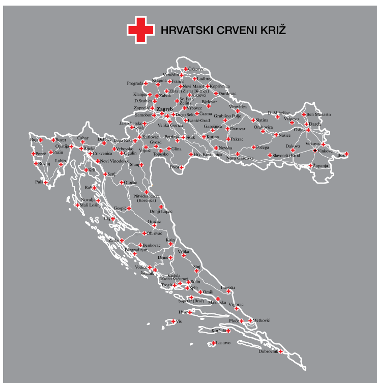
Map of the branches of the Croatian Red Cross

In 2024 , the Croatian Red Cross reached more than 600,000 people by long term services and development programmes, and 18,000 people through its disaster response and early recovery programmes.