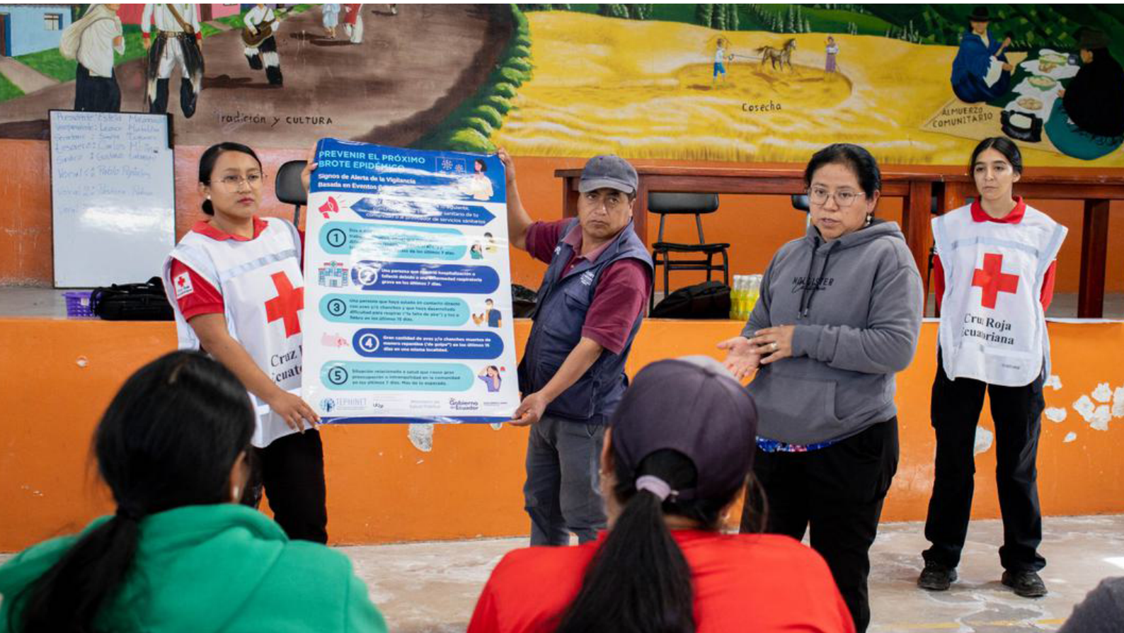
Volunteers of the Ecuadorian Red Cross train community health brigades on epidemiological alerts in partnership with the local health centre, enhancing emergency response as part of the Strengthening Border Zones project

IFRC mechanisms such as the Disaster Response Emergency Fund ( IFRC-DREF ) and Emergency Appeals will be drawn on as needed for the National Society to respond to disasters and crises.