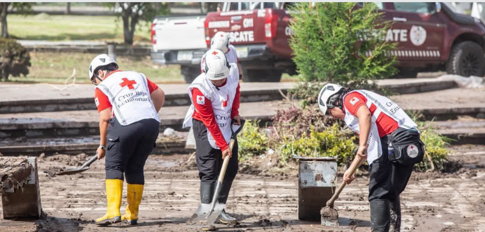
Ecuadorian Red Cross aids flood-hit communities in Imbabura amid ongoing heavy rains and widespread damage