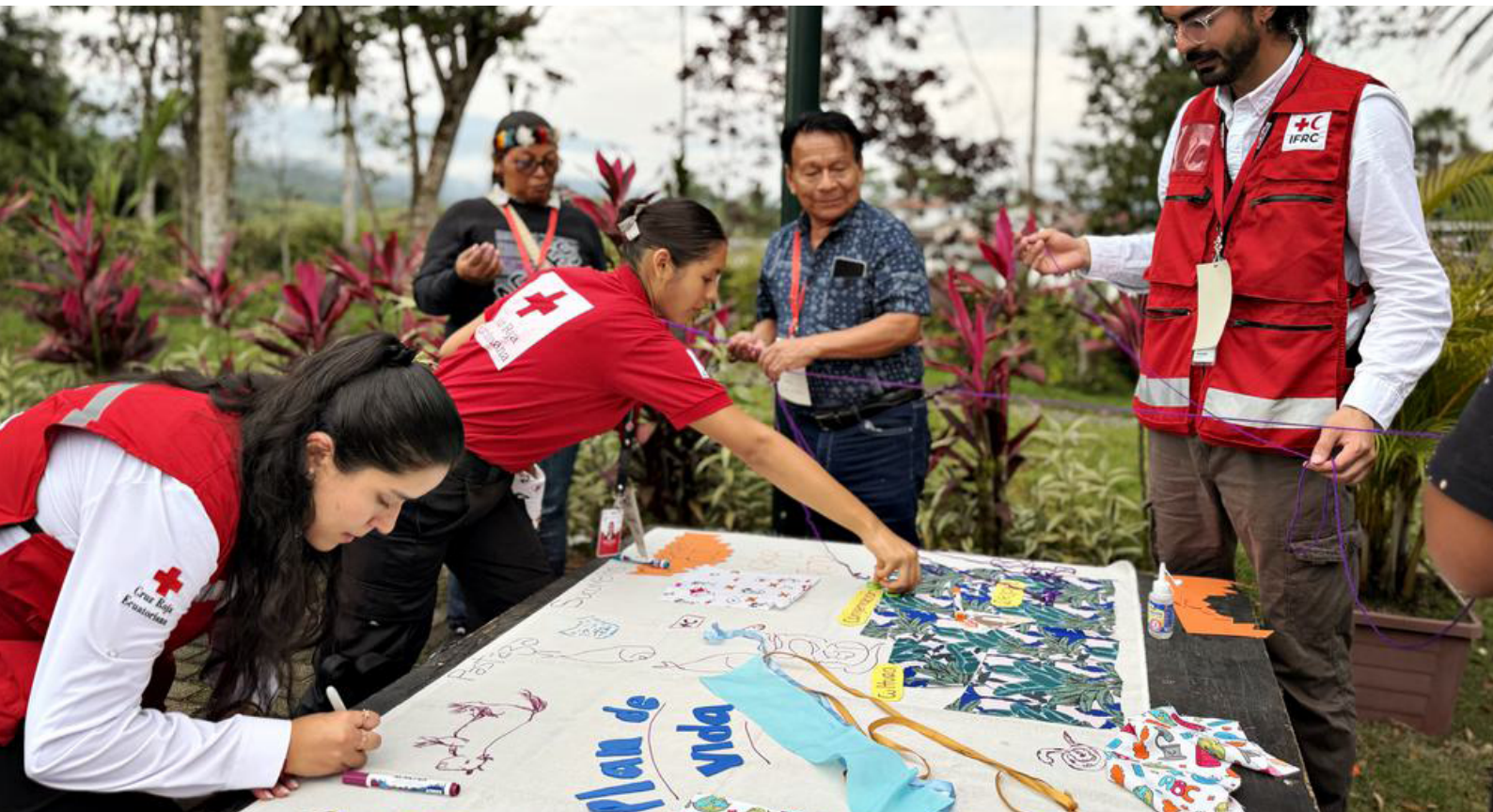
Teams from the Ecuadorian Red Cross and the IFRC unite for the 3rd Alliance for the Amazon knowledge dialogue

The IFRC will support the digital transformation of the National Society and provide technical advice for the application of the data protection policy and the use of technological tools for data collection.