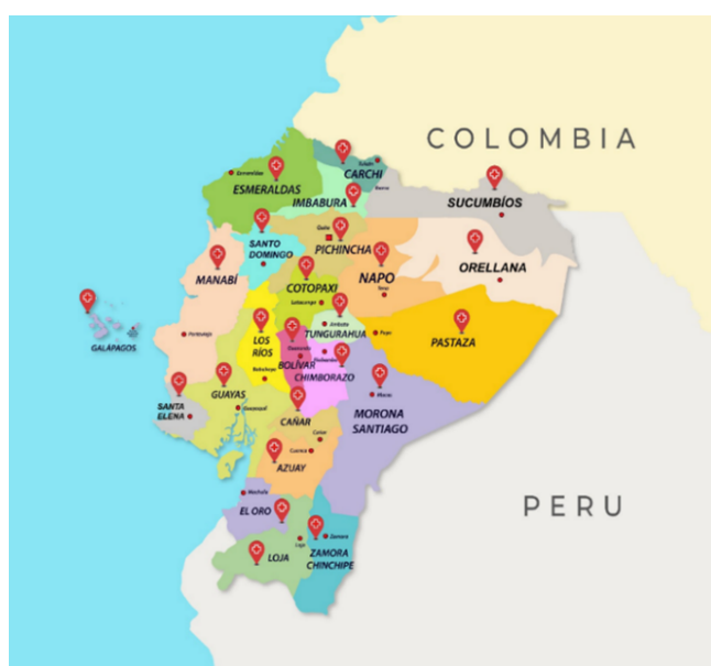
Map of Ecuadorian Red Cross branches

In 2024 , the National Society reached about 44,000 people through its disaster response and early recovery programmes.