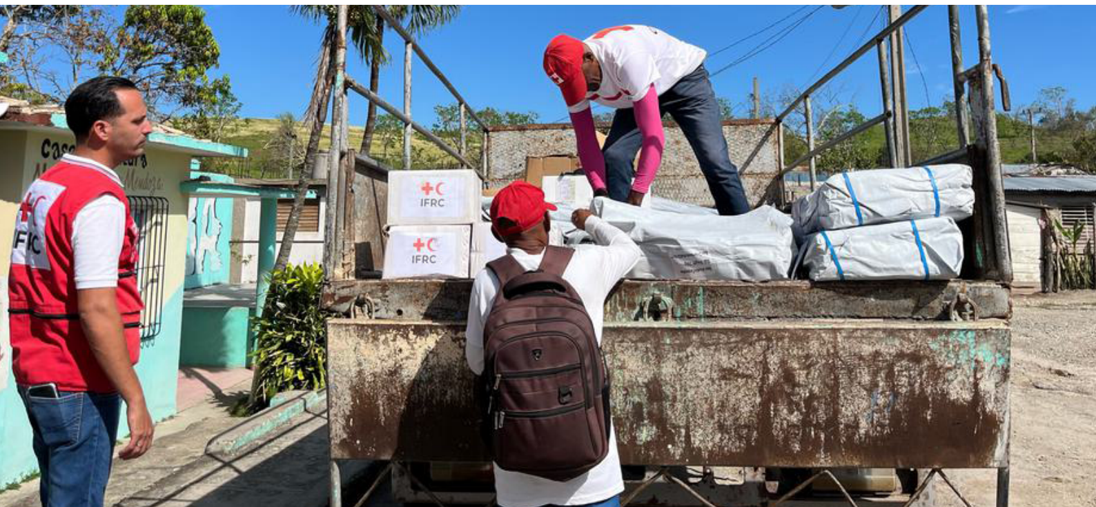
Distributions of humanitarian aid in the El Aguacate community in Santiago de Cuba, after Hurricane Melissa

All procurement processes are coordinated through the IFRC regional logistics unit in Panama to ensure material availability and expedite the procurement process. Managing procurements from the regional logistics unit is more expeditious as there is limited availability of materials and supplies in Cuba.