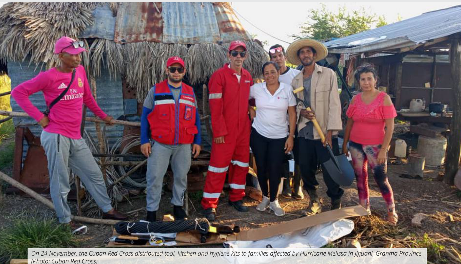
On 24 November, the Cuban Red Cross distributed tool, kitchen and hygiene kits to families affected by Hurricane Melissa in Jiguani, Granma Province