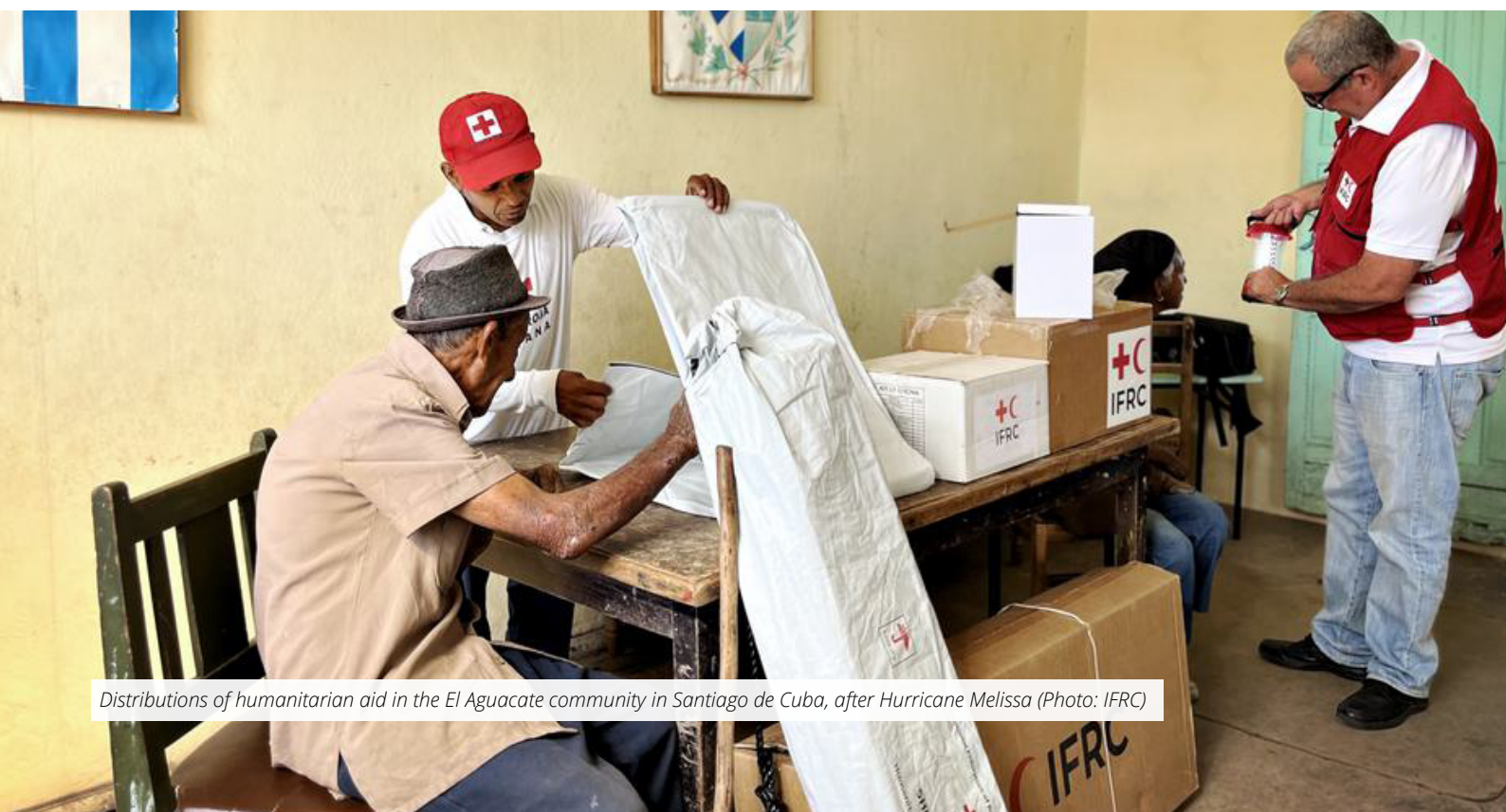
Distributions of humanitarian aid in the El Aguacate community in Santiago de Cuba, after Hurricane Melissa

The IFRC will assist the Cuban Red Cross in assuming its role in coordination and advocacy platforms. It will aid the National Society in implementing various training for volunteers and its coordination with the Ministry of Health to undertake hygiene promotion and provide safe water during emergencies.