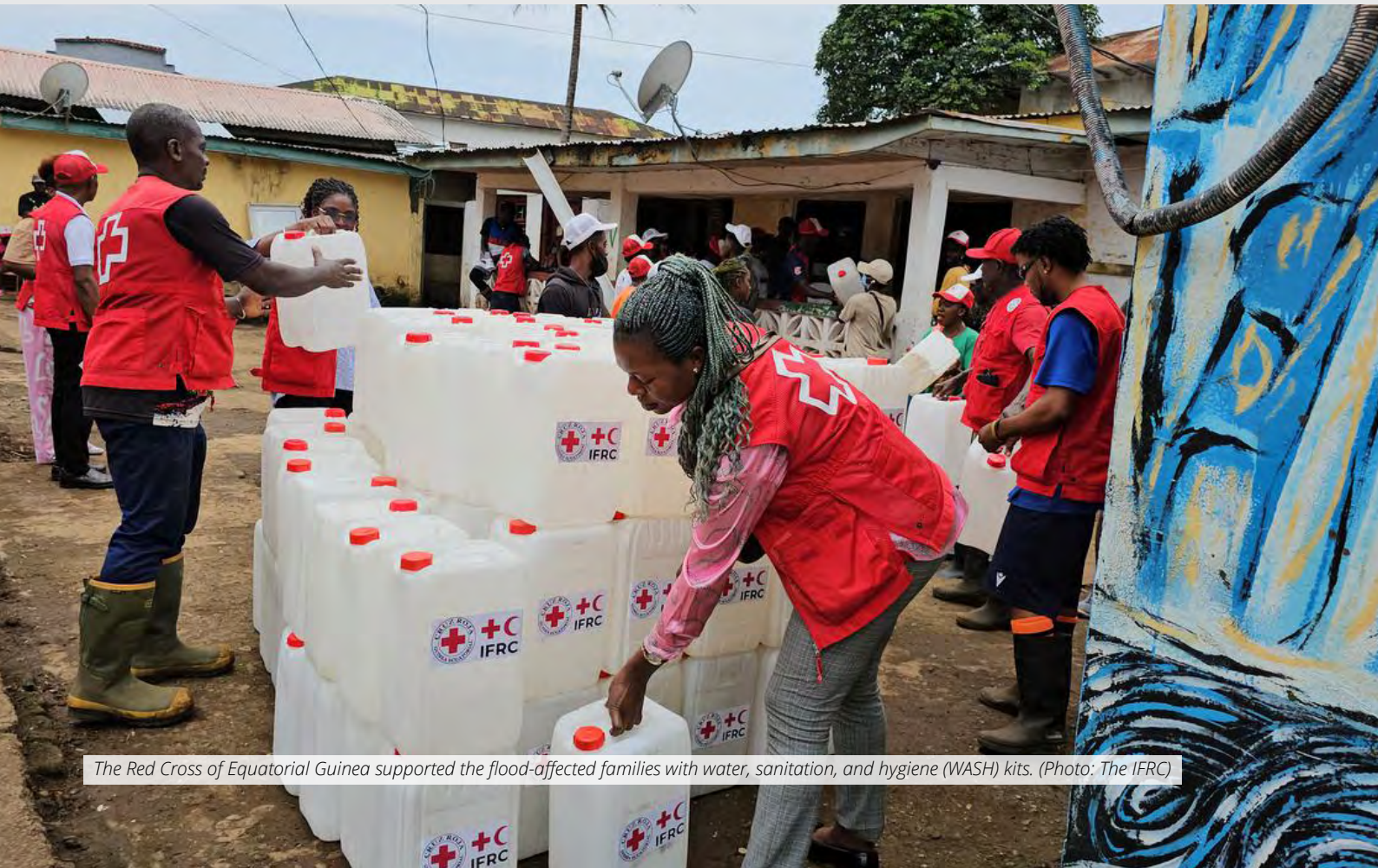
The Red Cross of Equatorial Guinea supported the flood-affected families with water, sanitation, and hygiene (WASH) kits.

World Bank Population below poverty line 51%