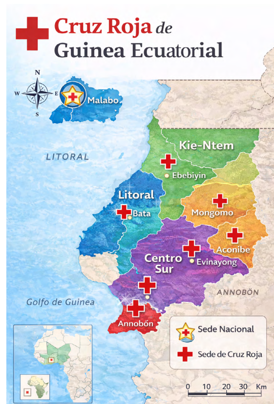
Map of the regional branches of the Red Cross of Equatorial Guinea

In 2023, the National Society received funding from the IFRC's Capacity Building Fund (CBF) to improve its financial management, risk management capacities and strengthen its existing revenue-generating projects. Unforeseen delays have resulted in an extension of the implementation of this grant until August 2025.