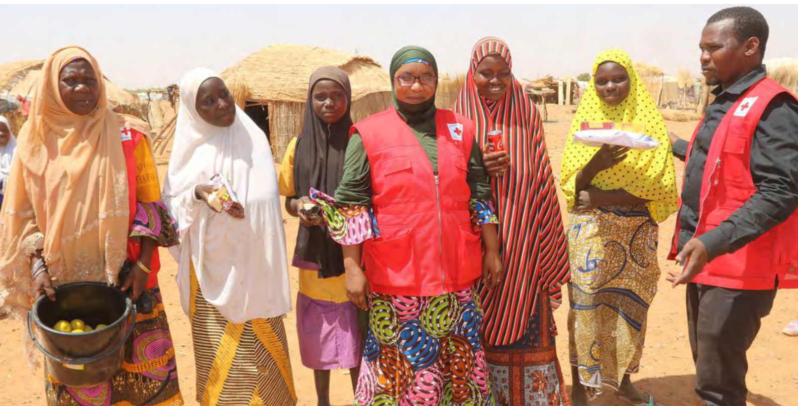
The Red Cross Society of Niger contributes to strengthening social cohesion by holding community events

In 2024 , the Red Cross Society of Niger reached 4.3 million people through its long-term services and development programmes and 87,000 people through its disaster response and early recovery programmes.