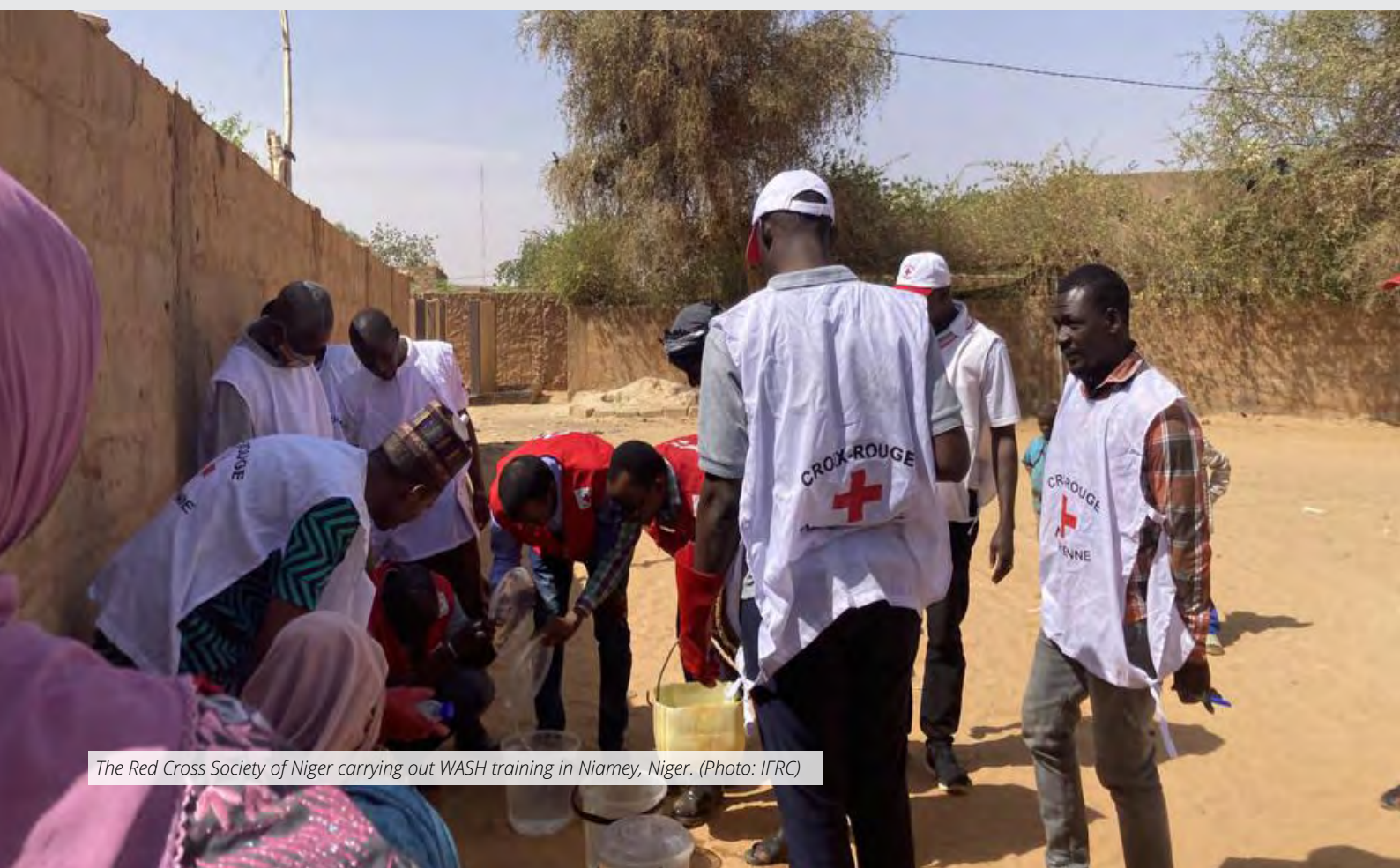
The Red Cross Society of Niger carrying out WASH training in Niamey, Niger.

World Bank Population below poverty line 41.2%