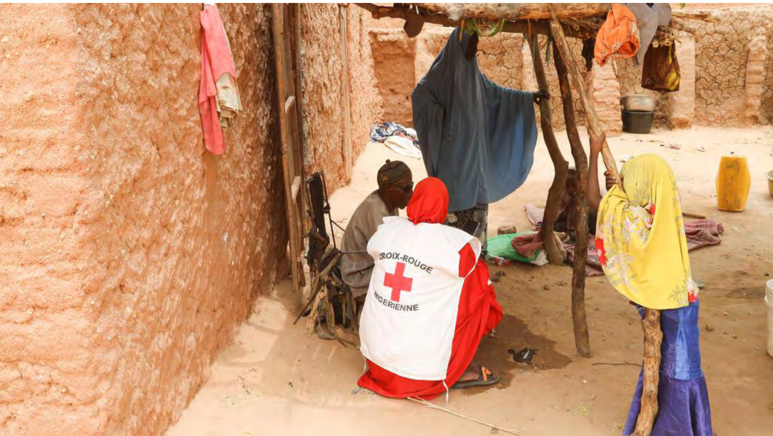
Post Distribution Monitoring survey - Maradi (Niger) - ECHO Programmatic Partnership

to vulnerable populations. Several priority needs that have been identified by the National Society includes strengthening of human resources, provision of WASH equipment and kits, institutional and community capacity building, among others.