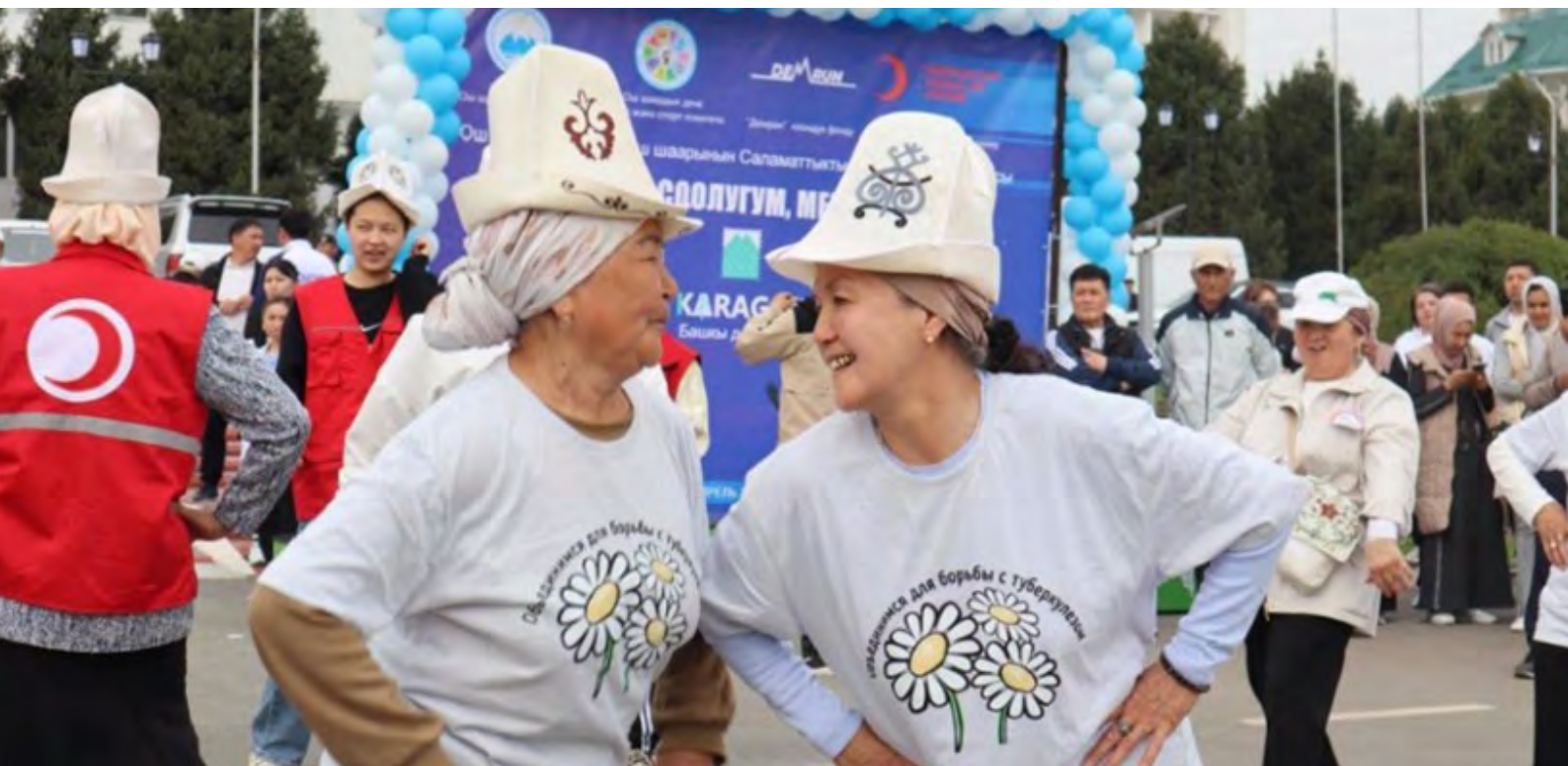
Kyrgyzstan Red Crescent volunteers lead activities to keep older people active and socially engaged across communities.

In recent years, IFRC supported the Red Crescent Society of Kyrgyzstan through a number of Disaster Response Emergency Fund (DREF) operations in relation to population movement linked to floods and mudslides, border conflicts, earthquakes, heat and cold waves, and disease outbreaks. IFRC-DREF support includes an Early Action Protocol for heatwaves with a validity of five years.