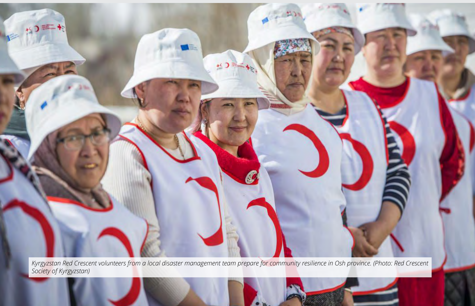
Kyrgyzstan Red Crescent volunteers from a local disaster management team prepare for community resilience in Osh province.

World Bank Population below poverty line 26%