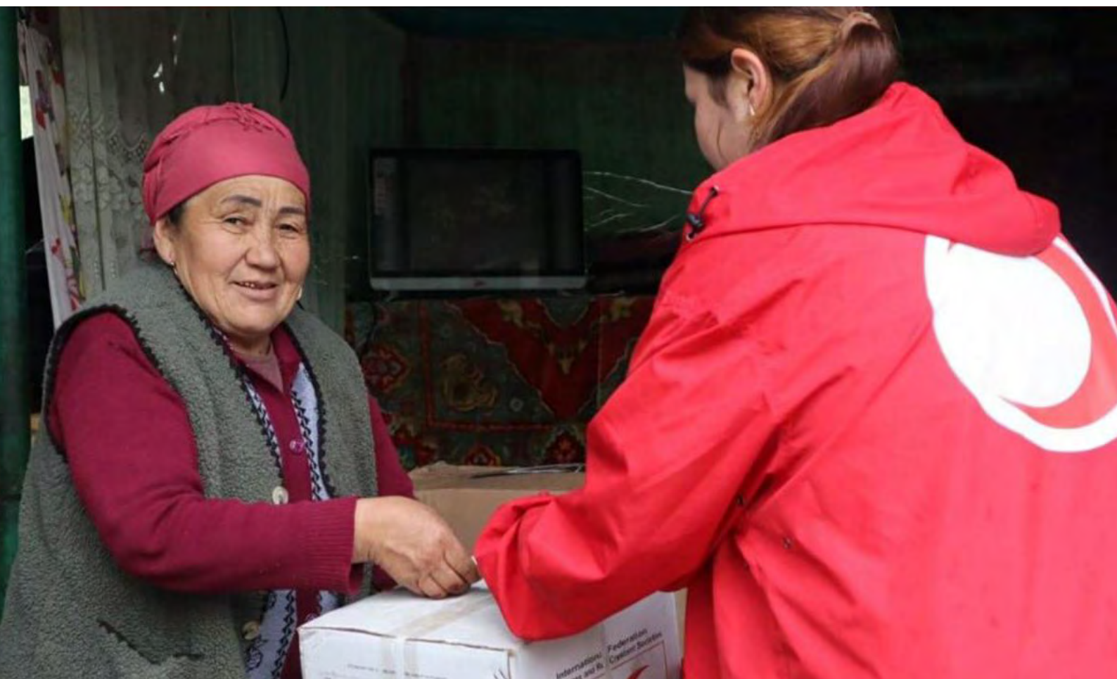
Kyrgyzstan Red Crescent volunteers deliver essential relief and assist with cleanup after severe mudflows impact households.

From July 2025 onwards, a new project has been implemented under the Directorate-General for European Civil Protection and Humanitarian Aid Operations (DG ECHO)-supported Humanitarian Implementation Plan (HIP). Through this initiative, the National Society receives IFRC support to strengthen institutional preparedness, including the development of multi-hazard contingency plans, revision of training curricula for National Disaster Response Teams, testing and validation of plans, enhancement of city-level contingency planning in disaster-prone areas, and technical assistance through the Preparedness for Effective Response (PER) process.