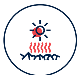
Heat waves/ cold waves