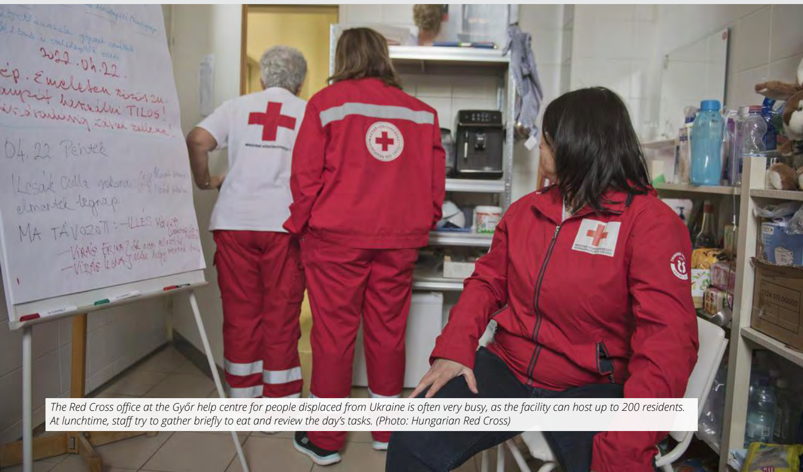
The Red Cross office at the Győr help centre for people displaced from Ukraine is often very busy, as the facility can host up to 200 residents. At lunchtime, staff try to gather briefly to eat and review the day's tasks.

World Bank Population below poverty line 87%