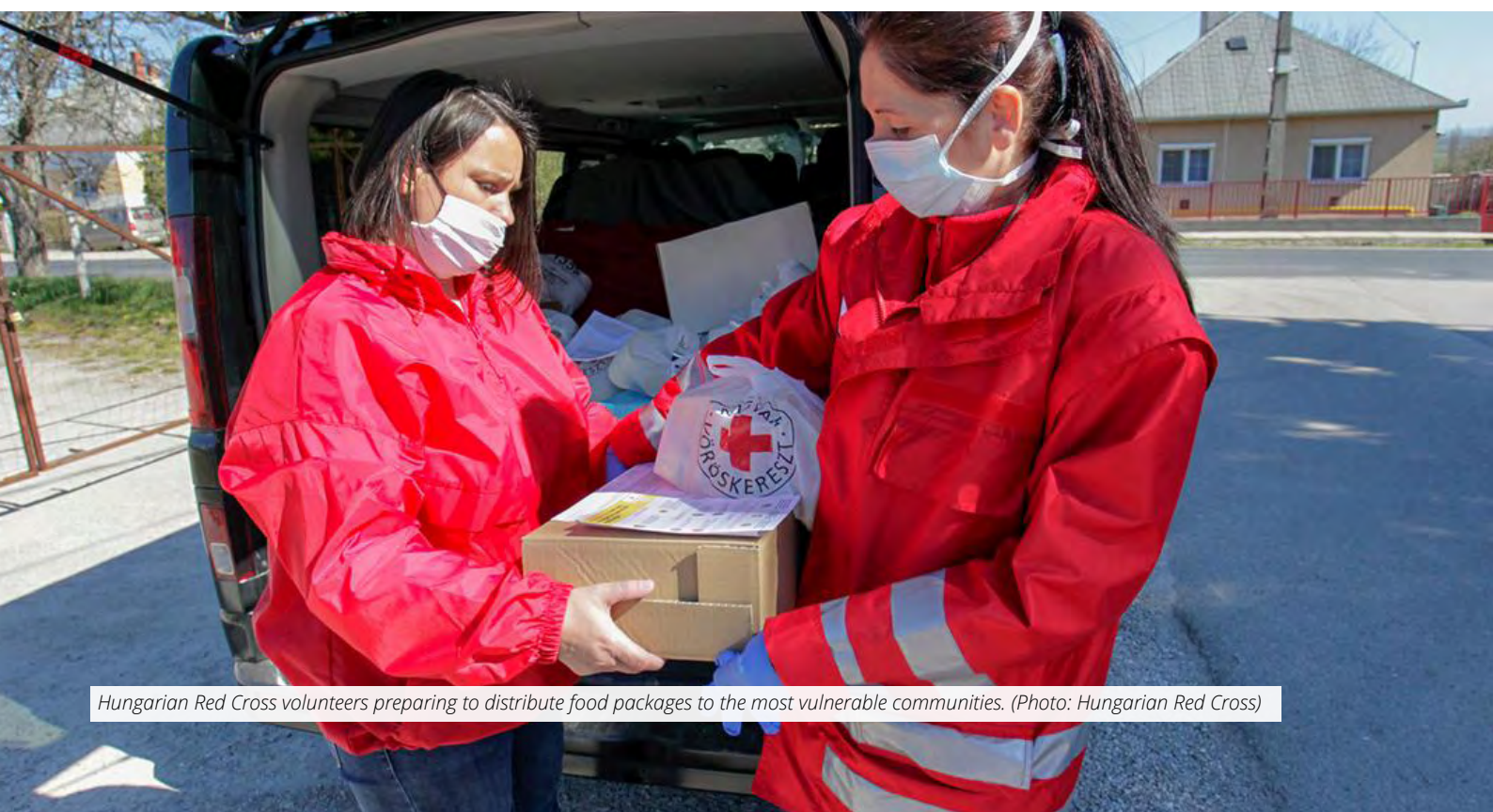
Hungarian Red Cross volunteers preparing to distribute food packages to the most vulnerable communities.

The IFRC supports the Hungarian Red Cross through emergency appeals and the Disaster Relief Emergency Fund (DREF) , responding to disasters and crises and supporting people who have fled Ukraine.