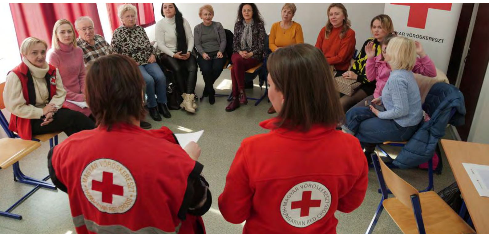
The Hungarian Red Cross provides Hungarian language courses to help displaced Ukrainians build everyday language skills and integrate into their host communities.

The IFRC supports the Hungarian Red Cross in disaster response and recovery operations by mobilizing resources, providing humanitarian assistance and coordinating relief activities. The IFRC helps build local capacity by training volunteers and promoting community initiatives aimed at improving resilience and preparedness for future disasters.