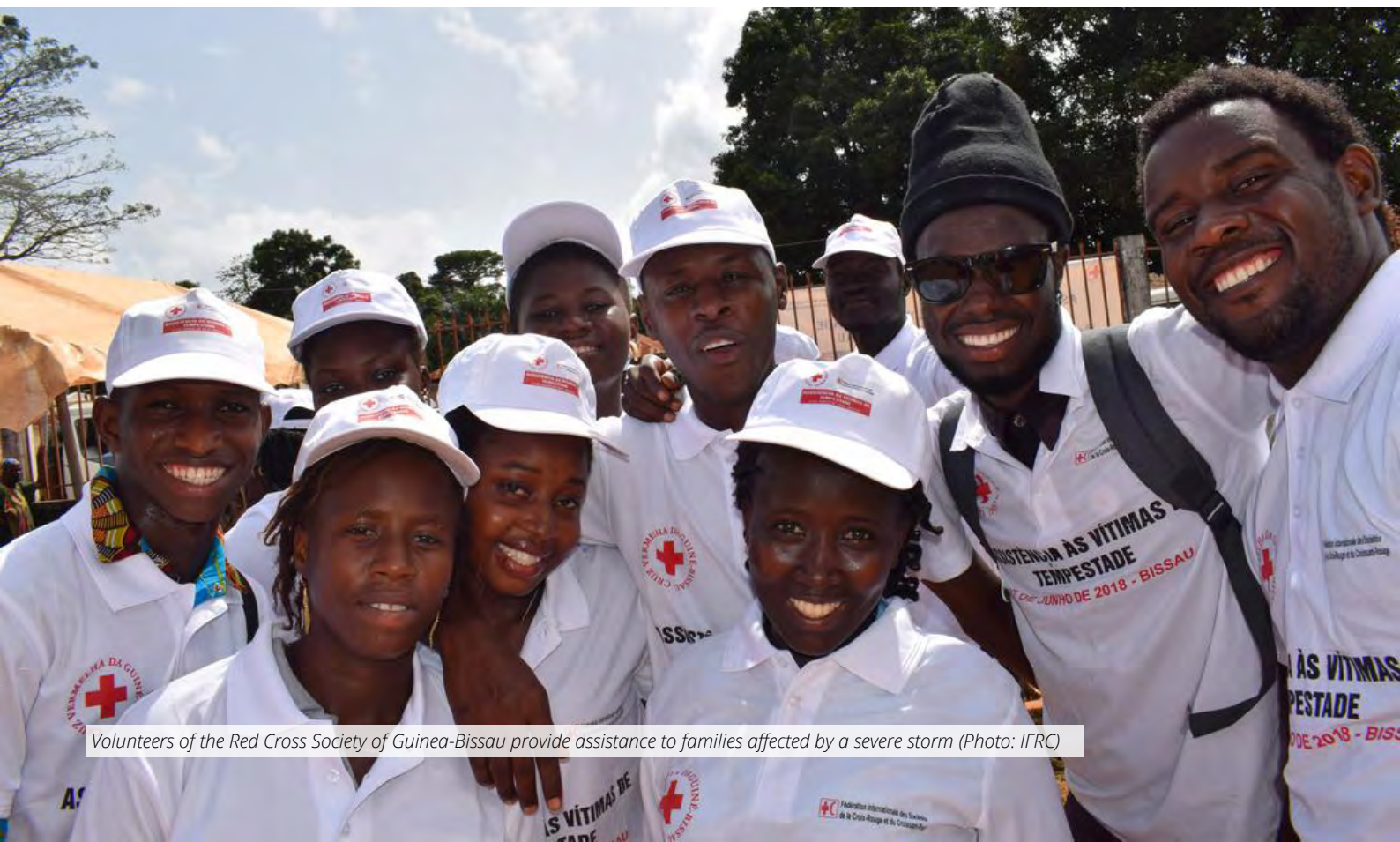
Volunteers of the Red Cross Society of Guinea-Bissau provide assistance to families affected by a severe storm

The IFRC will continue supporting the National Society to work towards achieving the goals set out in IFRC’s Pan-Africa Zero Hunger Initiative, which aims to reach zero hunger for up to 25 per cent of vulnerable people in Africa by 2030. This will be achieved through investment in small holder farmers and scaling up cash assistance and support to youth entrepreneurs. It will also provide technical assistance to the National Society to advocate with the authorities in Guinea-Bissau to develop and build capacity around disaster law .