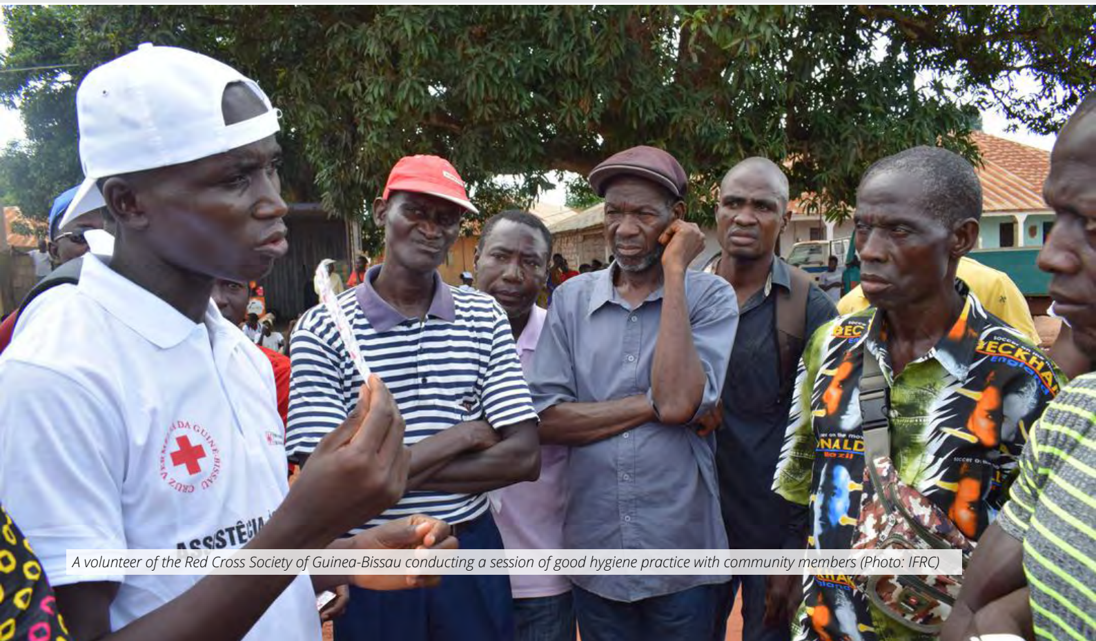
A volunteer of the Red Cross Society of Guinea-Bissau conducting a session of good hygiene practice with community members

World Bank Population below poverty line 50%