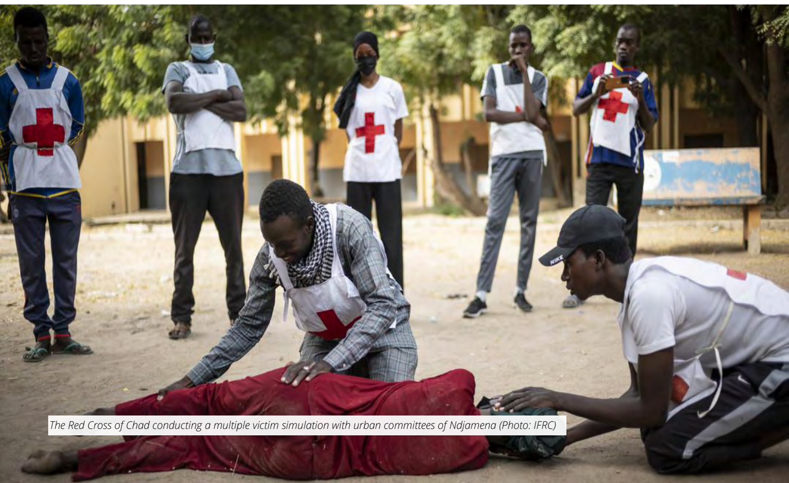
The Red Cross of Chad conducting a multiple victim simulation with urban committees of Ndjamena

The French Red Cross supports the National Society by ensuring that the population benefits from preventive and curative health services.