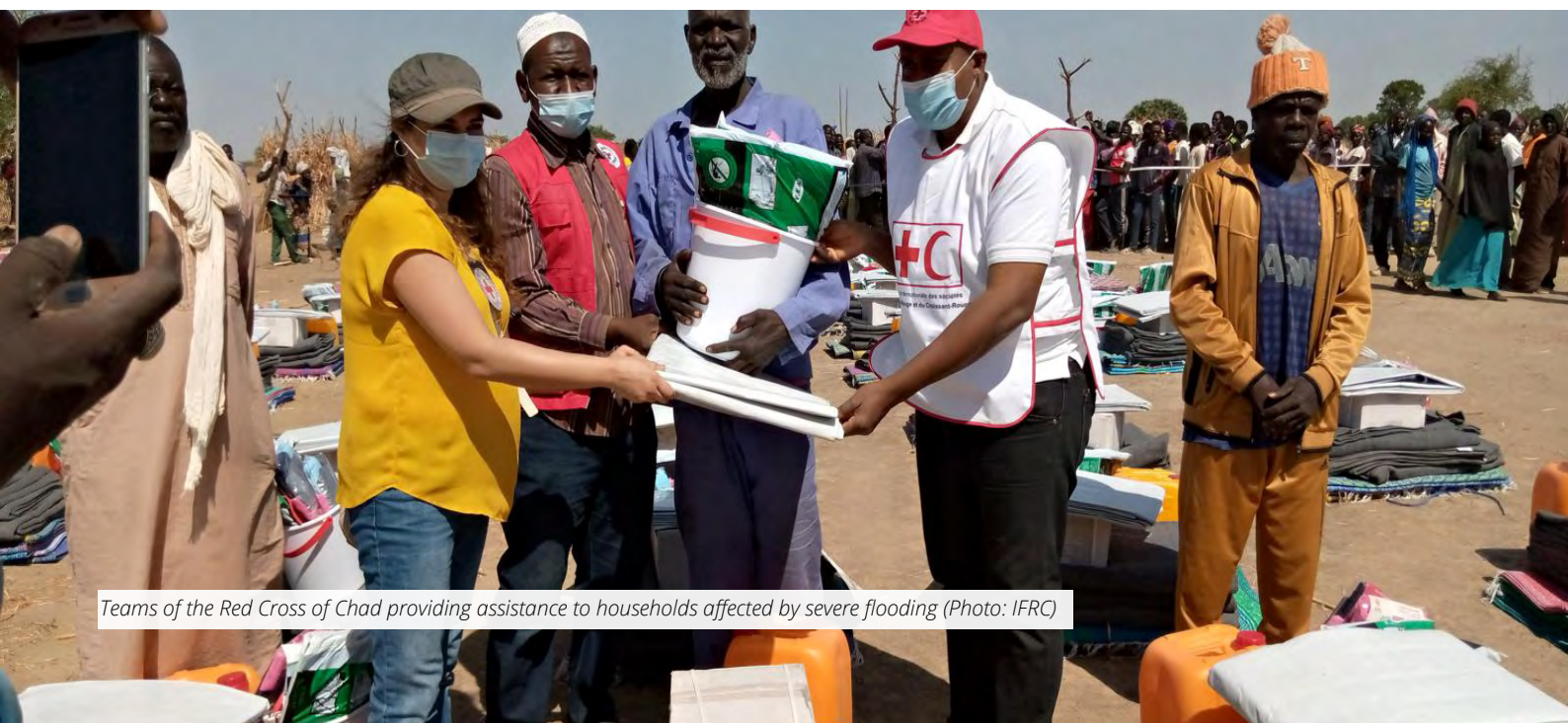
Teams of the Red Cross of Chad providing assistance to households affected by severe flooding

The Luxembourg Red Cross supports the Red Cross of Chad in the development of shelter programmes and activities related to environmental protection by integrating the cash approach as a means of implementation.