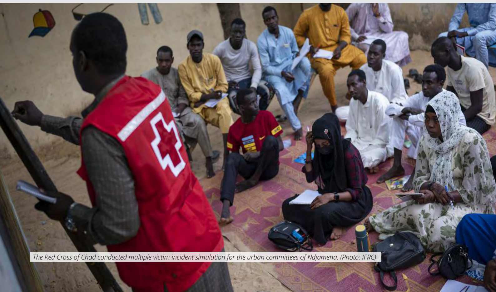
The Red Cross of Chad conducted multiple victim incident simulation for the urban committees of Ndjamena.