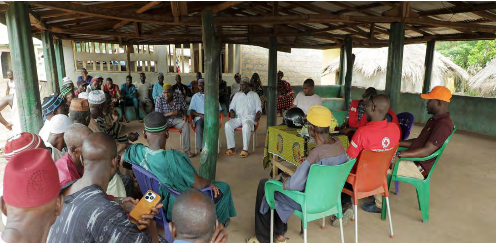
The Red Cross Society of Guinea supports communities in development action plans, identifying steps they need to take to fund, build and staff health posts.

capacity to prepare for and respond to the threats of epidemics and pandemics, promotion of collaboration with the media and other key stakeholders in health security and supporting resource mobilization and fund-raising projects and programmes in the area of community preparedness for epidemics and pandemics, among others.