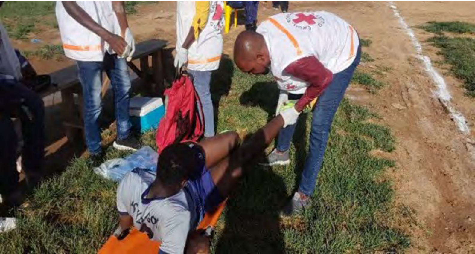
The Red Cross Society of Guinea aims to ensure that the health of community is increased through the use of health services.

the National Society's accounts, updating the administrative and financial procedure manual, and various training aimed at improving the National Society's response in the country.