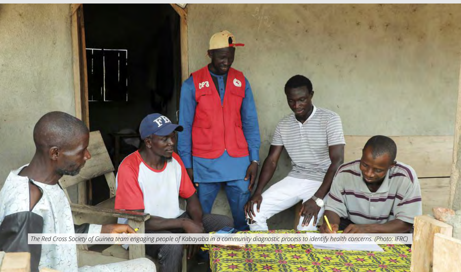
The Red Cross Society of Guinea team engaging people of Kabayaba in a community diagnostic process to identify health concerns.

World Bank Population below poverty line 44%