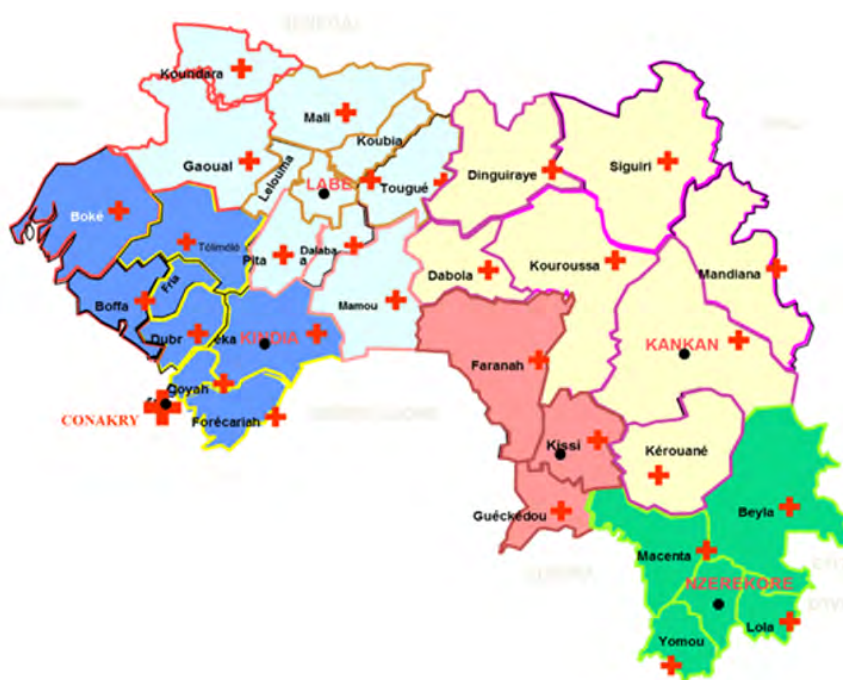
Map of the Red Cross Society of Guinea branches

In 2024 , the National Society reached more than 63,000 people through its disaster response and early recovery programmes.