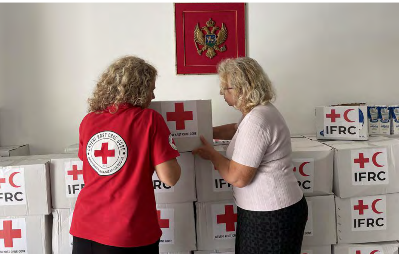
Red Cross of Montenegro volunteers distributing school supplies and assistance to people from Ukraine.

warning messages and communication channels to ensure affected communities are prepared and able to respond effectively to disasters and crises.