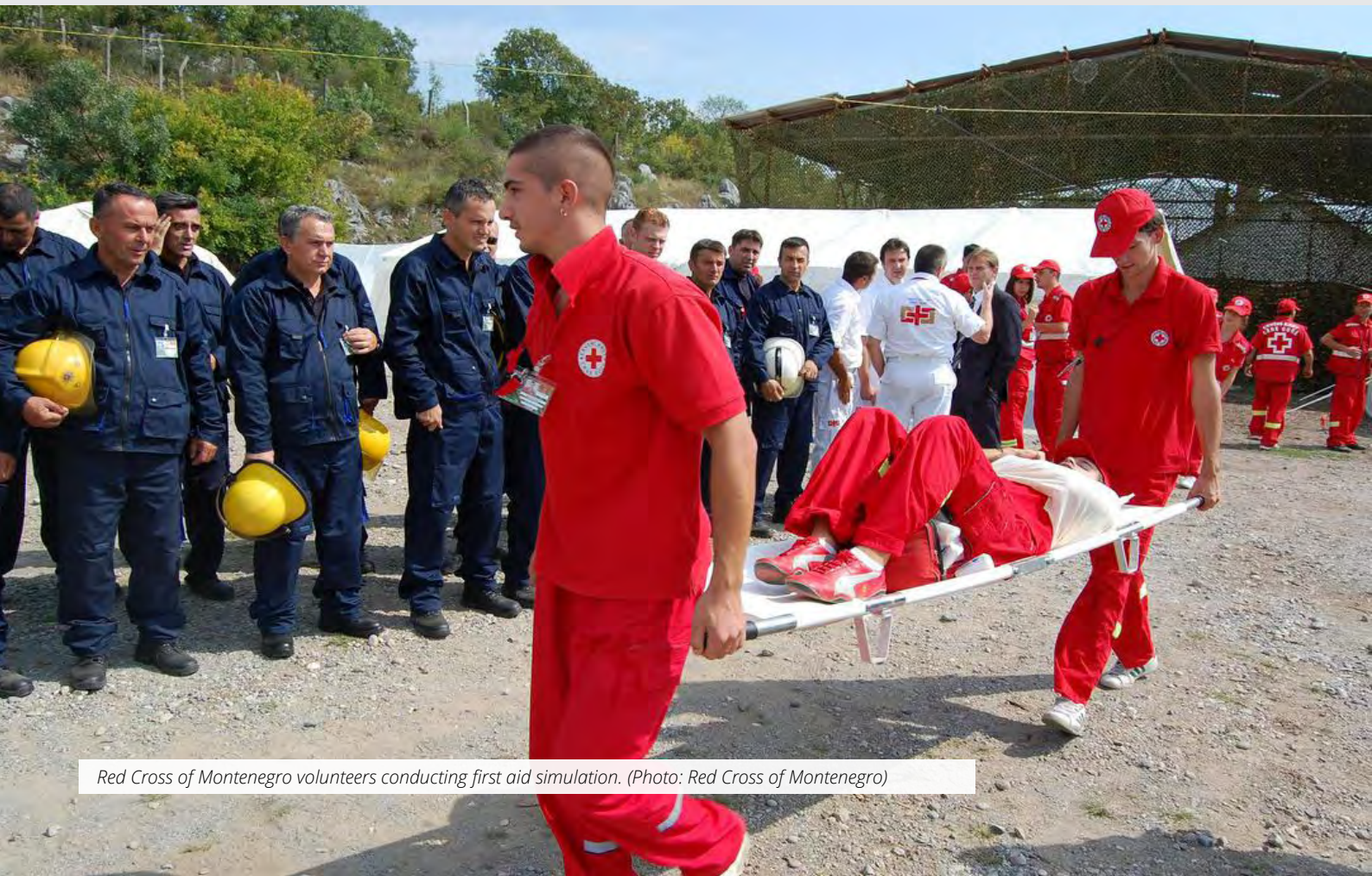
Red Cross of Montenegro volunteers conducting first aid simulation.

World Bank Population below poverty line 20.3%