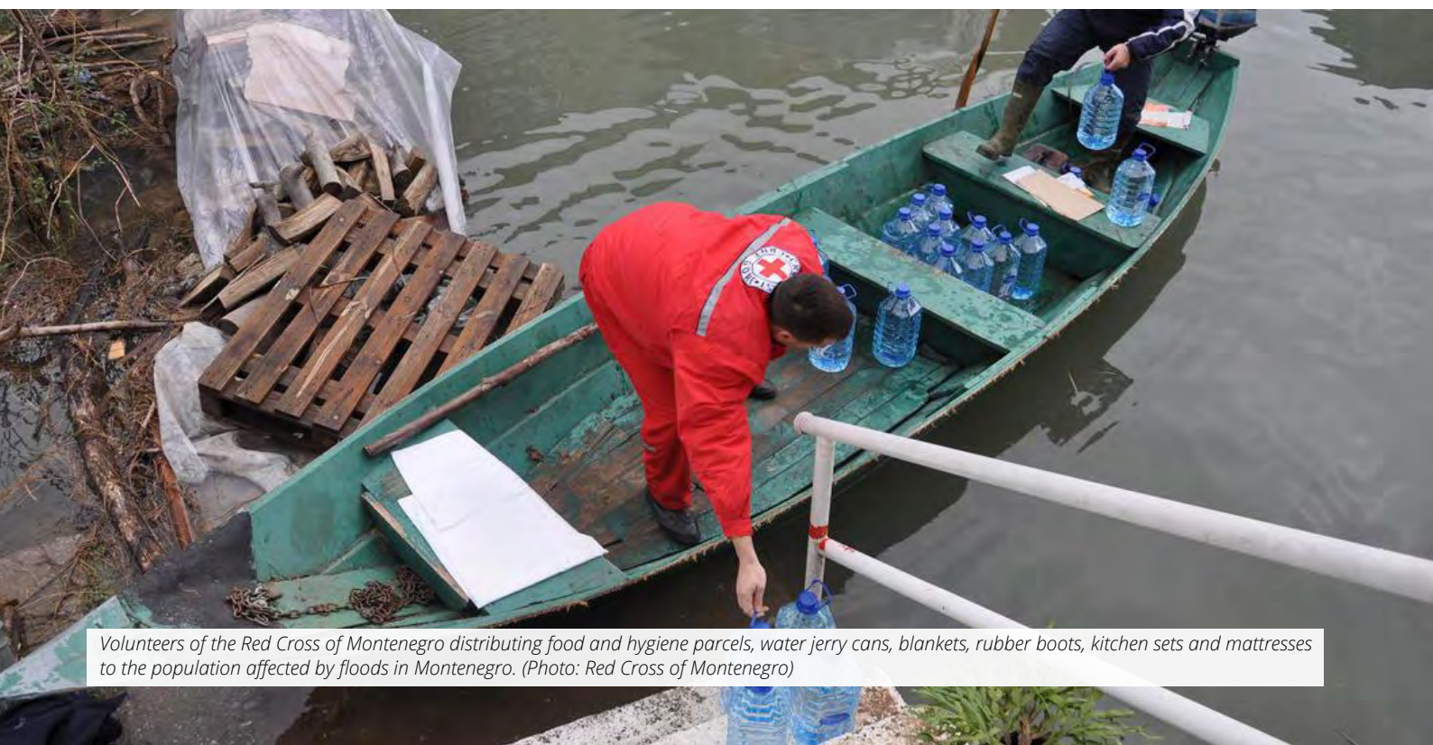
Volunteers of the Red Cross of Montenegro distributing food and hygiene parcels, water jerry cans, blankets, rubber boots, kitchen sets and mattresses to the population affected by floods in Montenegro.

The IFRC provides the National Society technical assistance, capacity building and Capacity Building Funds ( CBF ) for innovation and digitalization . The IFRC also provides guidance on disaster risk reduction , health programming, mental health and psychosocial support ( MHPSS ), volunteer management and community resilience. In recent years, the IFRC has supported the Red Cross of Montenegro in its operations through the IFRC Emergency Appeal for Ukraine and Impacted Countries Crisis .