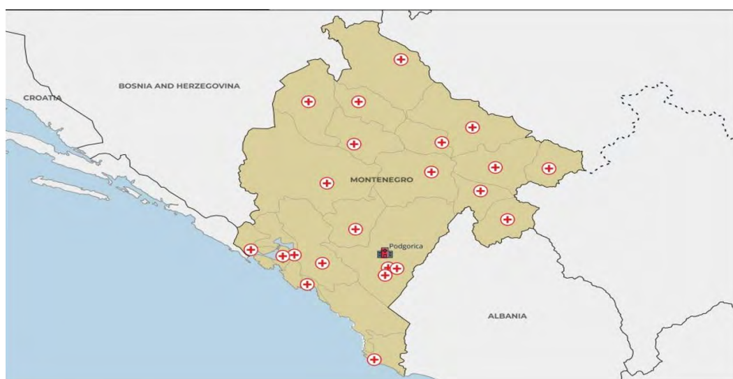
Map of Red Cross of Montenegro branches and sub-branches

In 2024 , the Red Cross of Montenegro reached around 70,000 people through its long-term services and development programmes and almost 6,000 people through its disaster response and early recovery programmes.