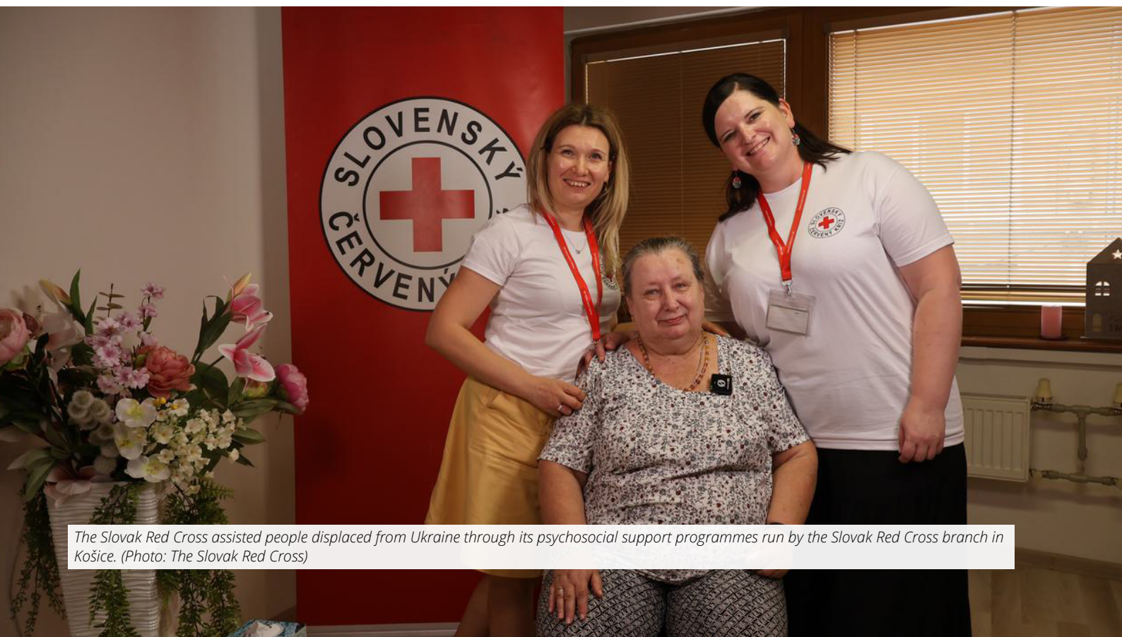
The Slovak Red Cross assisted people displaced from Ukraine through its psychosocial support programmes run by the Slovak Red Cross branch in Košice.

The Slovak Red Cross is collaborating with the 510 Team to develop a work plan for a comprehensive digital transformation process. This plan includes establishing a centralized data system integrating planning, monitoring, evaluation and reporting (PMER), CEA and CVA modules via EspoCRM and 121 platforms. The goal is to improve data management, analysis, evidence-based decision-making and accountability. The finalized work plan will outline technical, and funding needs to implement the system and strengthen the National Society's emergency response readiness.