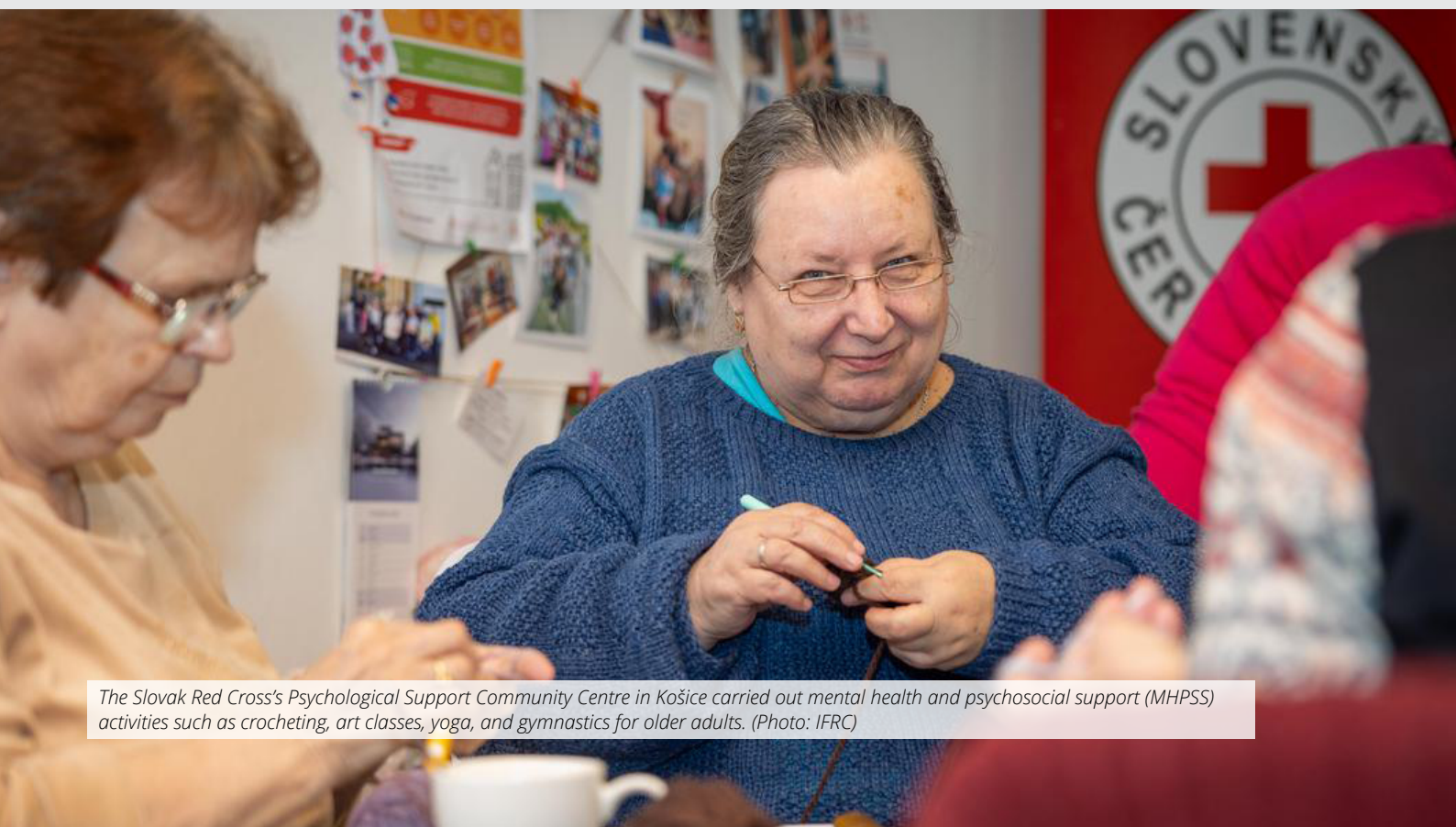
The Slovak Red Cross's Psychological Support Community Centre in Košice carried out mental health and psychosocial support (MHPSS) activities such as crocheting, art classes, yoga, and gymnastics for older adults.

World Bank Population below poverty line 14%