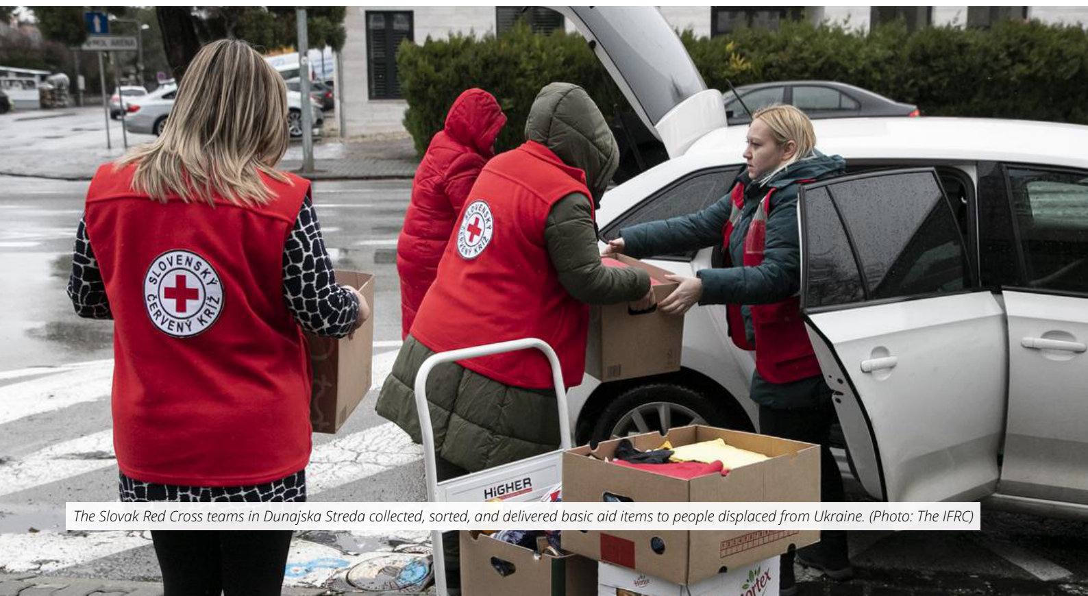
The Slovak Red Cross teams in Dunajská Streda collected, sorted, and delivered basic aid items to people displaced from Ukraine.

The IFRC and the 510 team from the Netherlands Red Cross will support the National Society to undergo a comprehensive digital transformation.