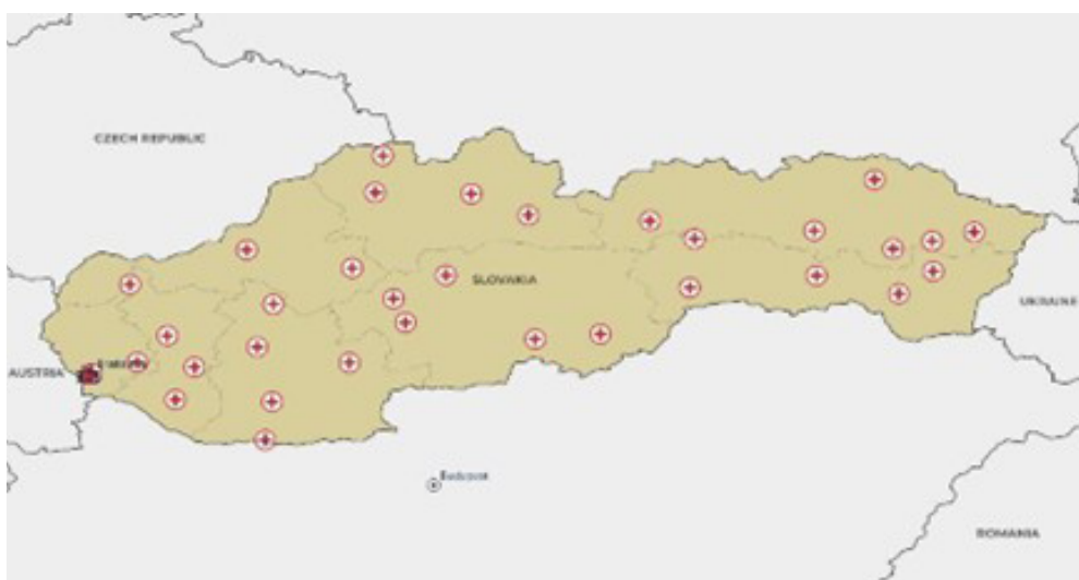
Map showing the Slovak Red Cross branches

In 2023 , the Slovak Red Cross reached 280,000 people by its long-term services and development programmes and around 24,000 people by its disaster response and early recovery programmes.