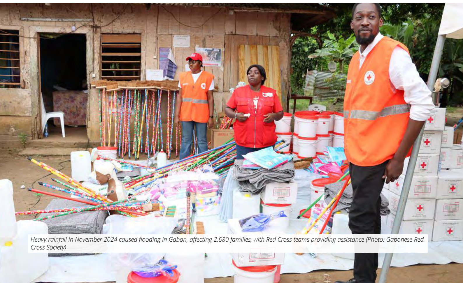
Heavy rainfall in November 2024 caused flooding in Gabon, affecting 2,680 families, with Red Cross teams providing assistance

The IFRC long-term support to the Gabonese Red Cross Society consists of disseminating branch-level climate forecasts and information on climate-smart programming . It also supports the implementation of environmental and climate campaigns focused on behaviour change, reduction in plastic usage, as well as the establishment of climate-smart offices. The IFRC works to ensure that the Gabonese Red Cross Society is well represented and involved in climate change platforms at the national and regional levels and will ensure the participation of the National Society in various webinars and training on climate change. This targeted assistance helps in reducing the current and future humanitarian impacts of climate and environmental crises and helps people thrive in the face of these crises. The IFRC supports the National Society in integrating climate risk management into all the programmes, operations, and advocacy and enable the National Society to adopt better environmental management in its approaches.