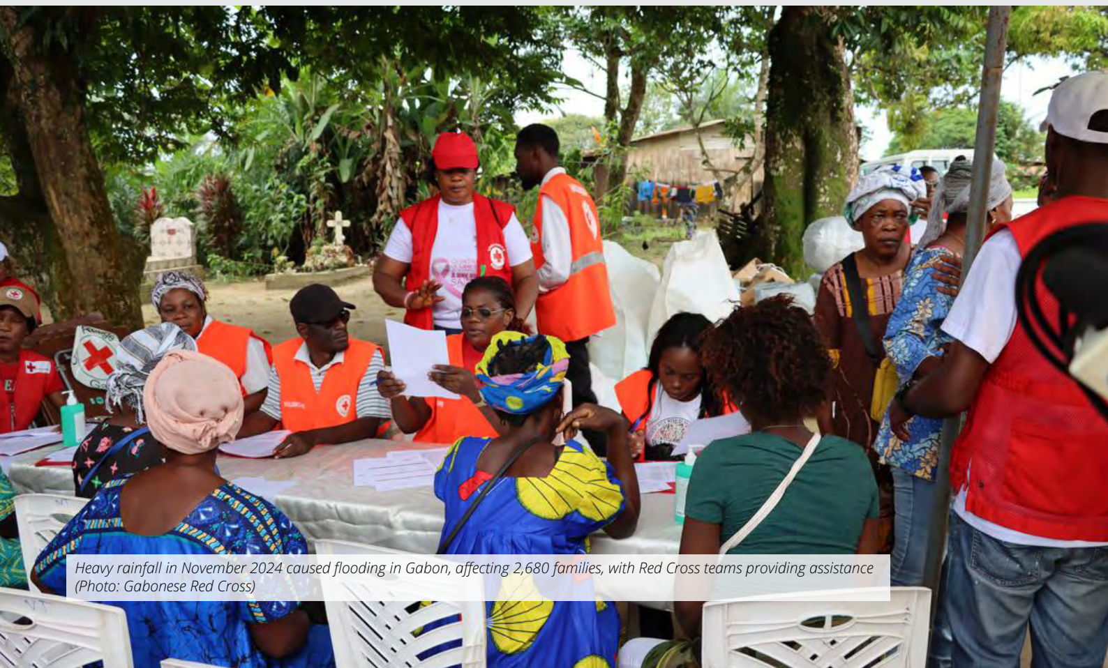
Heavy rainfall in November 2024 caused flooding in Gabon, affecting 2,680 families, with Red Cross teams providing assistance