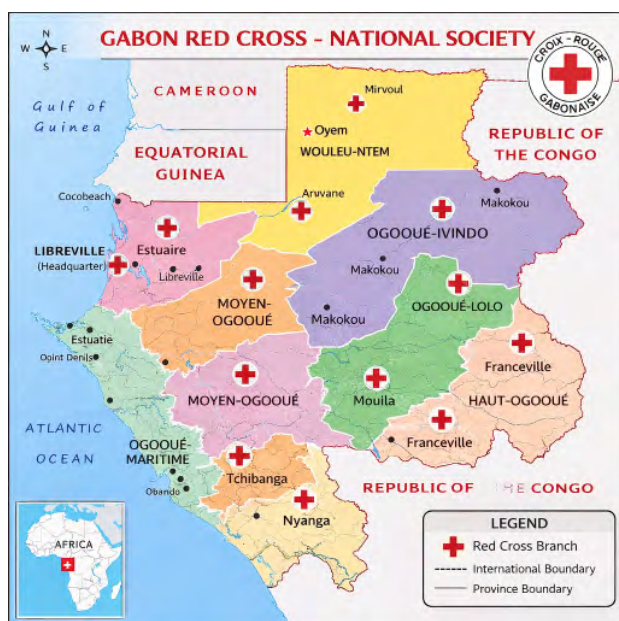
Map of the Gabon Red Cross branches

The map does not imply the expression of any opinion on the part of the IFRC or the National Society concerning the legal status of a territory or its authorities