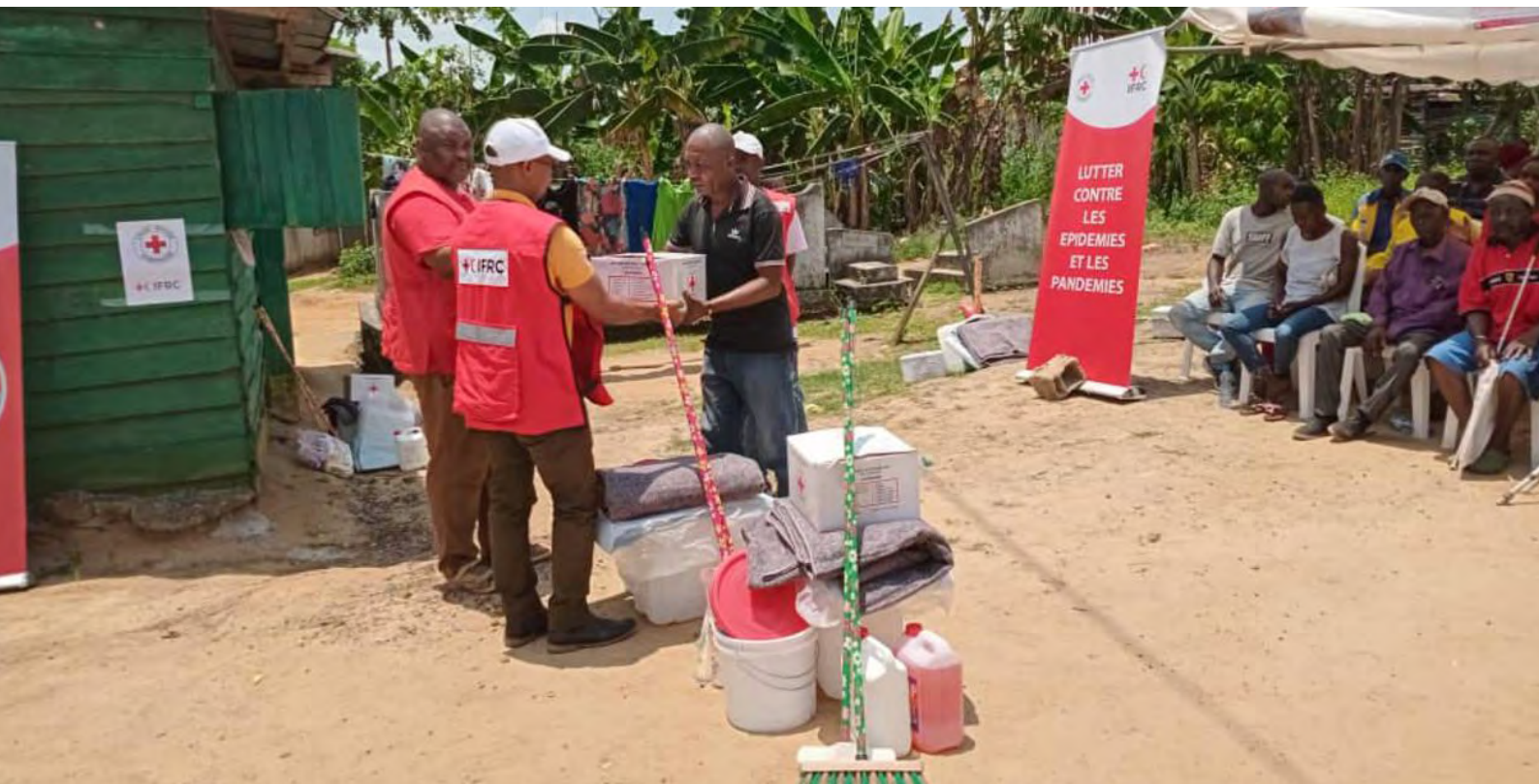
Heavy rainfall in November 2024 caused flooding in Gabon, affecting 2,680 families, with Red Cross teams providing assistance

The IFRC supports the National Society's efforts in humanitarian diplomacy which includes providing the resources for the operationalization of the Gabonese Red Cross Society website to enhance the National Society's reach among the youth population and increase its visibility. The main objective is increasing the influence and widening the profile of the Gabonese Red Cross Society, and to obtain financial support for a better humanitarian response.