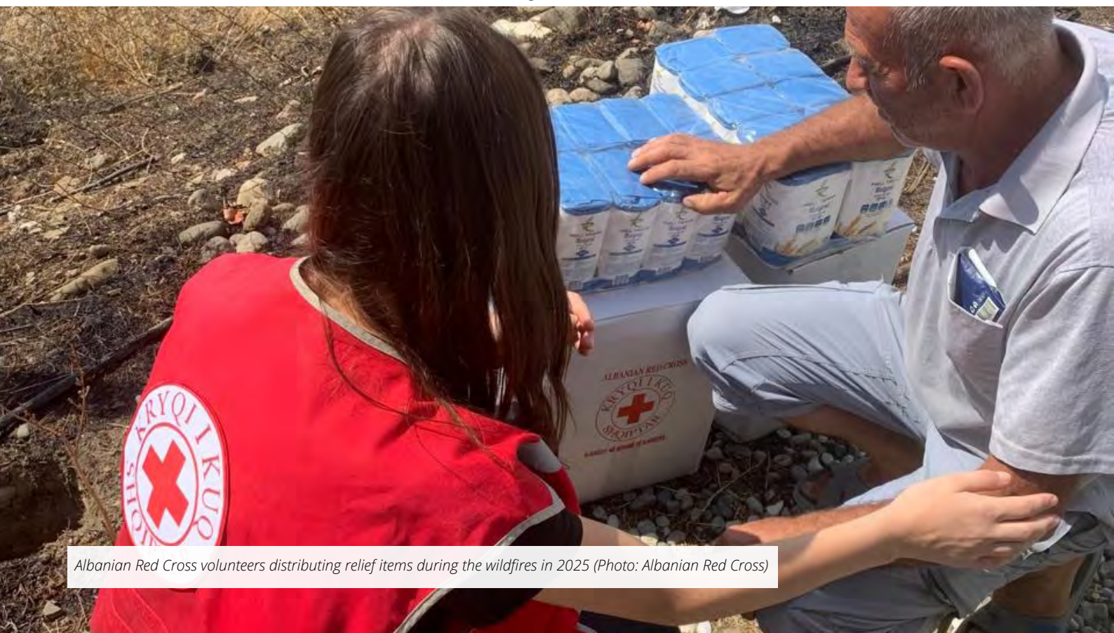
Albanian Red Cross volunteers distributing relief items during the wildfires in 2025

In 2025, the Qatar Red Crescent Society pledged to provide support to the Albanian Red Cross, particularly focusing on assisting families in need. This support may include the distribution of food packages and essential supplies and initiatives designed to strengthen community resilience.