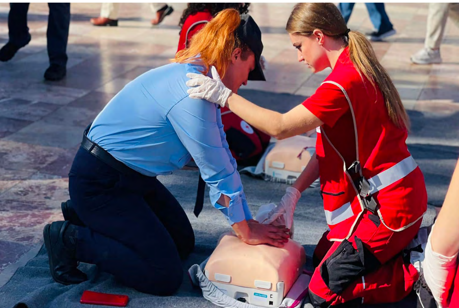
Teams from the Albanian Red Cross carried out activities for World Restart a Heart Day in 2024

The IFRC will work closely with the Albanian Red Cross to develop and implement policies, action plans and coordination mechanisms that address the specific challenges faced by migrants and displaced populations. The IFRC will also facilitate coordination and collaboration among National Societies involved in migration activities. It will provide a platform for sharing information, resources and best practices across borders. In line with the Integration and Inclusion Framework plans developed by the Albanian Red Cross, the IFRC will provide guidance, technical expertise and resources to support the National Society in implementing inclusive programmes that promote protection and gender equality.