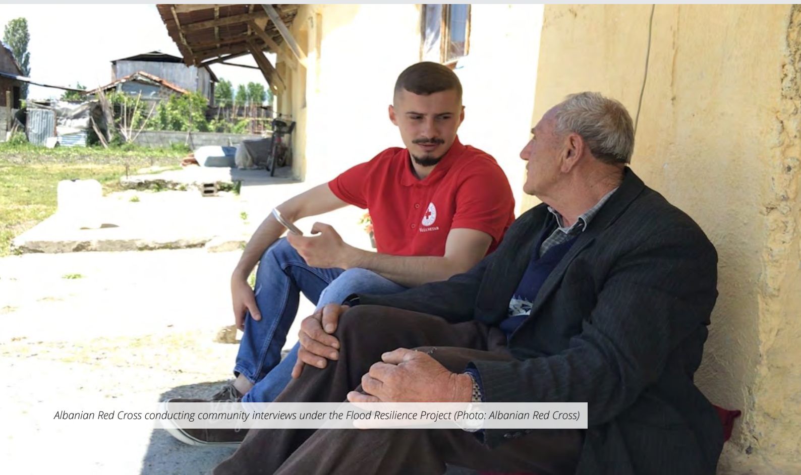
Albanian Red Cross conducting community interviews under the Flood Resilience Project

World Bank Population below poverty line 20%