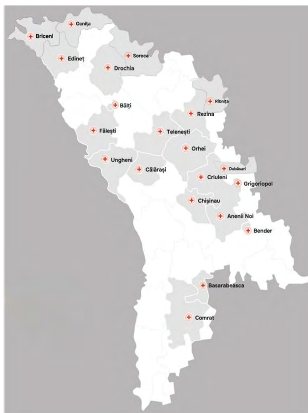
Map of the branches of Moldova Red Cross Society

In 2023 , the Moldova Red Cross Society reached 31,000 people through its migration services.