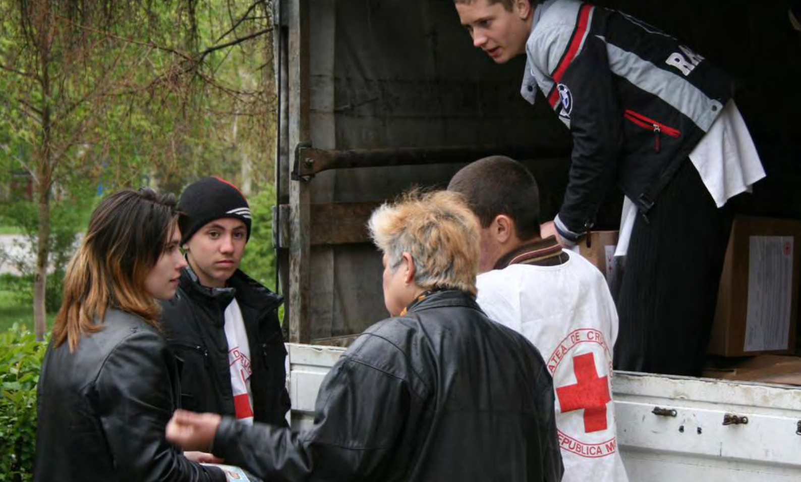
Moldova Red Cross Society volunteers unloading food parcels to deliver additional food for the most vulnerable people including lonely elderly, one headed families and families with many children.