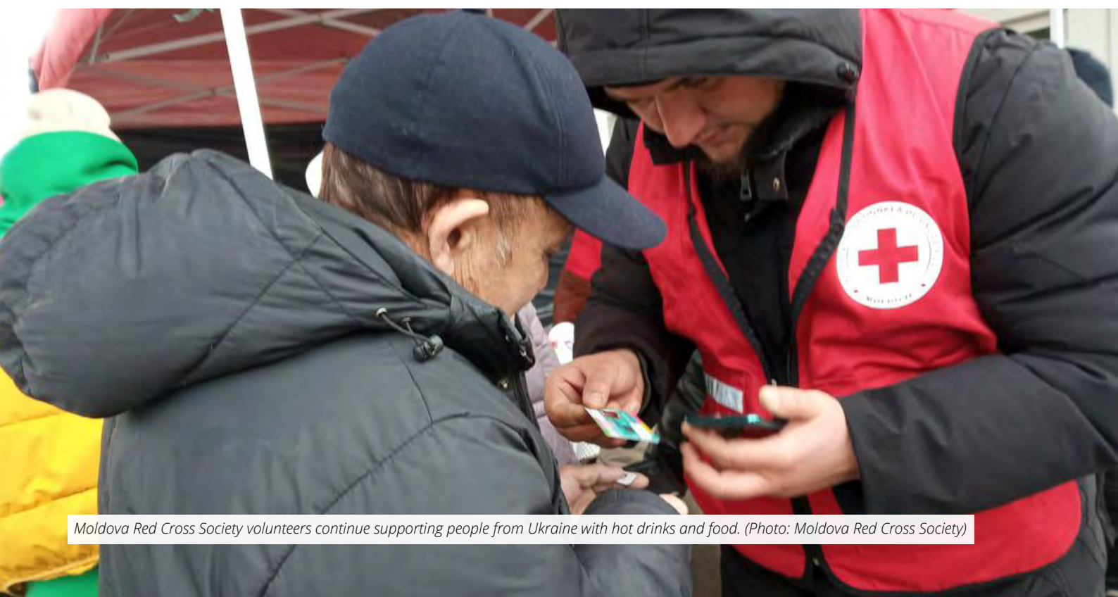
Moldova Red Cross Society volunteers continue supporting people from Ukraine with hot drinks and food.