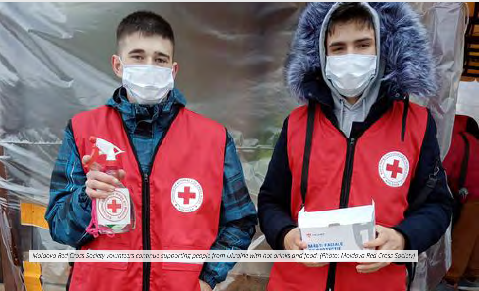
Moldova Red Cross Society volunteers continue supporting people from Ukraine with hot drinks and food.