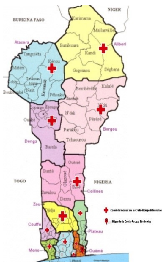
Map of Red Cross of Benin branches

In 2024 , the Red Cross of Benin reached more than 296,000 people through its disaster response and early recovery programmes and 6.2 million people through long term services and development programmes.