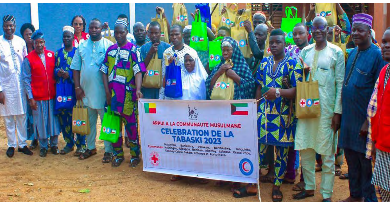
Red Cross of Benin and Kuwait Red Crescent support communities with daily food essentials

The IFRC support to the National Society consists of technical guidance and financial support to enable the National Society to effectively meet its objectives. Support for the National Society extend to areas such as the strengthening its health portfolio and resource mobilization for health initiatives. The IFRC support capacitates the staff and volunteers of the Red Cross of Benin to provide enhanced humanitarian services in their respective regions and to meet the health and wellbeing needs of their communities.