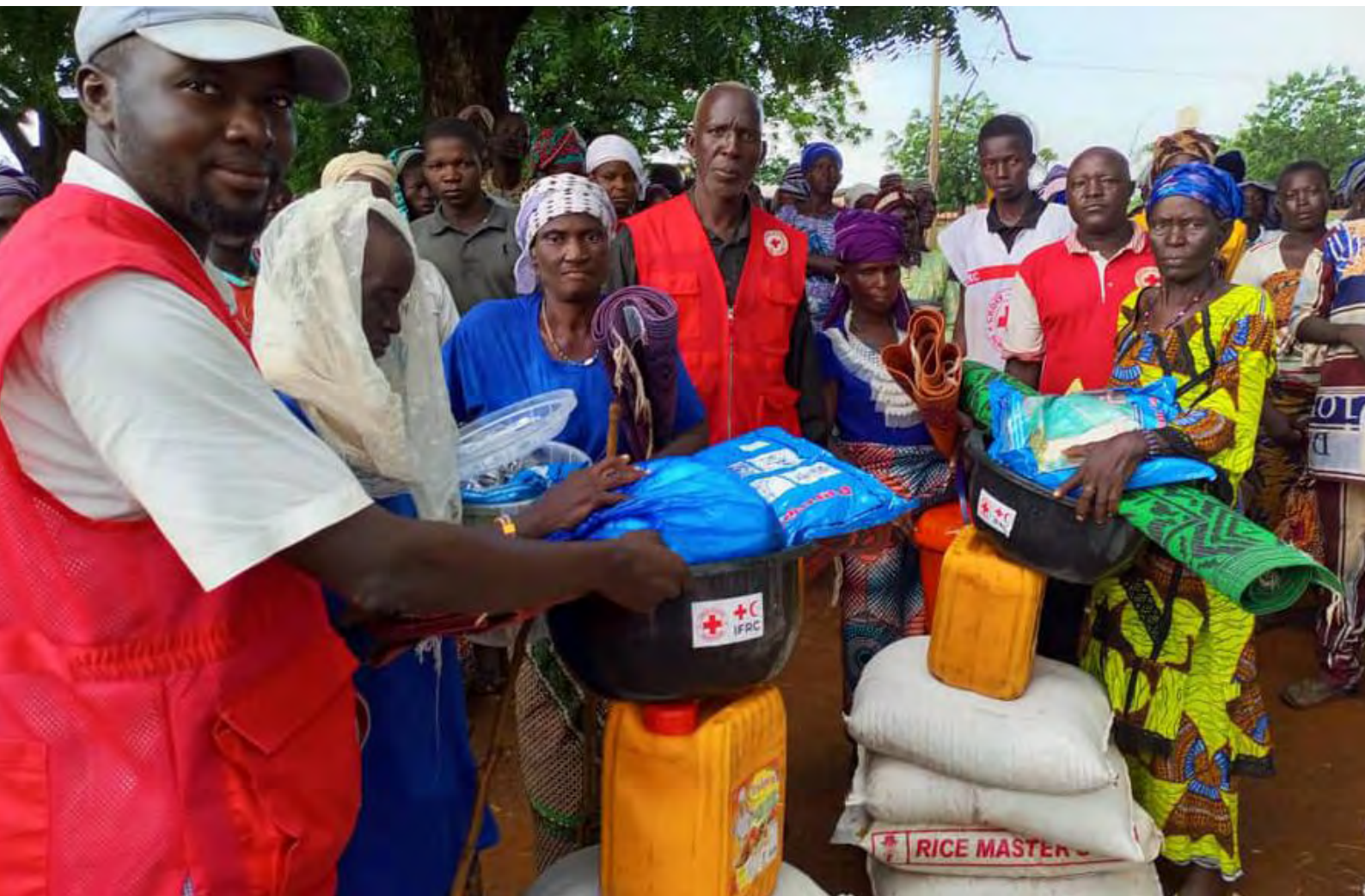
Red Cross Benin, with IFRC support, provided vital aid to 500 displaced households across Tanguiéta, Matéri and Kérou

The Swiss Red Cross supports the Red Cross of Benin through a project to improve community health and contributes to organizational development activities.