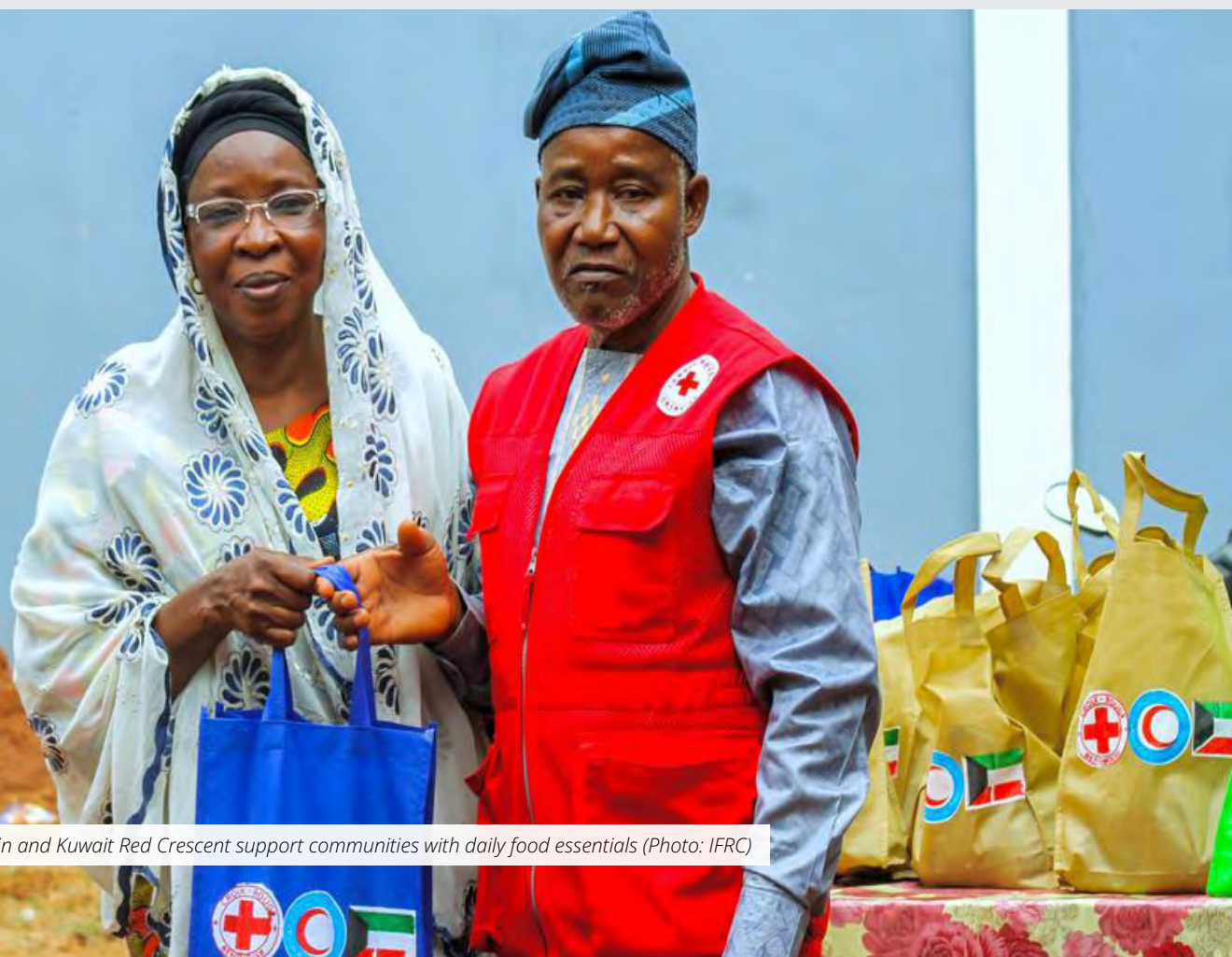
Red Cross of Benin and Kuwait Red Crescent support communities with daily food essentials