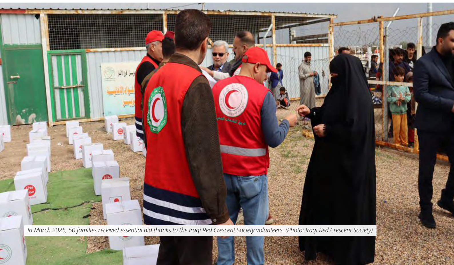
In March 2025, 50 families received essential aid thanks to the Iraqi Red Crescent Society volunteers.

The Government of Iraq has committed to durable solutions through the National Plan for Displacement Resolution, emphasizing return, relocation, and local integration. Implementation remains uneven, with destroyed housing, insecurity, and lack of livelihoods limiting progress. The 2024 closure of formal IDP camps was accompanied by limited