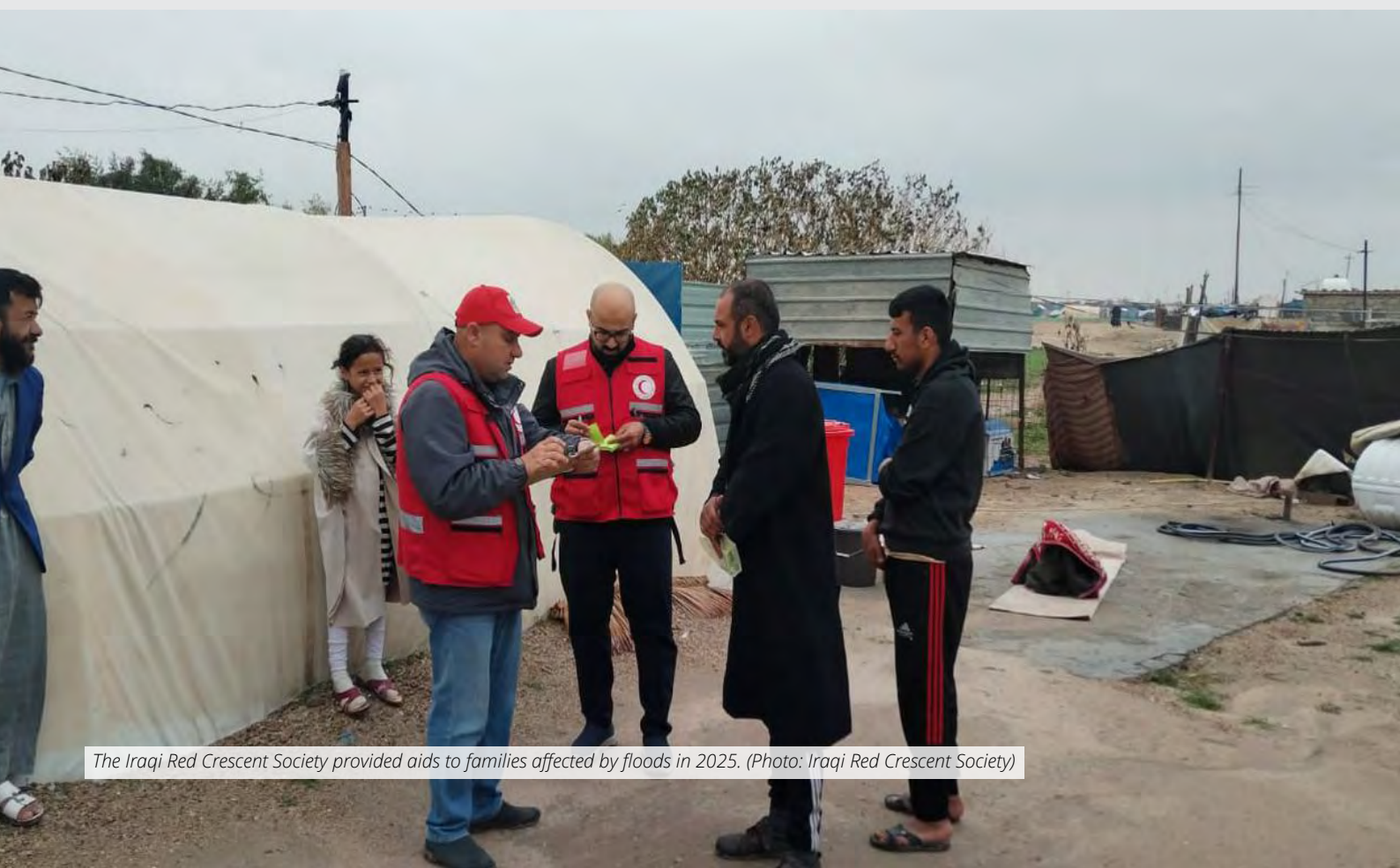
The Iraqi Red Crescent Society provided aids to families affected by floods in 2025.