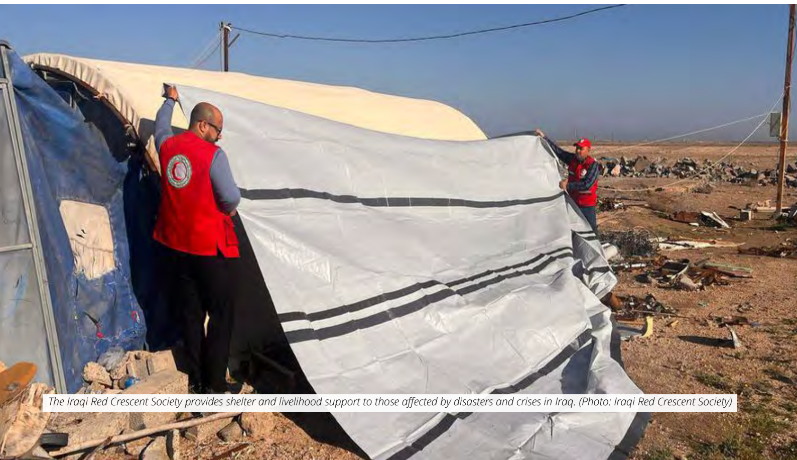
The Iraqi Red Crescent Society provides shelter and livelihood support to those affected by disasters and crises in Iraq.

The Danish Red Cross will continue supporting the Iraqi Red Crescent Society in mainstreaming Mental Health and Psychosocial Support (MHPSS) across its programs and services. This support aims to strengthen the National Society's capacity to integrate MHPSS principles into all sectors, ensuring that the psychological well-being of affected individuals and communities is prioritized alongside physical health and humanitarian response.