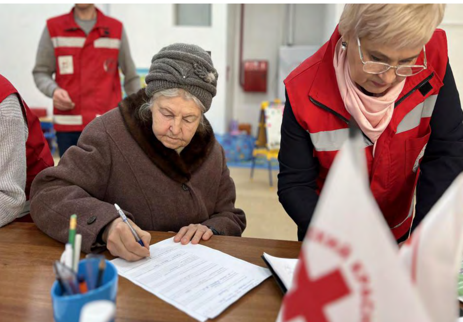
The Russian Red Cross assists displaced people by providing them with food, hygiene, household items and financial assistance.

The IFRC supports the Russian Red Cross in non-remunerated blood donation, methodological materials, and best practices on hygiene services during pandemics. It also supports the National Society by facilitating technical assistance and funding access for initiatives related to health ageing, non-communicable diseases, and support for individuals with HIV, tuberculosis and other communicable diseases. The IFRC supports the National Society with relevant training to enhance its capacity in providing mental health and psychosocial support (MHPSS) and integrates these activities in emergency response. It will also encourage the National Society's participation in networks and forums related to first aid and MHPSS .