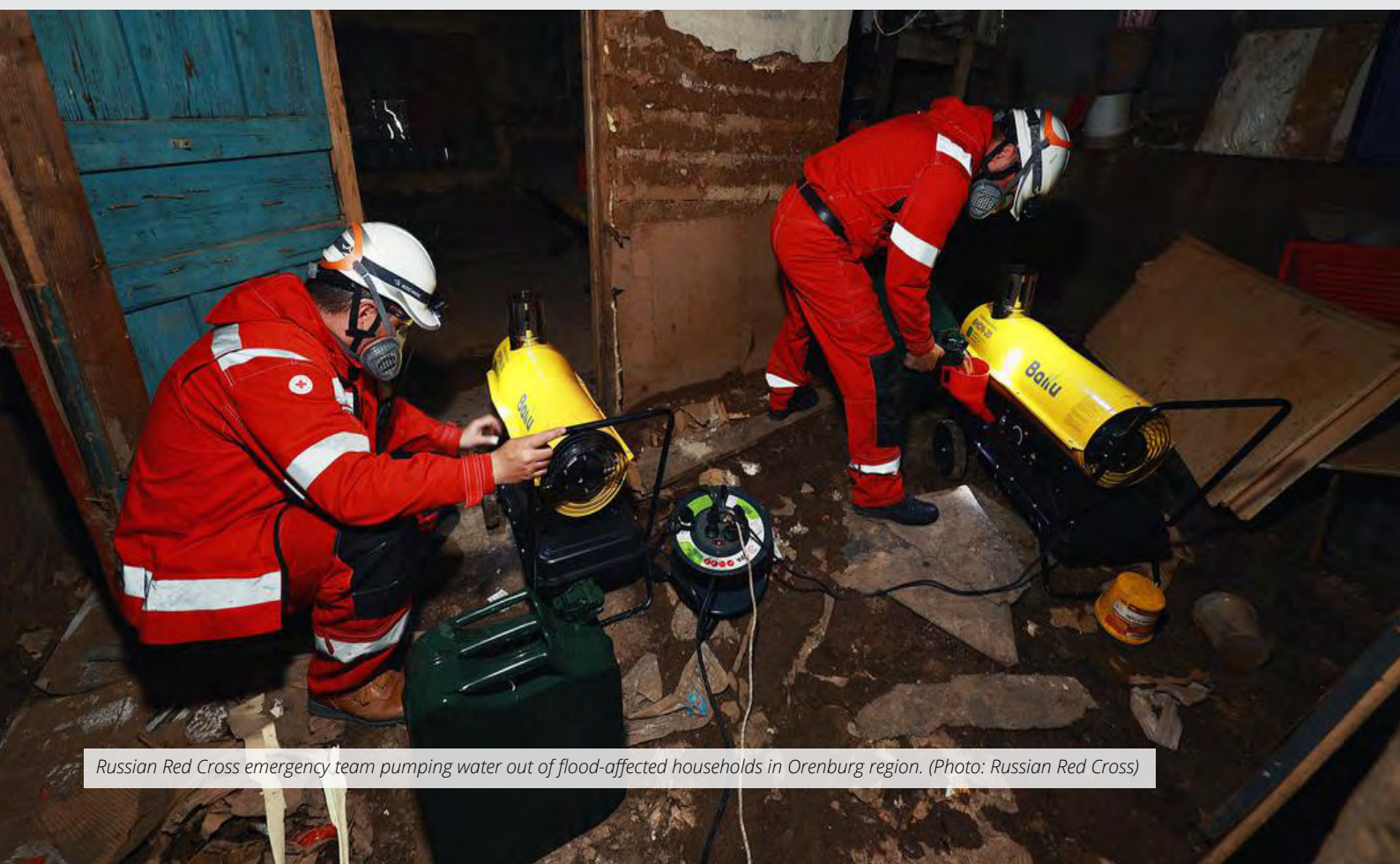
Russian Red Cross emergency team pumping water out of flood-affected households in Orenburg region.

World Bank Population below poverty line 12%