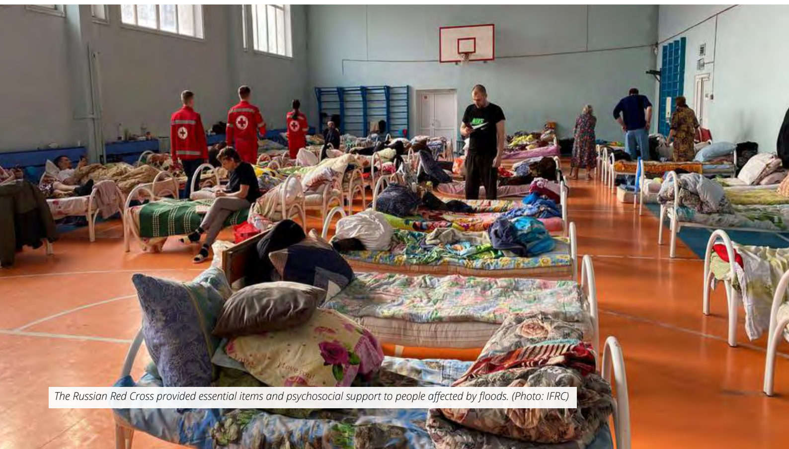
The Russian Red Cross provided essential items and psychosocial support to people affected by floods.

operations. These included floods, wildfires, violent attacks, and population movement in Russia. The IFRC also provides technical support to the National Society on a broad range of services, including disaster response, health, social inclusion, and migration.