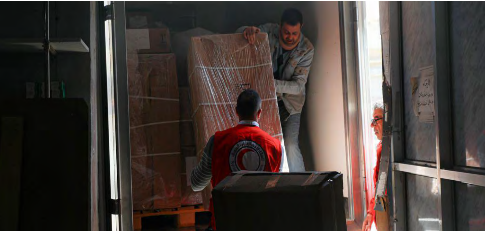
The Syrian Arab Red Crescent provided hospitals with mobility aids, and essential supplies to ensure the continuity of vital medical services.

The Swiss Red Cross will continue with its efforts to strengthening the National Society's disaster management department and responses on the ground through the provision of resources for the respective responses and the collaboration in the field of National Society Preparedness.