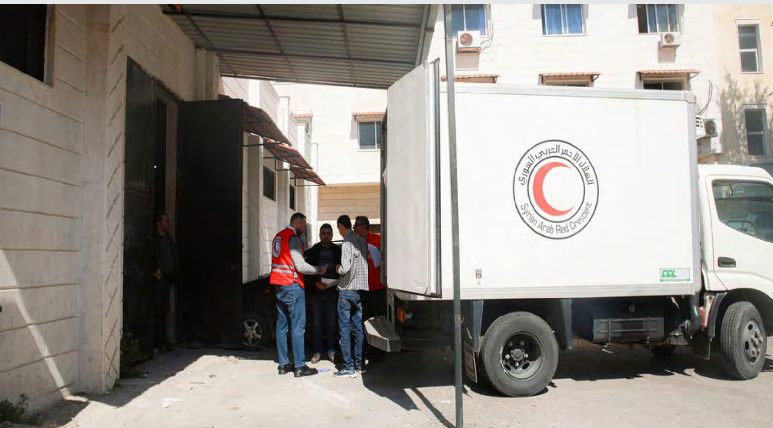
After the violence in coastal Syria, the Syrian Arab Red Crescent provided hospitals with emergency medical and surgical kits.

World Bank Population below poverty line 37.7%