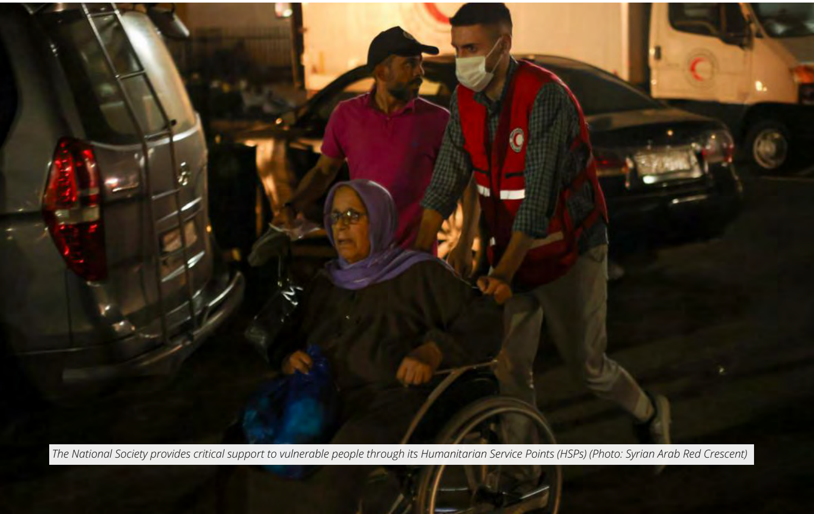
The National Society provides critical support to vulnerable people through its Humanitarian Service Points (HSPs)

In recent years, the IFRC has supported the Syrian Arab Red Crescent through a number of Disaster Response Emergency Fund (DREF) and Emergency Appeal operations in relation to complex emergencies, earthquakes, population movement, droughts, wildfires, floods, and disease outbreaks.