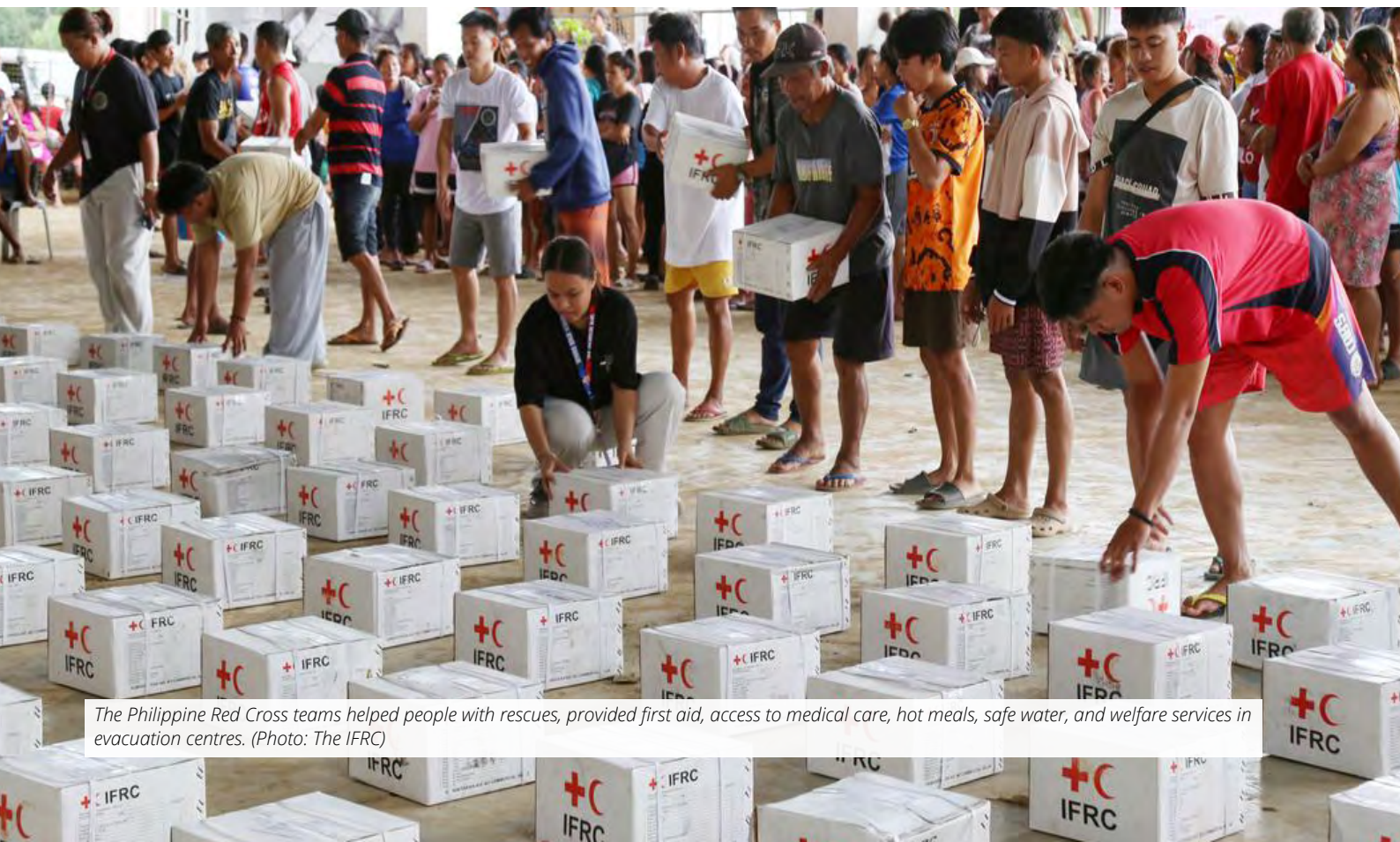
The Philippine Red Cross teams helped people with rescues, provided first aid, access to medical care, hot meals, safe water, and welfare services in evacuation centres.

The Spanish Red Cross will continue to provide support through various initiatives, including the Green Livelihood project in Zamboanga and the improvement of the coconut value-chain in Maguindanao through circular economy practices. It will also support the introduction of nature-based solutions in Tarlac and Eastern Samar and integrate WASH programming into circular economy projects. Additionally, the Spanish Red Cross will focus on employment initiatives and help the National Society in developing a long-term employability strategy.