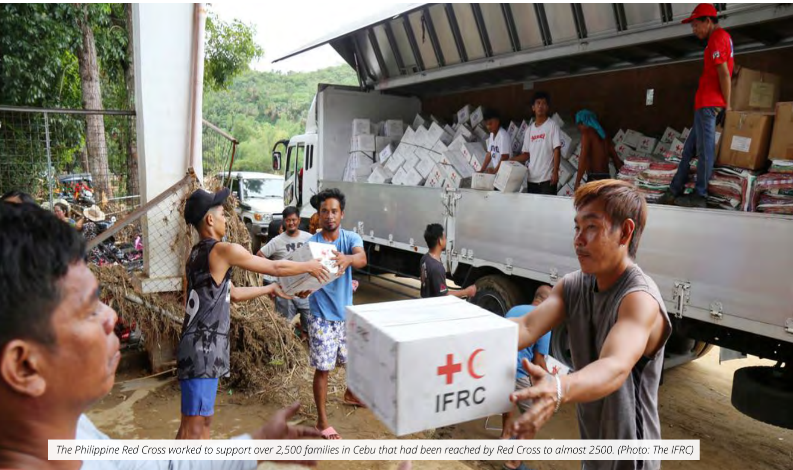
The Philippine Red Cross worked to support over 2,500 families in Cebu that had been reached by Red Cross to almost 2500.

The Spanish Red Cross will support the Philippine Red Cross on disaster preparedness and mitigation, particularly through projects that focus on livelihood as a key factor in building and reinforcing the resilience of vulnerable communities.