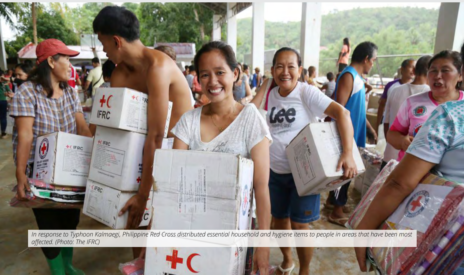
In response to Typhoon Kalmaegi, Philippine Red Cross distributed essential household and hygiene items to people in areas that have been most affected.