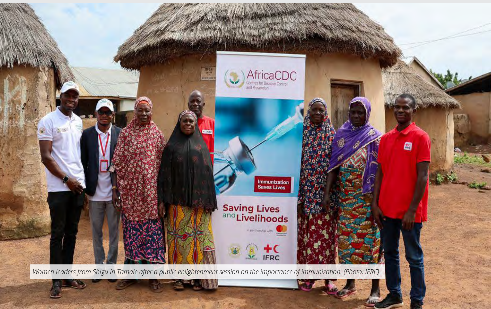
Women leaders from Shigu in Tamale after a public enlightenment session on the importance of immunization.