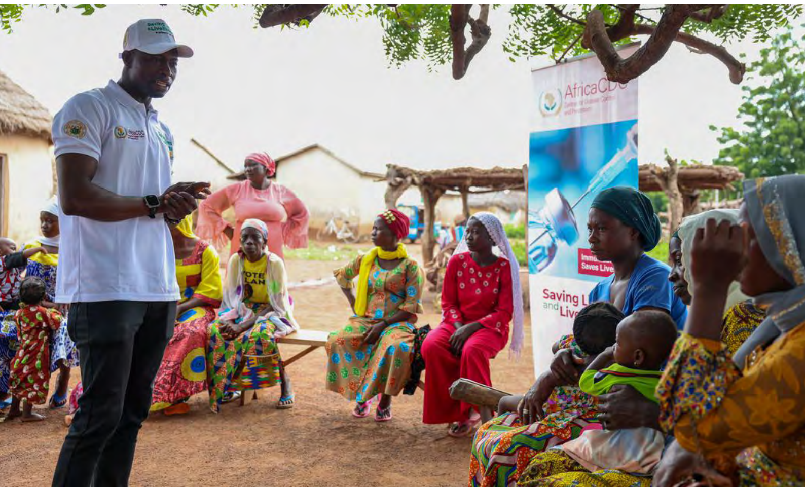
A community volunteer leading advocacy effort in Shigu community in Tamale, northern Ghana.

risk reduction and adaptation efforts, the IFRC will support the National Society to promote knowledge of the risk, adaptation, and mitigation of climate change among communities, governments, and public institutions.