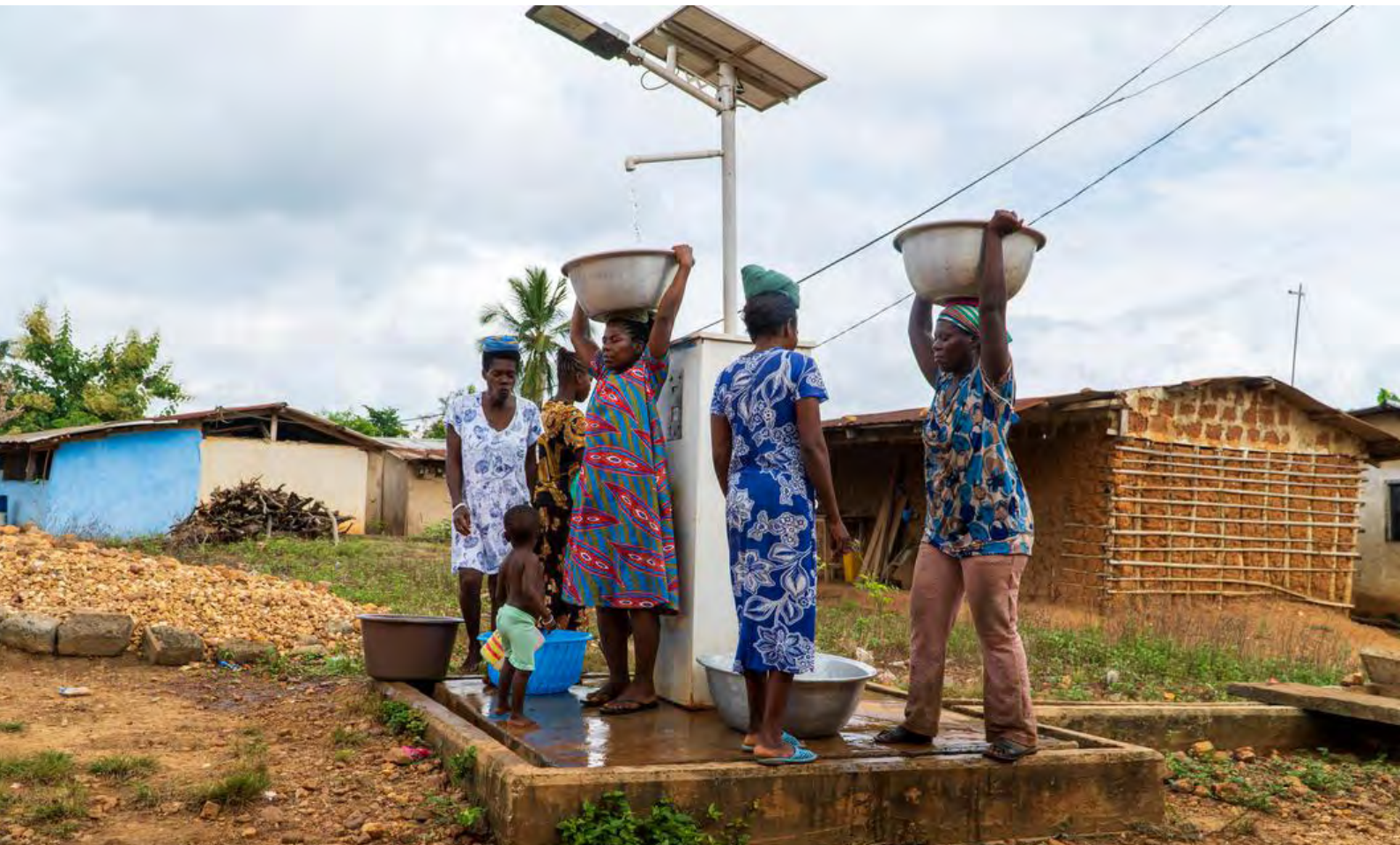
The Ghana Red Cross Society set up 18 water projects across regions to provide clean water to citizens.

The ICRC will assist the Ghana Red Cross Society in institutionalizing security management, with particular attention to volatile and high-tension operating contexts.