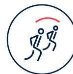
Migration & displacement