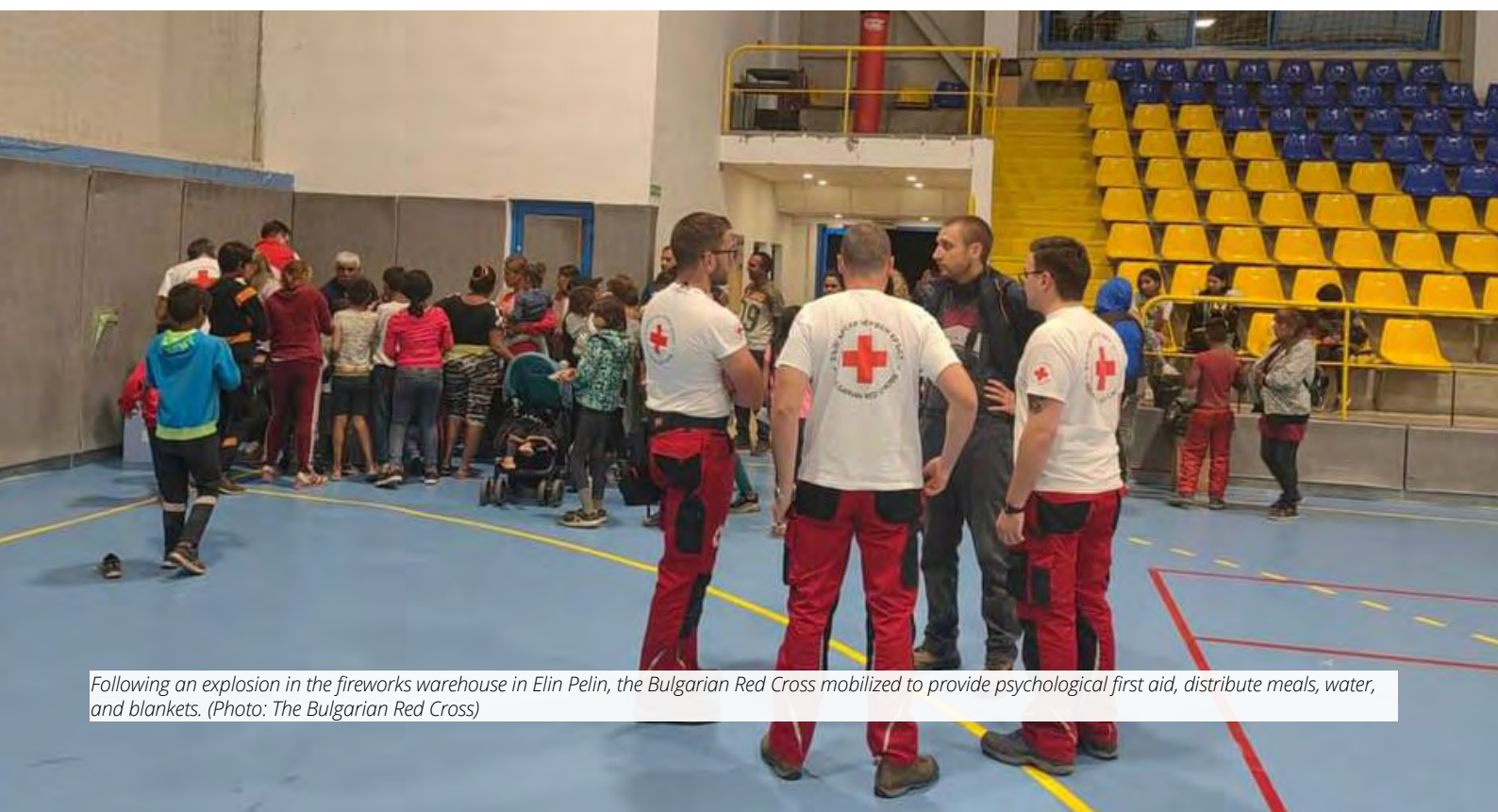
Following an explosion in the fireworks warehouse in Elin Pelin, the Bulgarian Red Cross mobilized to provide psychological first aid, distribute meals, water, and blankets.

IFRC mechanisms such as the Disaster Response Emergency Fund ( IFRC-DREF ) and Emergency Appeals will be drawn on as needed for the National Society to respond to disasters and crises.