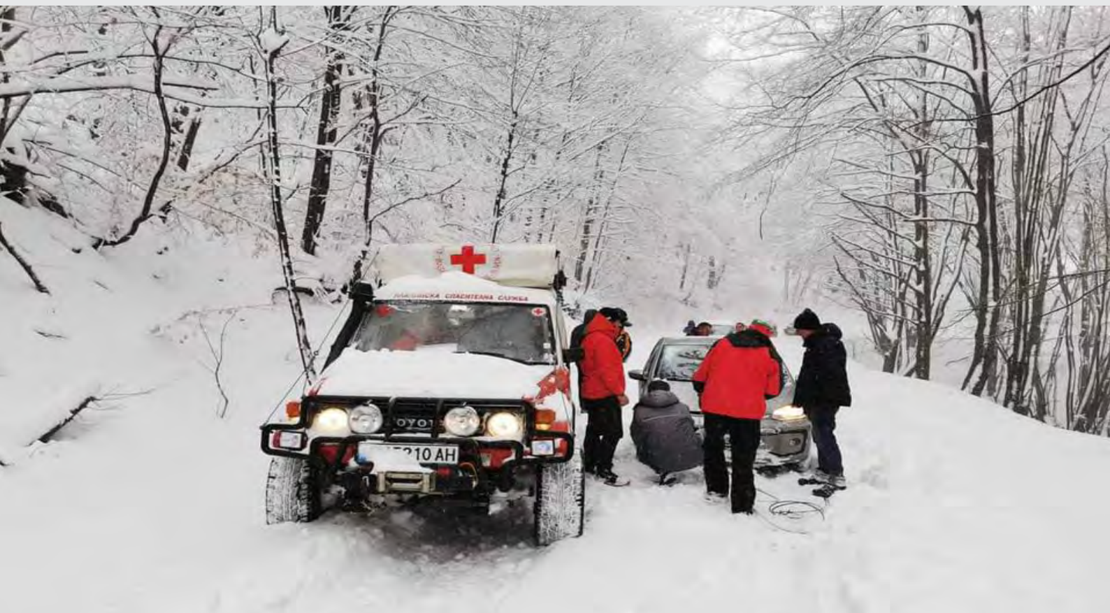
The Bulgarian Red Cross responded to people affected by a heavy snowfall in Sliven.

World Bank Population below poverty line 22%