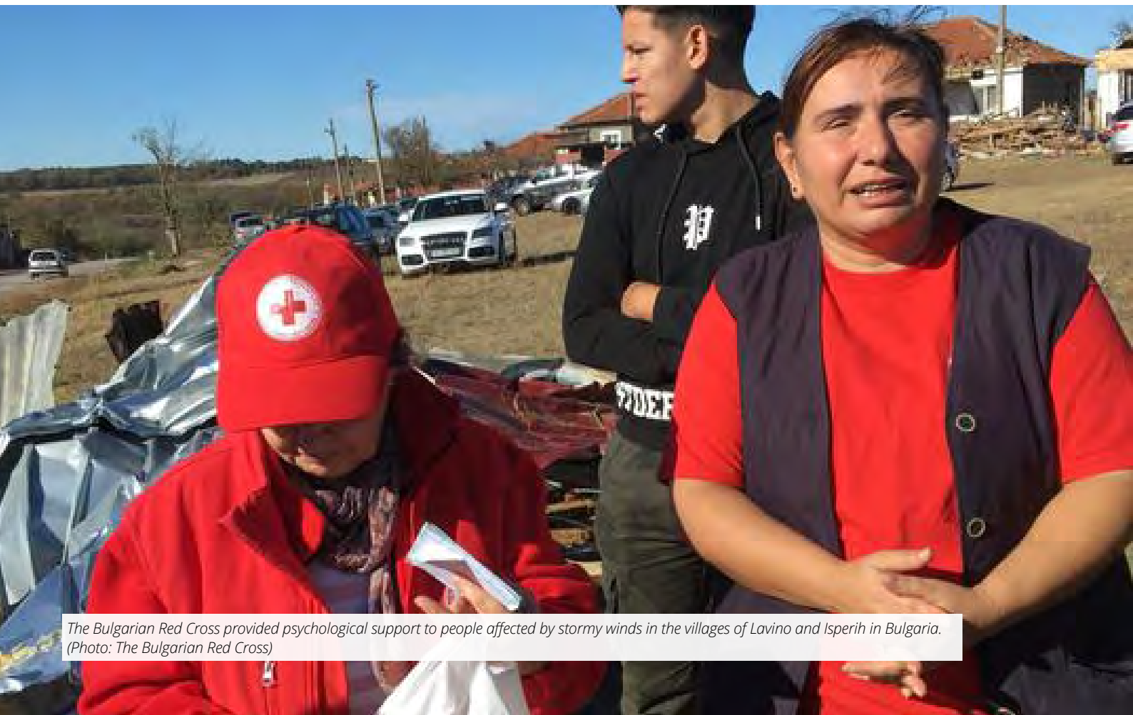
The Bulgarian Red Cross provided psychological support to people affected by stormy winds in the villages of Lavino and Isperih in Bulgaria.

The IFRC aids the Bulgarian Red Cross through emergency appeals and the Disaster Relief Emergency Fund (DREF) , addressing disasters and crises and assisting individuals.