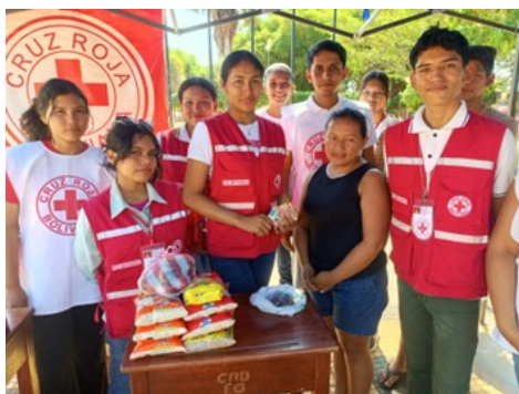
Volunteers Distributing Food Supplies, Guayaramerin, Aug 2025.