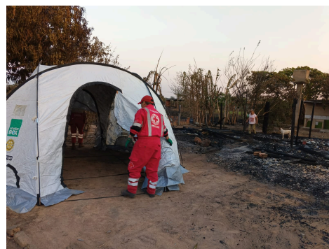
Volunteer in Fire-Affected Areas, Aug 2025.