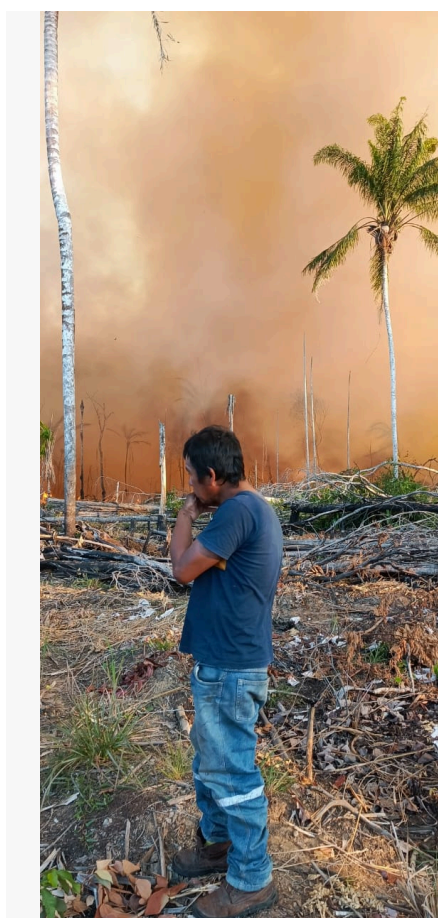
Wildfires in Guayaramerin, Aug 2025.