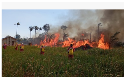
Firefighters Responding to Wildfires. Guayaramerin, Beni, Aug 2025.

This emergency is unfolding in the context of Bolivia's presidential electoral process, currently in its runoff phase. This political transition introduces additional complexity to institutional coordination and operational continuity, reinforcing the importance of maintaining robust and agile mechanisms for humanitarian response.