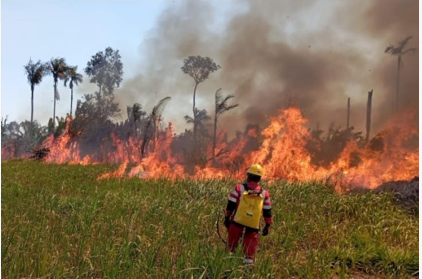
Wildfires in Guyamarin Municipality. August 2025.