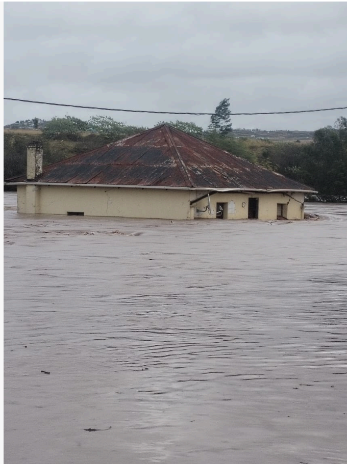
Submerged household in Eastern Cape