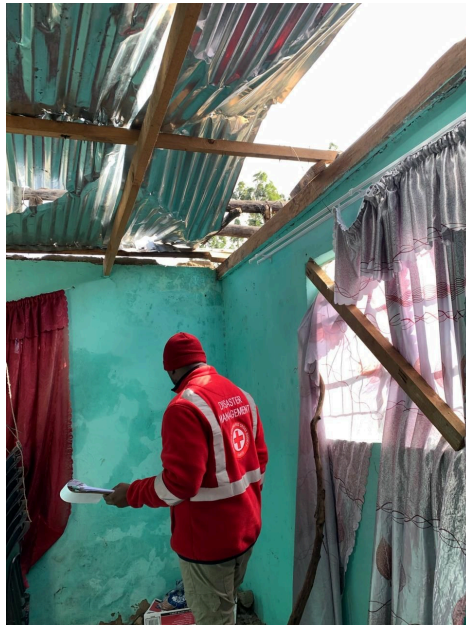
Volunteers conducting assessments in KZN