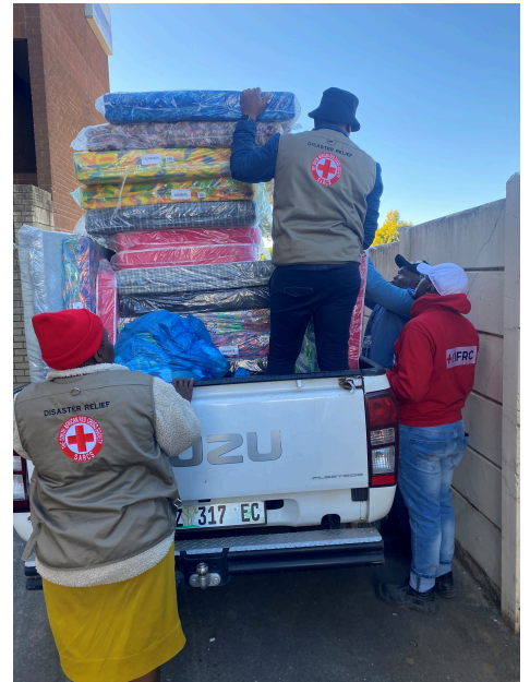
Relief items being distributed in Eastern Cape