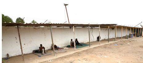
Installed Shelter at Nagad center, Djibouti.