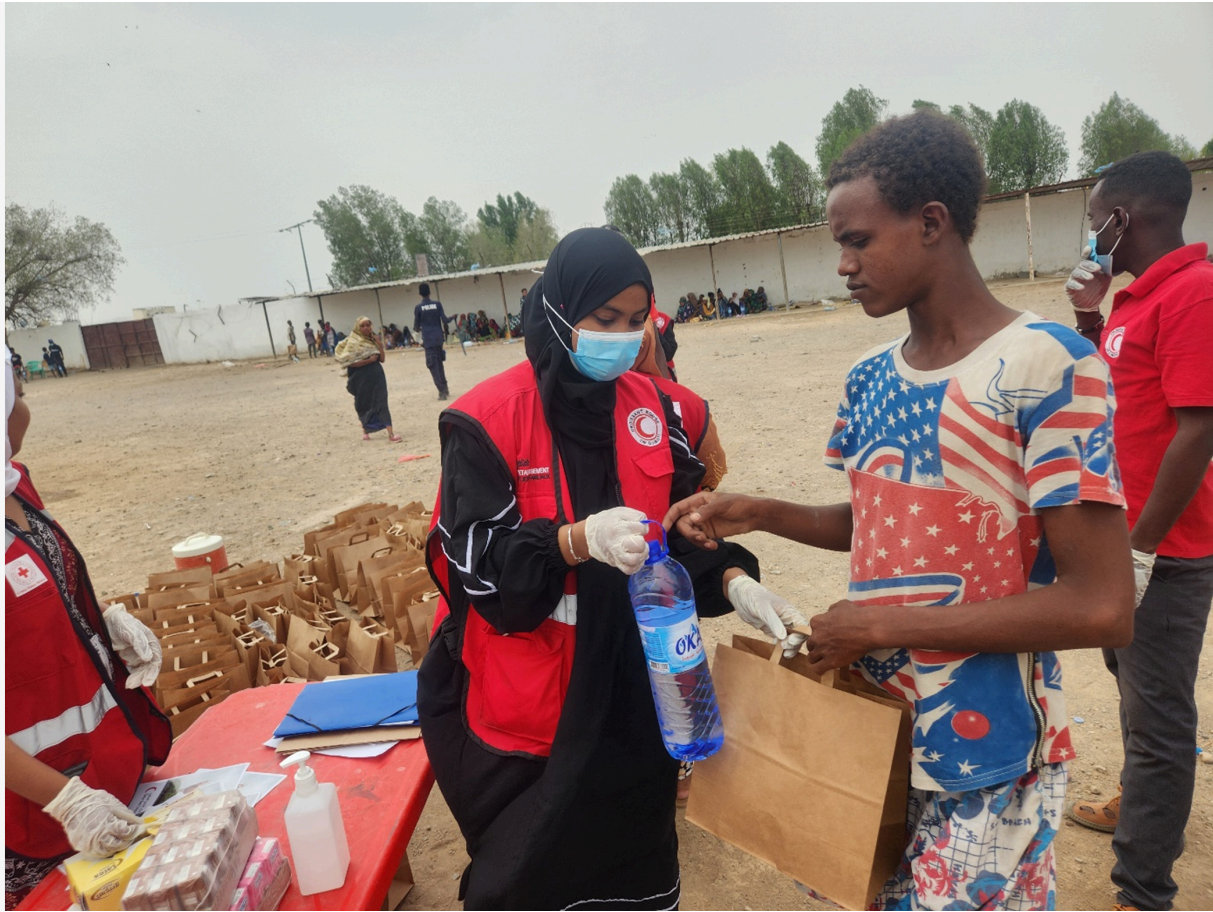
DRCS migration services, DREF Population movement 2025;photo credit to DRCS.