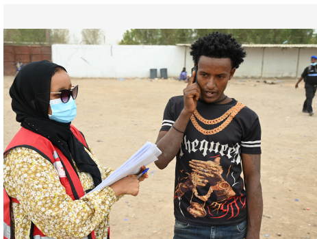
RFL at Nagad Center, Djibouti