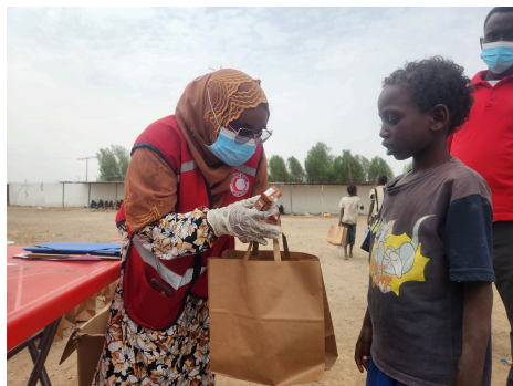
Dry food distribution to migrants in Nagad center, Djibouti

In response to these needs, DREF funding was allocated to the Djibouti Red Crescent Society (DRCS) in June 2025 to support emergency assistance for migrants in transit. Over the course of the operation, DRCS provided lifesaving humanitarian assistance to more than 16,000 individuals through food support and reached over 32,000 individuals with safe drinking water and hygiene services. The intervention helped address critical humanitarian needs while ensuring the dignity, health, and well-being of migrants transiting through the Nagad Transit Centre