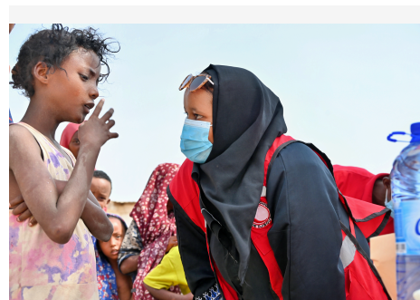
PSS services to migrants in Nagad Transit center, Djibouti.