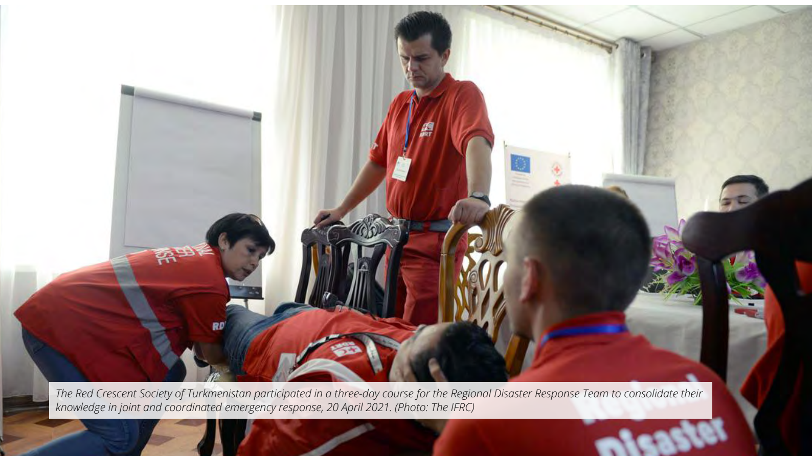
The Red Crescent Society of Turkmenistan participated in a three-day course for the Regional Disaster Response Team to consolidate their knowledge in joint and coordinated emergency response, 20 April 2021.