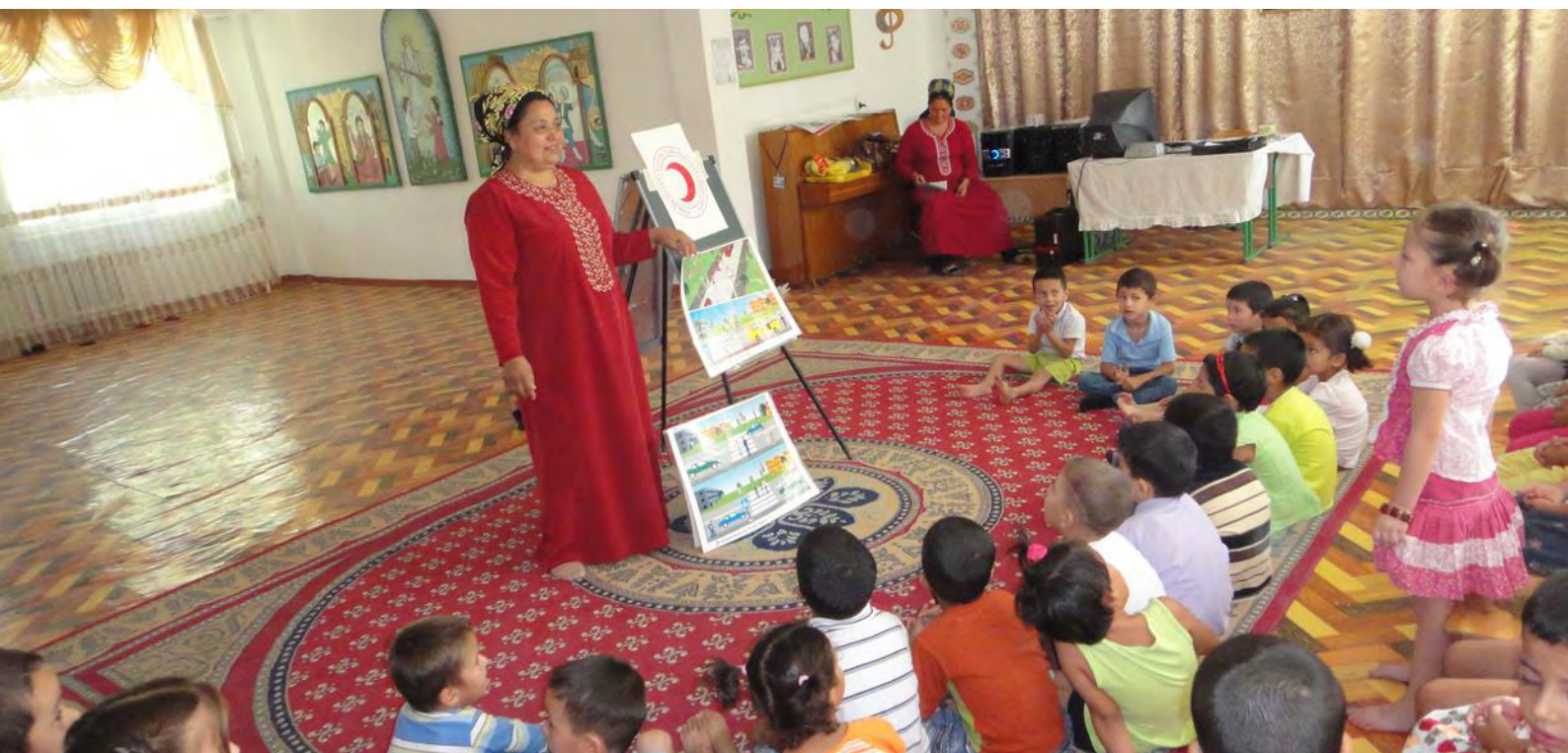
The Red Crescent Society of Turkmenistan organized a first aid training for school and nursery teachers to encourage safe practices in children, 25 October 2022.

The Spanish Red Cross supports the Development of Volunteering in Turkmenistan project. This project aims to enhance and promote volunteering activities within Turkmenistan.