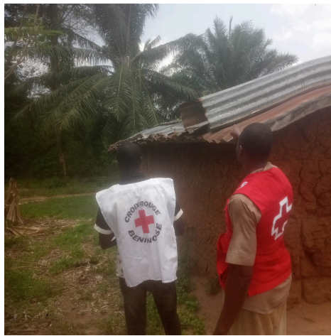
Field visit of volunteers