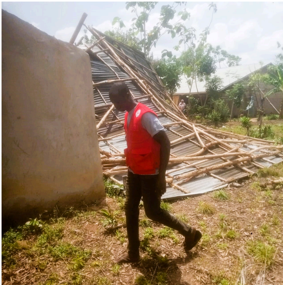
Volunteers assessing the extent of the damage