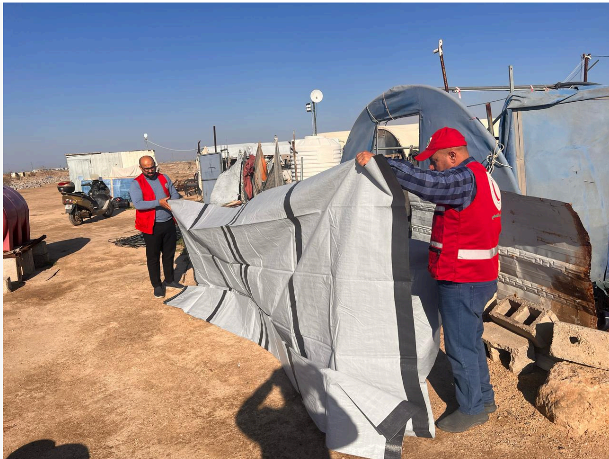
IRCS teams are providing tarpaulin sheets to flood affected families improve their housing conditions