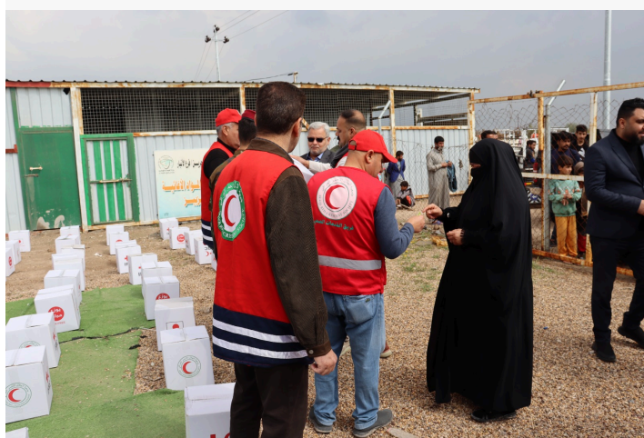
IRCS food assistance to the flood affected families