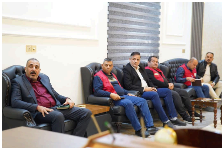
Government authorities meeting with the relevant stakeholders

The heavy rainfall and subsequent flooding have exacerbated the already dire conditions for Internally Displaced Persons (IDPs) in Bzeibiz Camp in Al Anbar. Many IDP camps, which house families displaced by years of conflicts and instability, were severely affected by the floods. Temporary shelters were inundated, leaving families without proper safety and protection. Essential infrastructure, such as water and sanitation facilities damaged, further compromising the living conditions of the displaced population. In Anbar, where thousands of IDPs reside, the floods disrupted access to basic services and humanitarian aid, compounding their vulnerability. Similarly, in southern regions, IDP communities faced significant challenges as floodwaters overwhelmed their camps, forcing many to relocate once again.