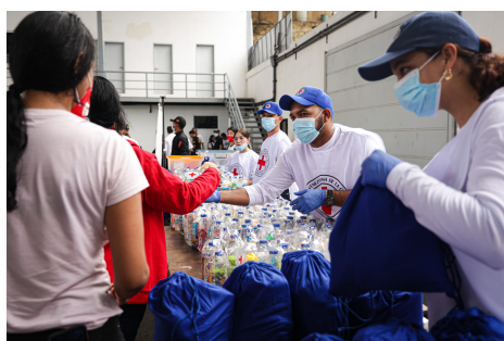
Delivery of kits for returnees. August, 2025.