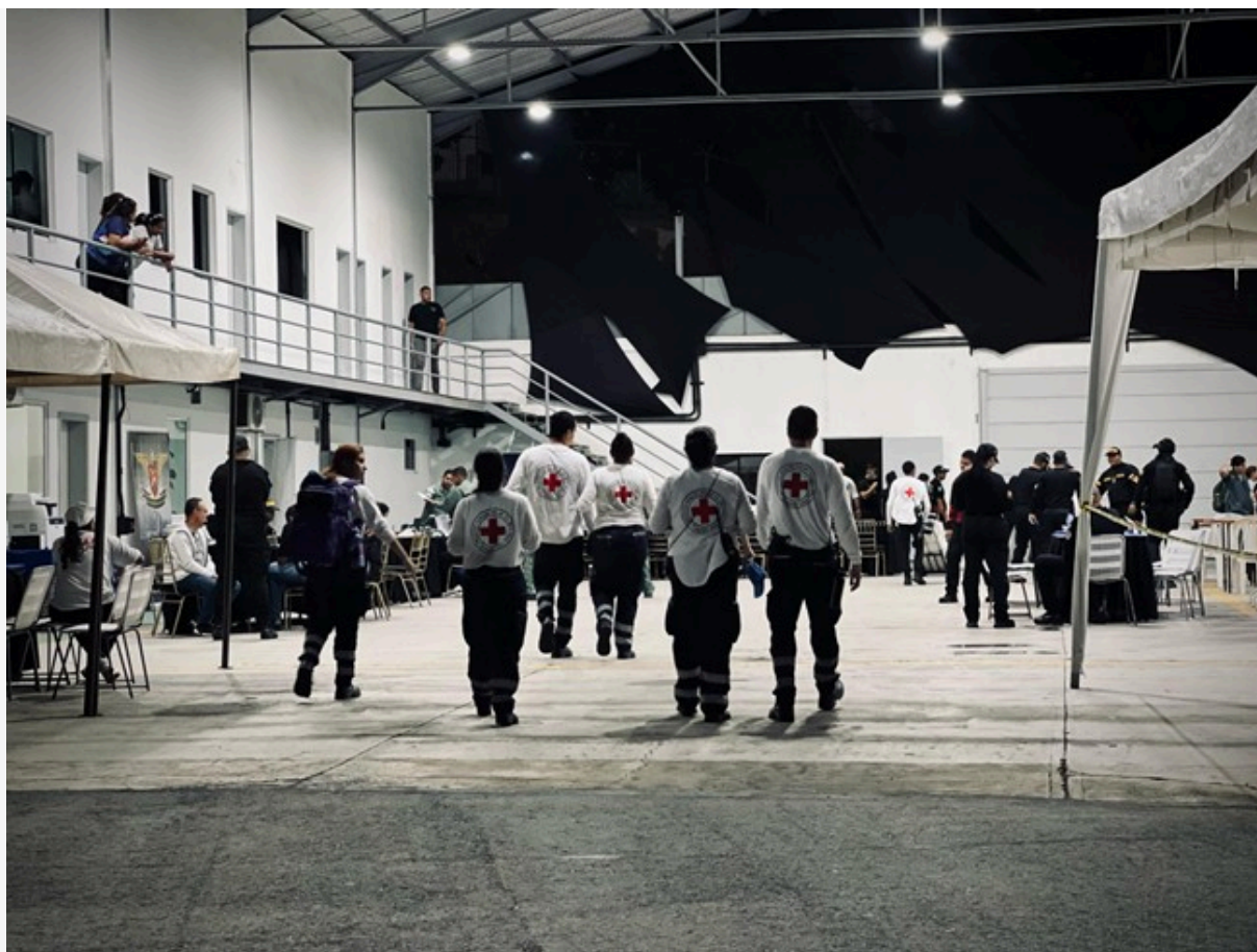
Preparation of hangar for reception. La Guaria, Maiquetía. August 2025