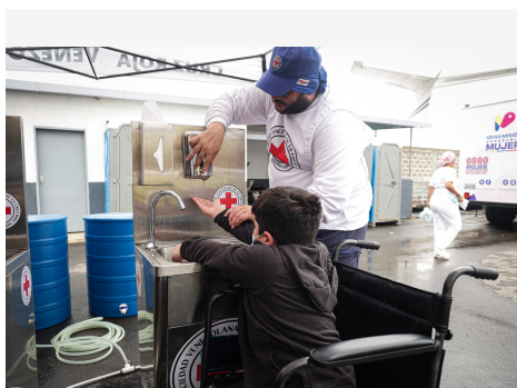
Handwashing stations, August, 2025.