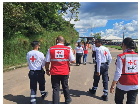
Border Assessment Brazil and Venezuela. August, 2025