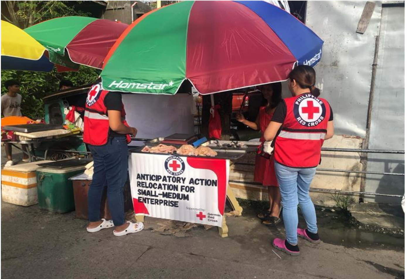
The Philippine Red Cross (PRC) initiated anticipatory action relocation for small and medium enterprises (SMEs) in Cagayan during Severe Tropical Storm Kristine (Trami)