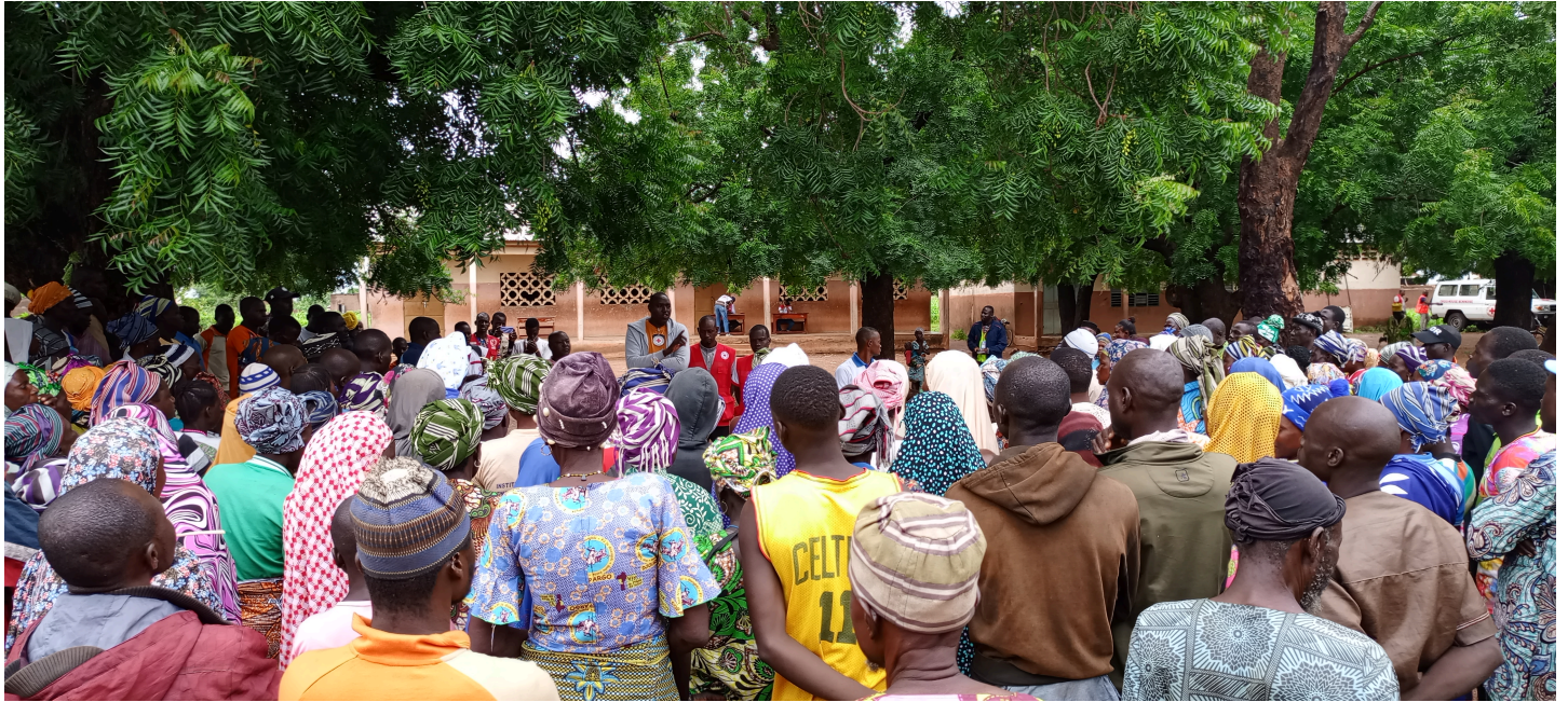
Assistance aux humanitaires de la CRB