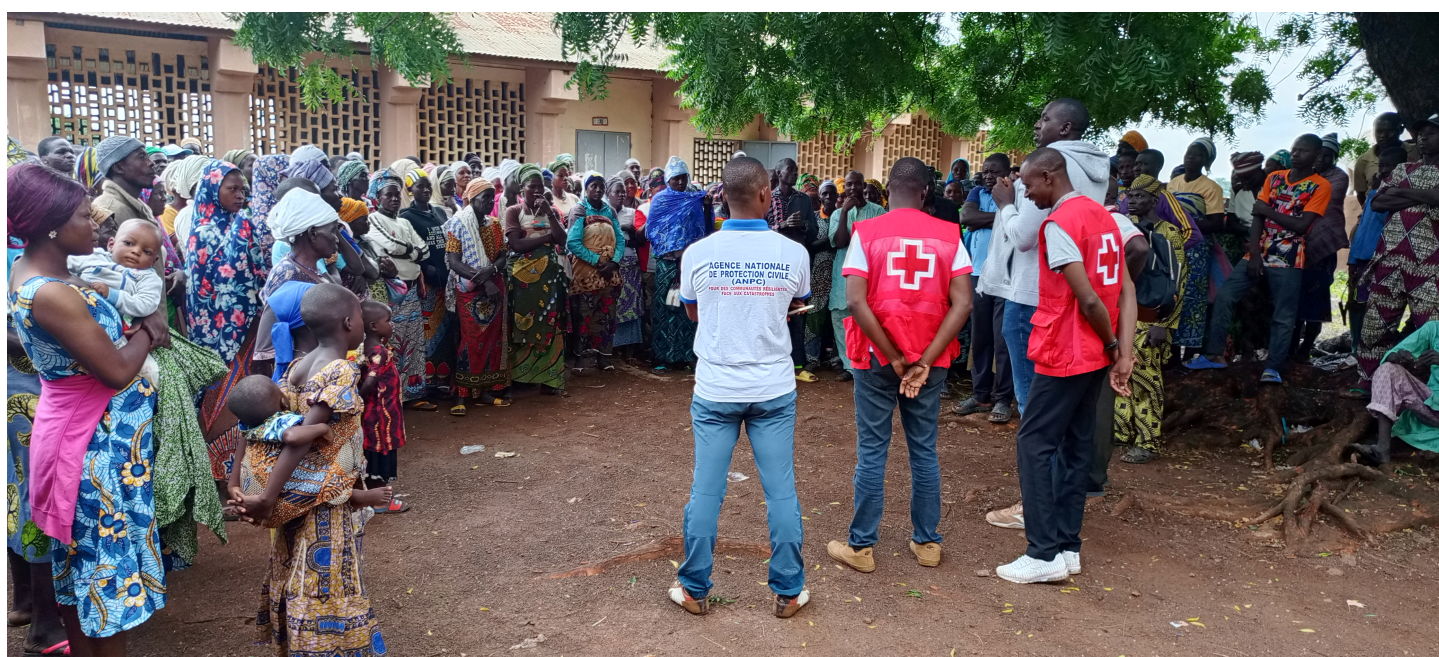
échanges avec PDI et Populations Hôtes

Movement partners alongside with the Benin Red Cross have been active in the concerned departments for several years, but the new waves of displacement between the end of 2024 and the beginning of 2025 require an assessment of the situation and a reinforcement of humanitarian support. On 21 January 2025, the Red Cross of Benin called for a meeting of the Movement's partners (ICRC, IFRC, Swiss, Luxembourg and Flanders Red Cross Societies) to discuss the Movement's approach to the situation and its humanitarian development. However, the censuses are still ongoing. The information gap on the situation and the limitations of current humanitarian action are restricting planning capacity. More data is needed to ensure holistic planning. The need for an evaluation was unanimously expressed. This DREF allocation will contribute to data collection efforts that will make it possible to clarify the situation and the priorities for geographical and sectoral intervention. This allocation will cover a multi-sectoral assessment of the situation with a view to developing a comprehensive humanitarian preparedness and response plan.