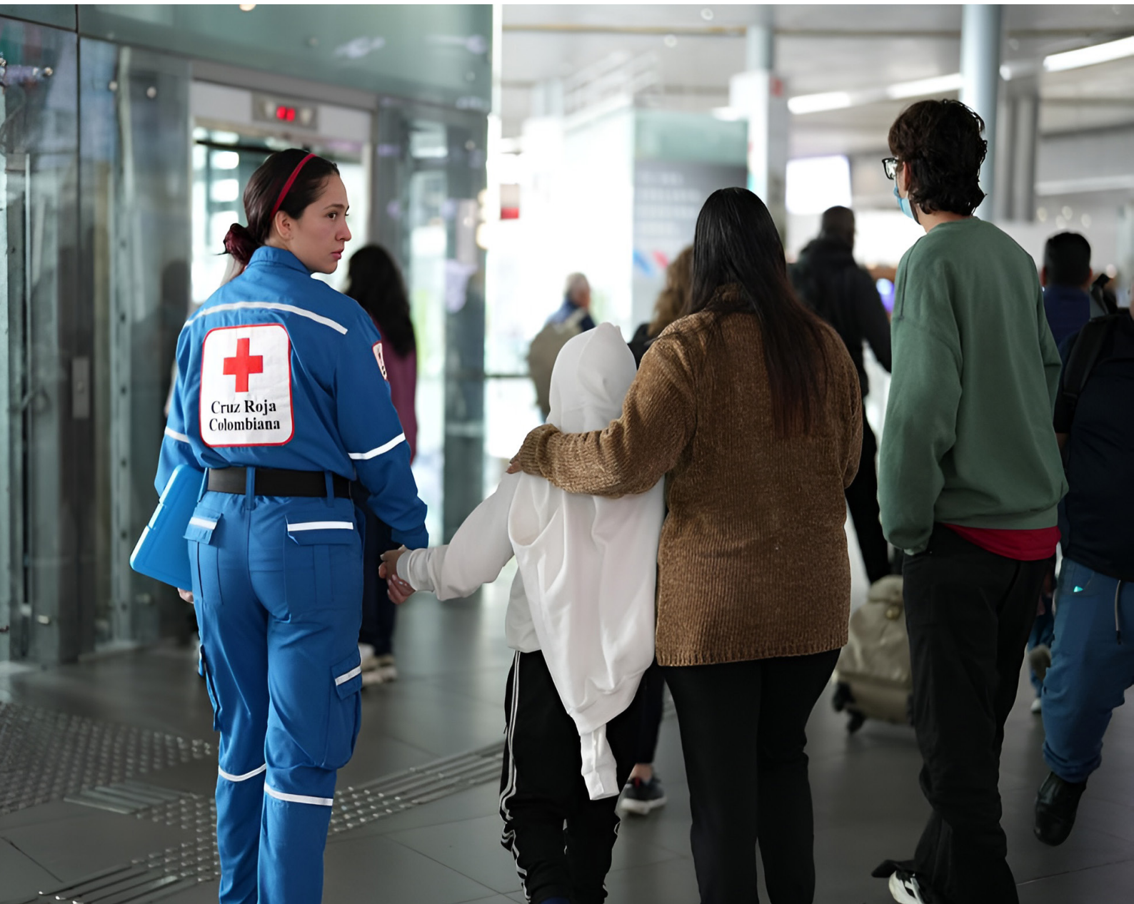
The Colombian Red Cross assisting people deported from the United States with health services, psychosocial support and basic orientation.