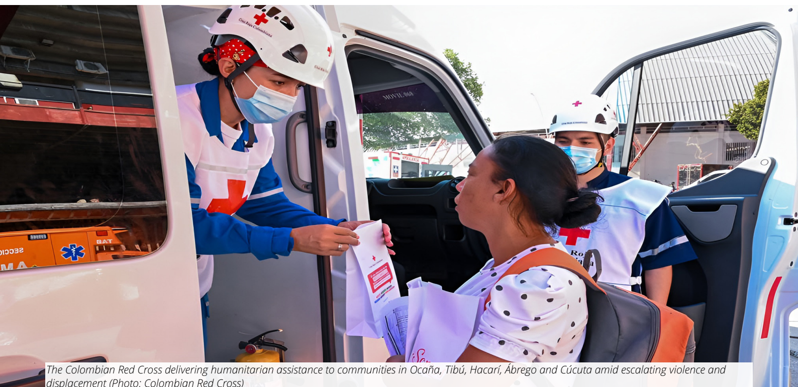
The Colombian Red Cross delivering humanitarian assistance to communities in Ocaña, Tibú, Hacarí, Ábrego and Cúcuta amid escalating violence and displacement

The IFRC provided technical and financial support for the Colombian Red Cross in the implementation of institutional strengthening, capacity development and coordination processes.