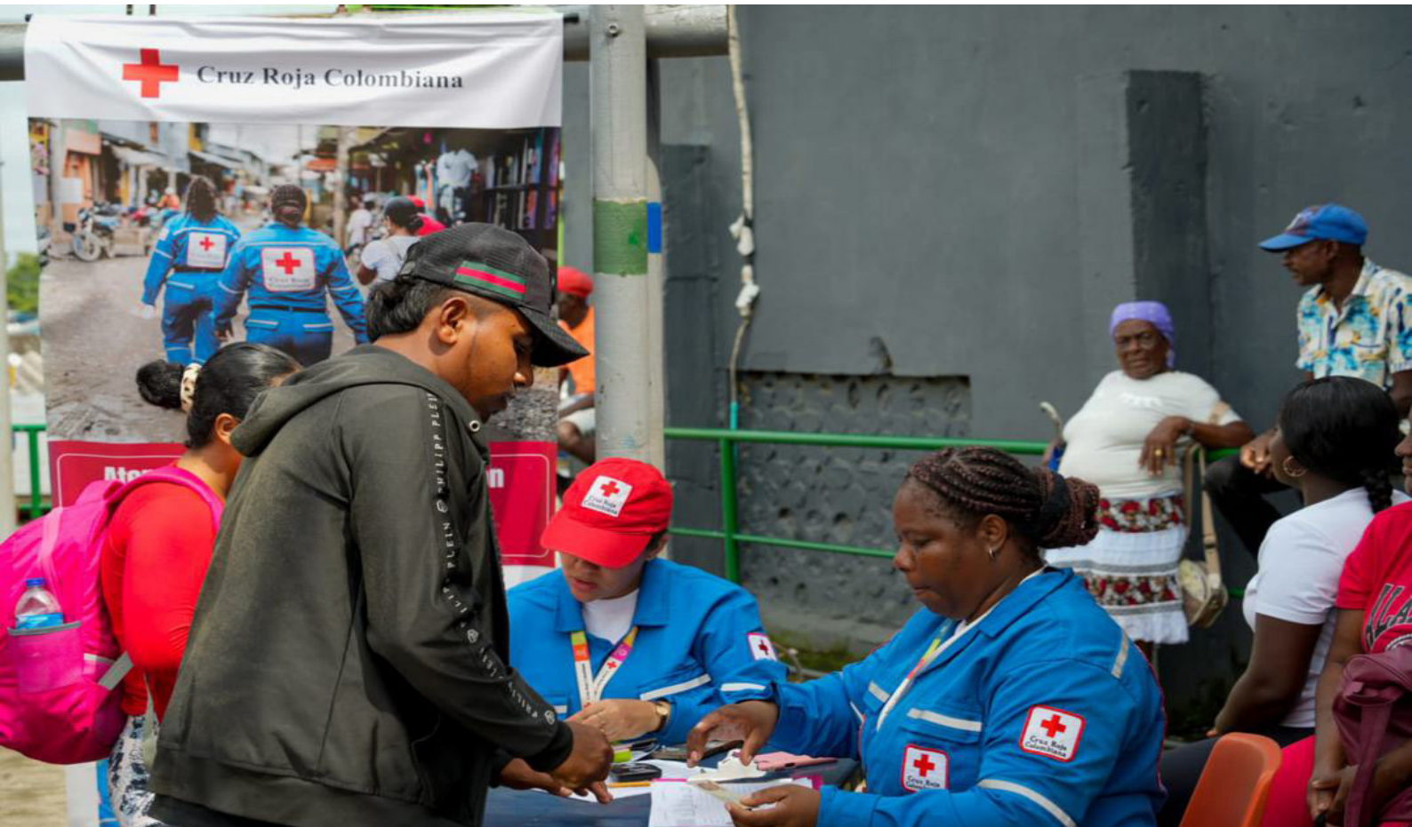
The Colombian Red Cross providing humanitarian assistance by distributing food, hygiene and cooking packages to families impacted by flooding

Through its 510 data and digital initiative, the Netherlands Red Cross supported the National Society in the development and implementation of its Digital Transformation Strategy.